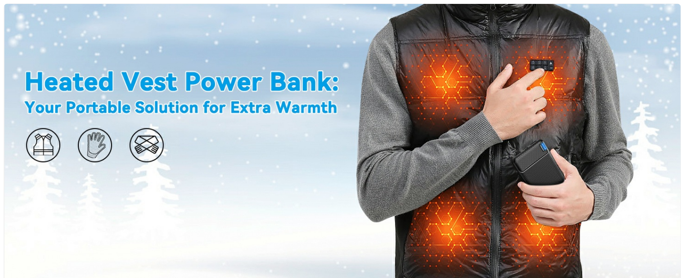
Image: A person wearing a heated vest, with the AsperX power bank connected and providing power, illustrating its use for heated apparel.

Weighing only 223g and being 0.5 inches thick, this power bank is designed for maximum portability. It is airline-approved, making it a safe companion for your travels.