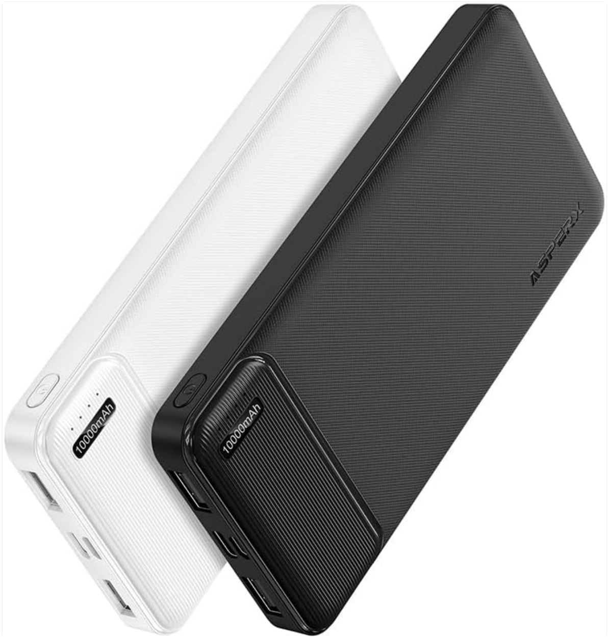
Image: Two AsperX 10000mAh portable chargers, one black and one white, showcasing their compact design and textured finish.

The AsperX 10000mAh portable charger features a sleek design with multiple ports for versatile charging. It includes a USB-C port for both input and output, and two USB-A output ports.