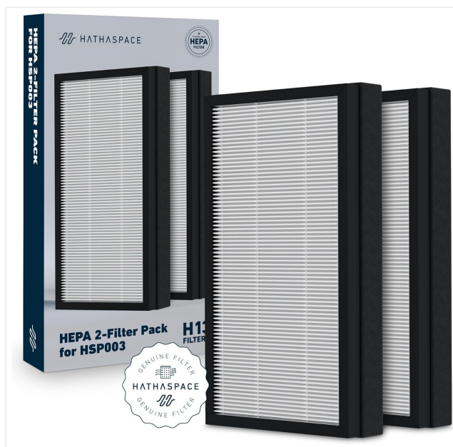
Image: HATHASPACE HSP003 H13 True HEPA Filter Replacement pack, showing two filters in packaging.