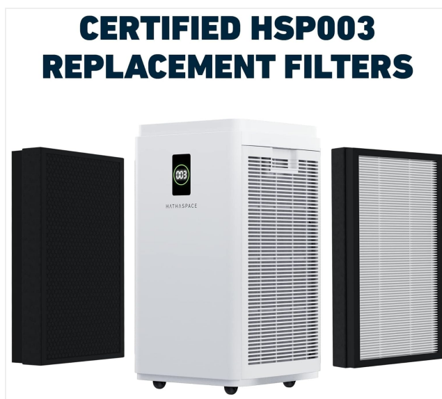
Image: HATHASPACE HSP003 Air Purifier with its two replacement filters (Activated Carbon and H13 True HEPA) displayed alongside.