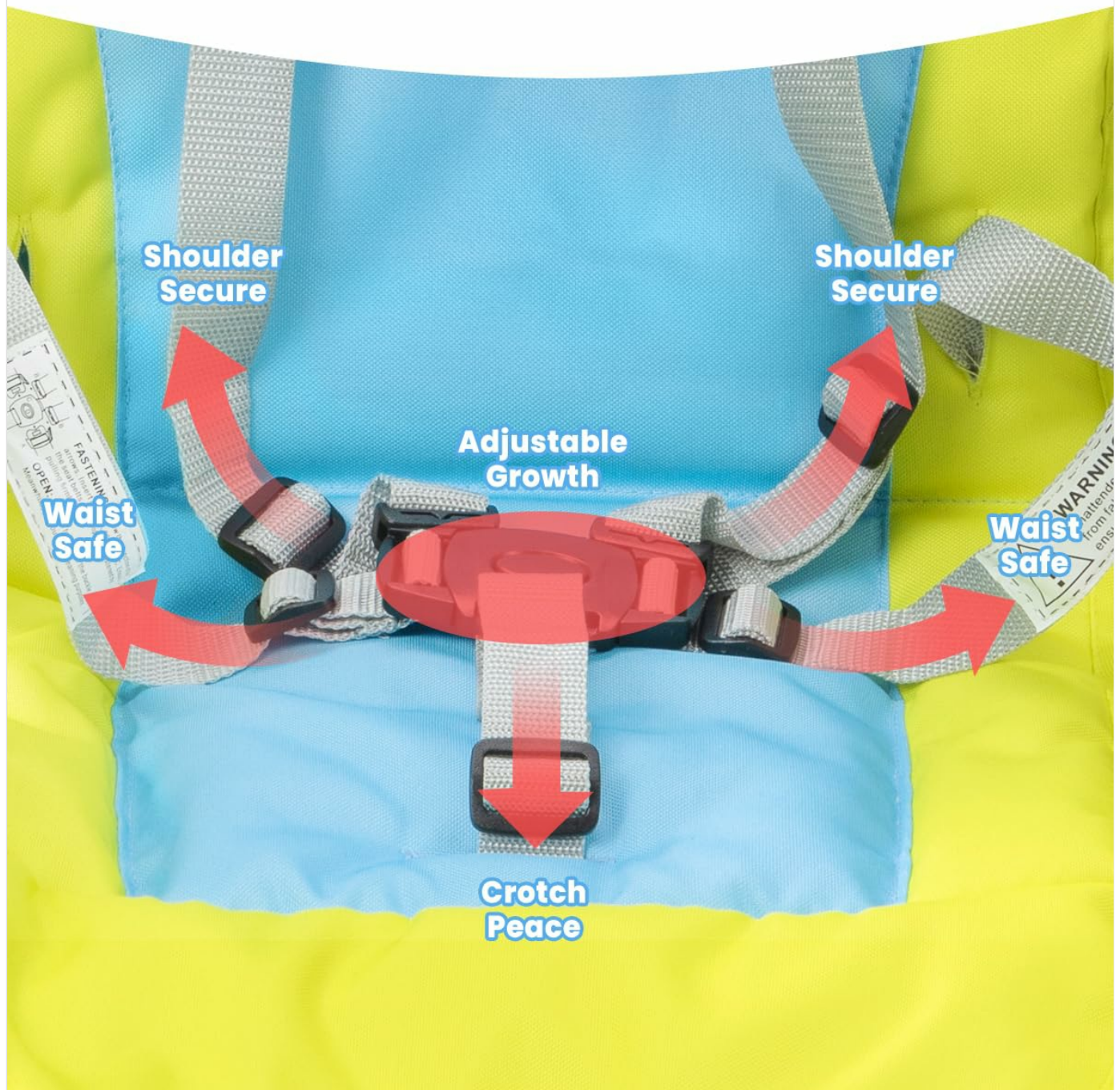
Image: A detailed view of the 5-point safety harness, highlighting the shoulder, waist, and crotch straps designed for secure and adjustable fit for growing children.