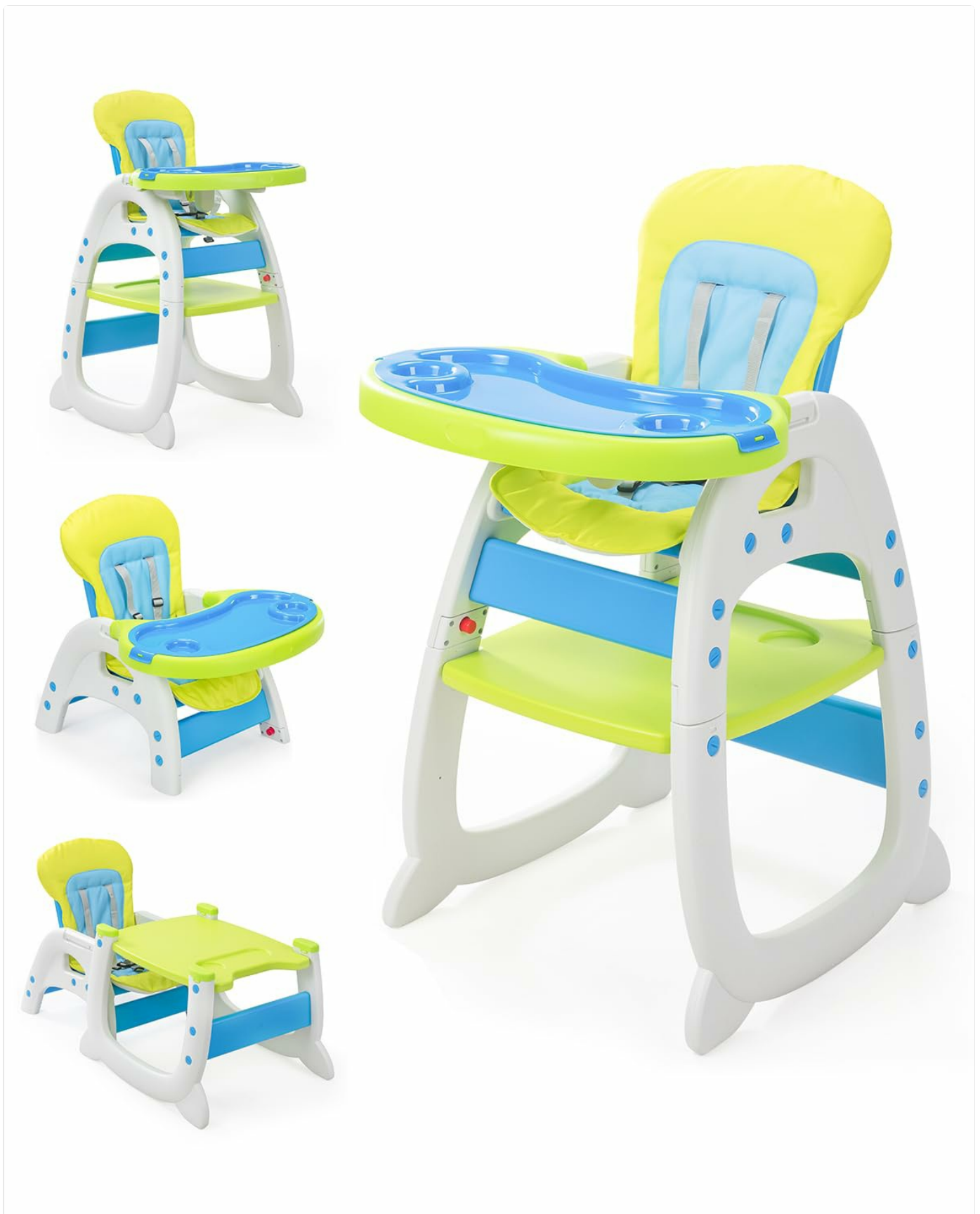
Image: The SANDINRAYLI 3-in-1 Convertible High Chair shown in its full high chair configuration, a lower standalone chair configuration, and a separate table and chair configuration. The product features a green and blue color scheme with a white frame.