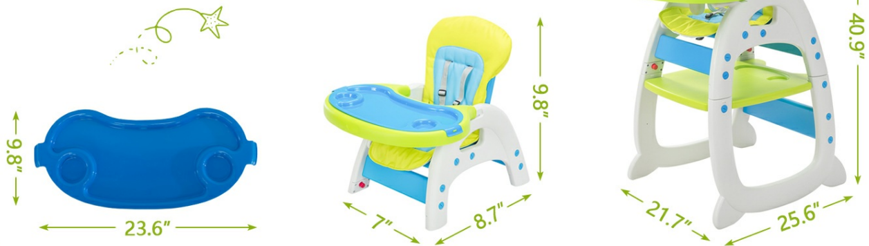
Image: A composite image demonstrating various adjustable features, including the removal of the feeding tray, adjustment of the safety harness straps, and the use of a red release button for structural changes.

Crafted with love, designed for comfort. Because every detail matters.