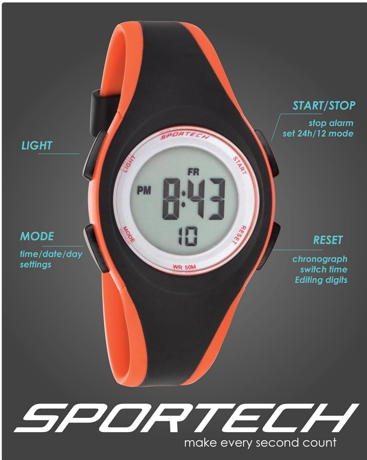
Image: Front view of the Sportech SP147 watch, indicating the location and primary function of each button: LIGHT (top left), MODE (bottom left), START/STOP (top right), and RESET (bottom right).