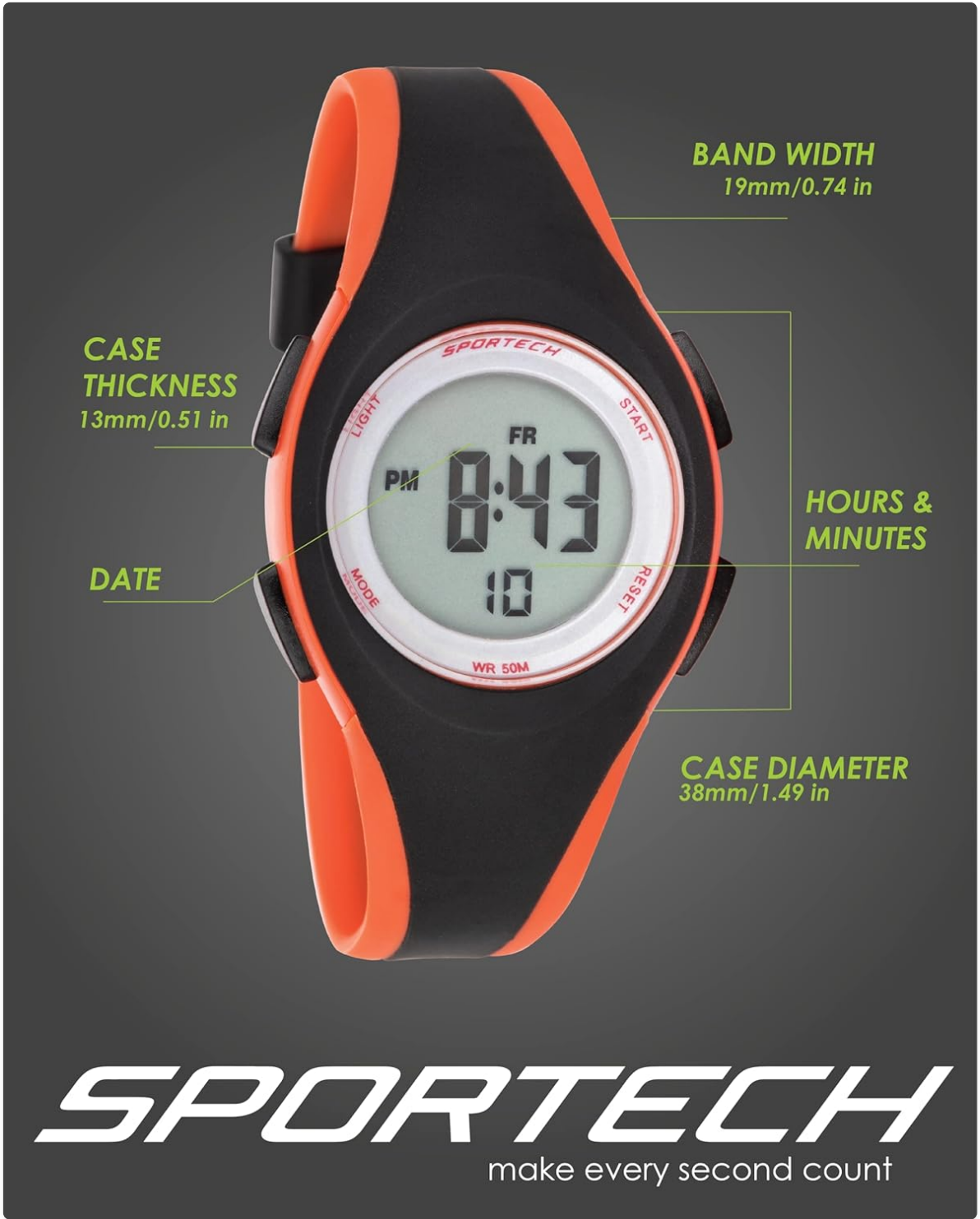
Image: Front view of the Sportech SP147 watch with key dimensions such as case thickness, case diameter, and band width clearly labeled.