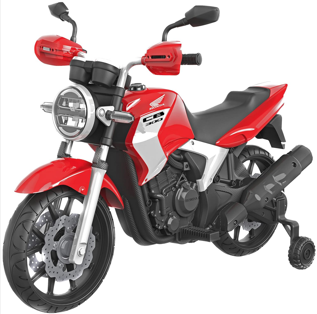
Image: Front-side view of the red Honda CB300R 12V ride-on motorcycle with training wheels.