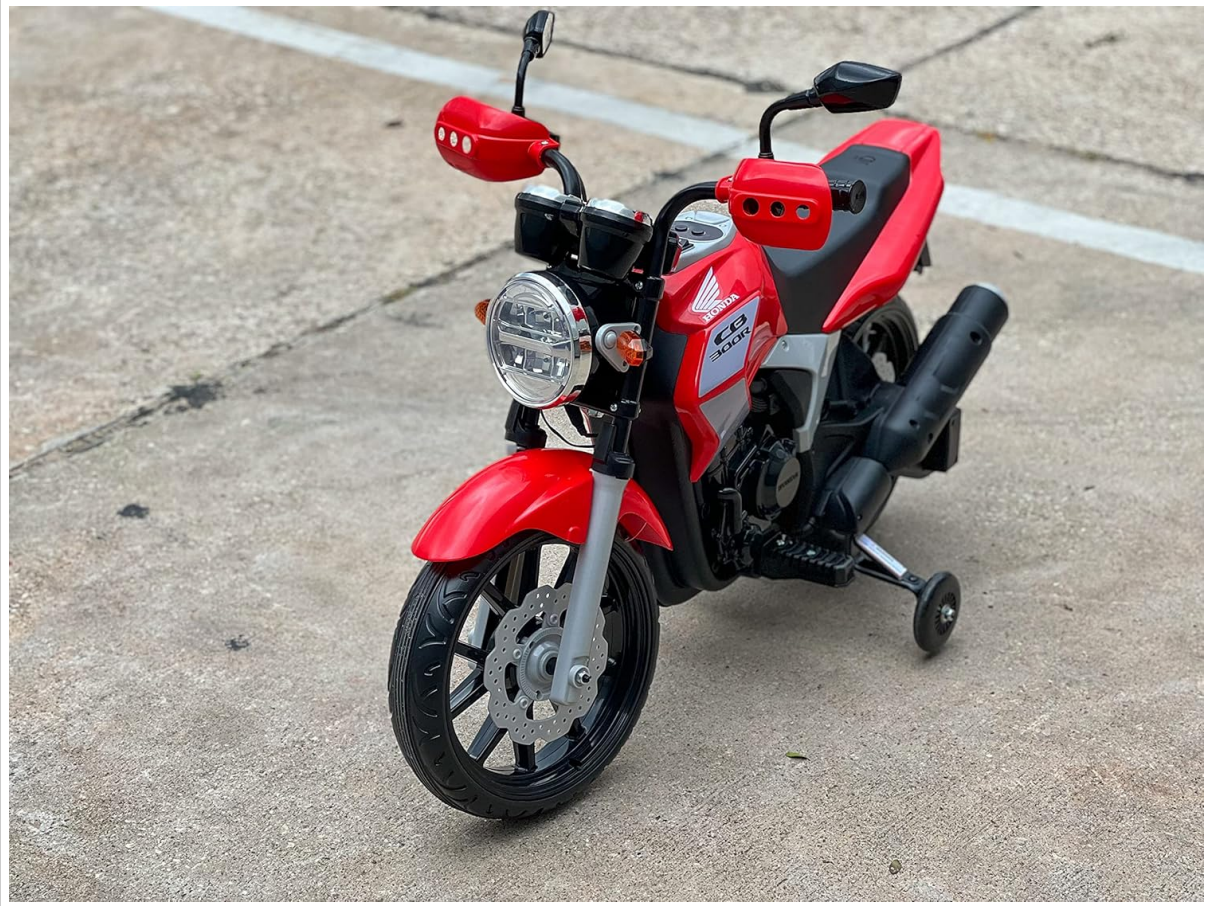
Image: Side view of the Honda CB300R 12V ride-on motorcycle, showing its overall structure.