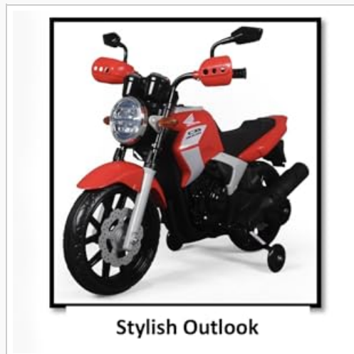
Image: Close-up of the Honda CB300R, emphasizing its stylish design and realistic details.

Your browser does not support the video tag.