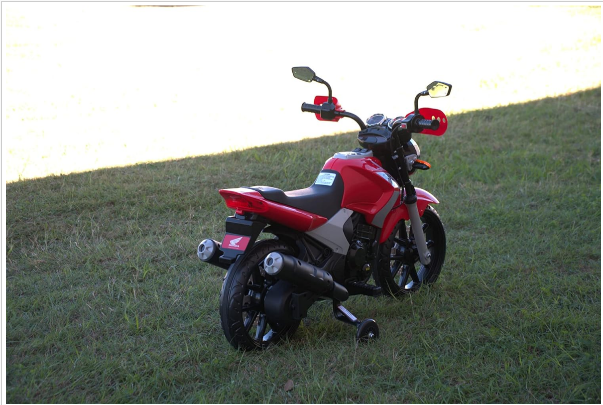
Image: Rear view of the Honda CB300R 12V ride-on motorcycle, showing the robust rear wheel and training wheels.

When moving the ride-on car, avoid lifting it by the steering wheel, as this can damage internal wiring. Always lift the vehicle from underneath its main body.