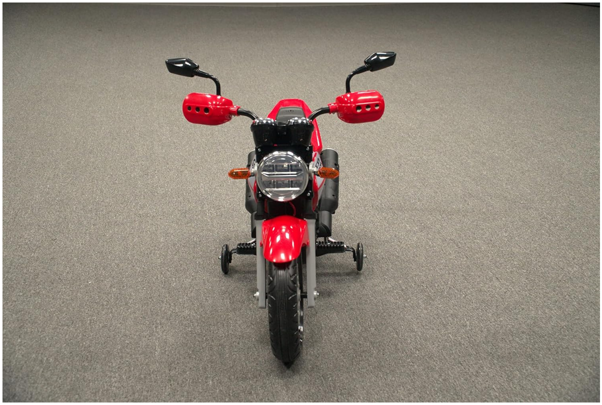
Image: Front view of the Honda CB300R 12V ride-on motorcycle, highlighting the realistic handlebar and headlight.