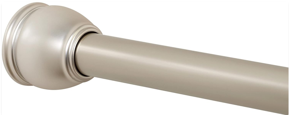
Image 1.1: Close-up view of the brushed nickel tension rod, highlighting its finial design.

The rod features rustproof aluminum construction and a brushed nickel finish, designed for durability and aesthetic appeal. It offers an adjustable length range from 26 to 76 inches, accommodating a wide variety of spaces without the need for drilling or permanent fixtures.