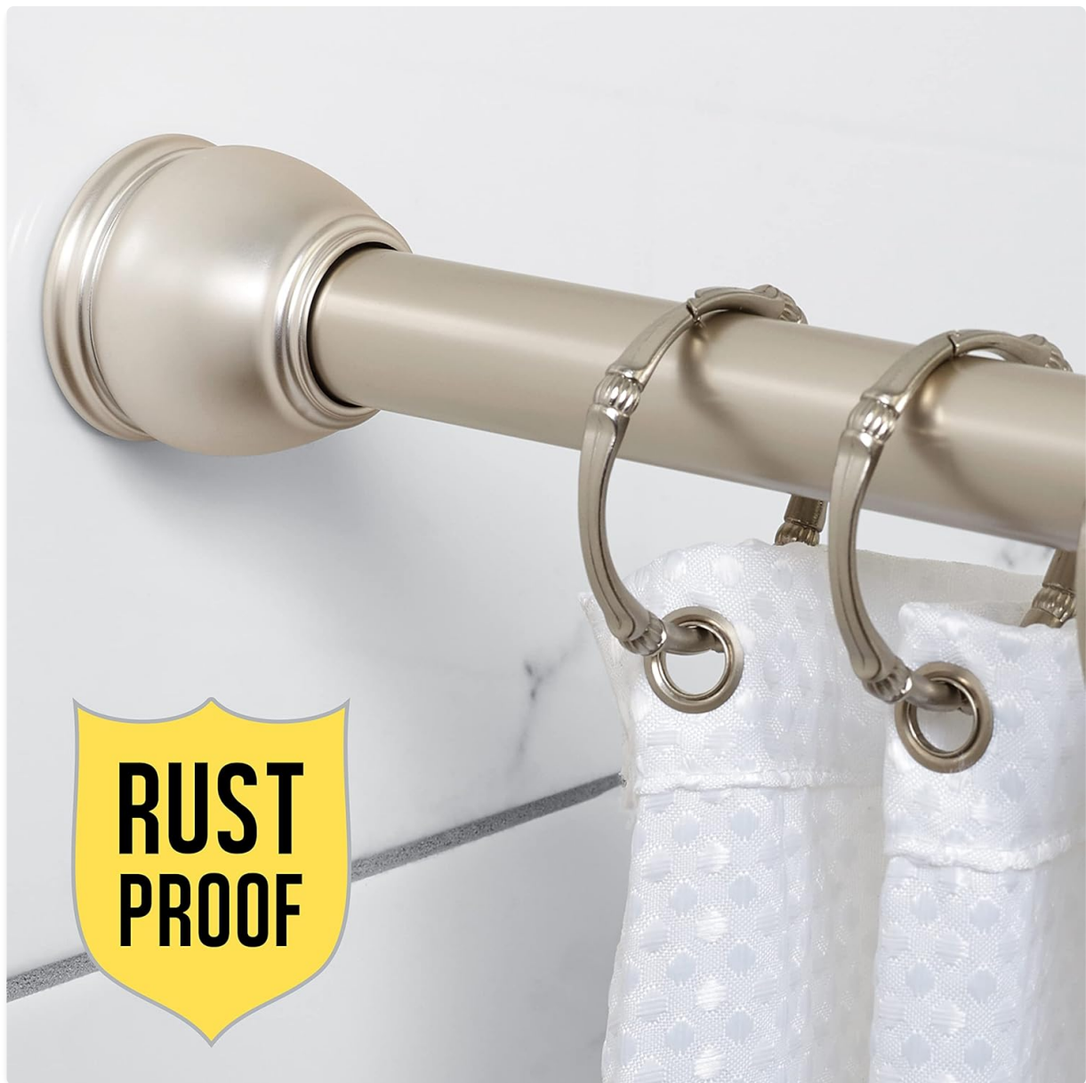
Image 4.2: The rustproof tension rod securely installed in a shower setting.