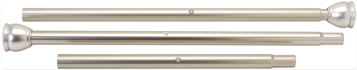
Image 3.1: Individual components of the adjustable tension rod (segments A, B, and C).