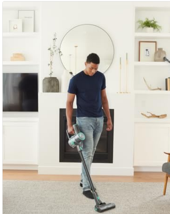
Figure 6: The lightweight design makes it easy to maneuver.

To use an attachment, detach the main unit from the standard tube and connect the desired tool directly to the main unit or the standard tube, depending on the cleaning area.