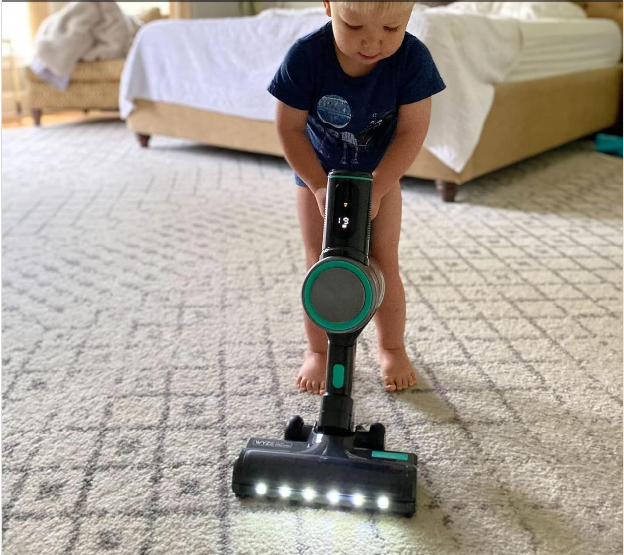
Figure 1: Fully assembled Wyze Cordless Vacuum Cleaner.