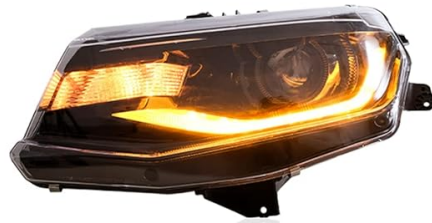
Image 1.3: Demonstration of the sequential indicator function of the VLAND Headlight.