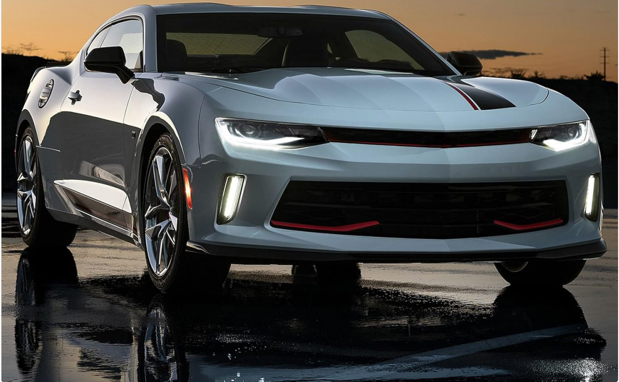
Image 1.1: Vehicle compatibility for VLAND Headlights, showing a Chevrolet Camaro from 2016-2018.