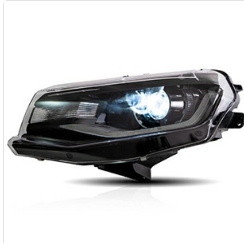
Image 3.2: The VLAN D Headlight demonstrating its sequential turn signal functionality.