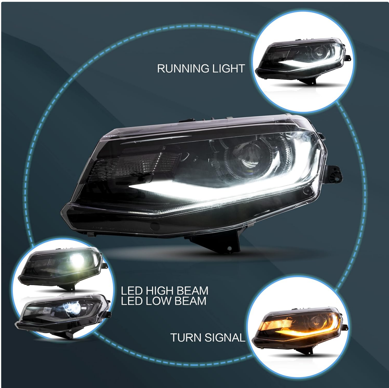
Image 1.2: Illustration of the headlight's various lighting functions, including running light, LED high beam, LED low beam, and turn signal.