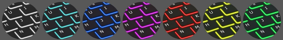
Image: A close-up view of the keyboard keys illuminated in various colors, demonstrating the 7-color, 3-level brightness backlight feature.