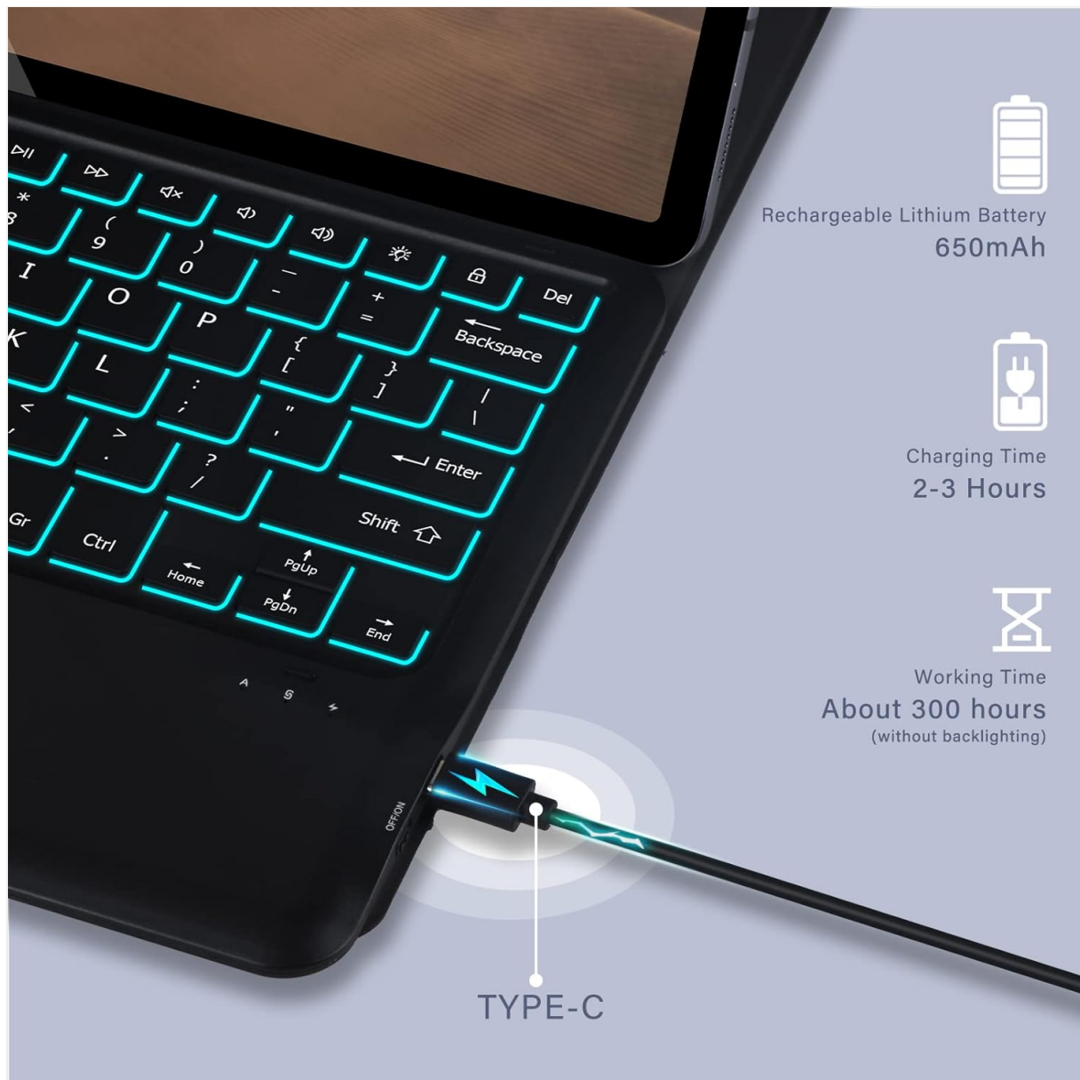
Image: The keyboard's USB-C charging port is located on the side. Connect the provided USB-C cable to charge the internal 650mAh rechargeable lithium battery. Charging typically takes 2-3 hours.

Before initial use, fully charge the keyboard using the provided USB-C charging cord.