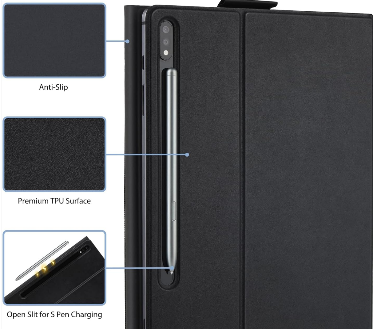
Image: A detailed view of the case's side, illustrating the dedicated slot for the S Pen, which also facilitates charging.