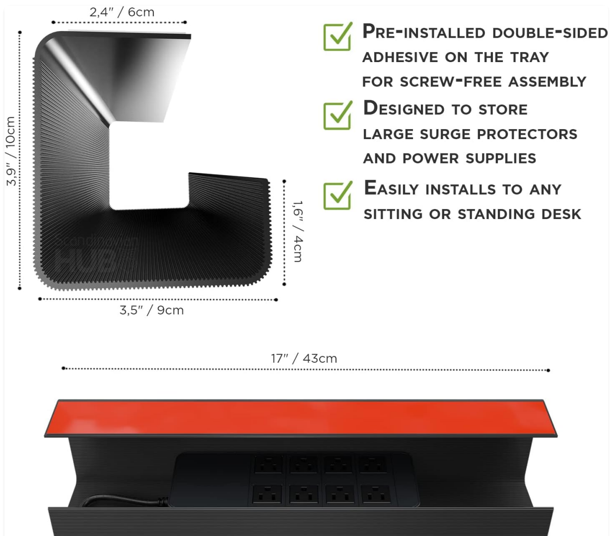
Image: Detailed dimensions of the cable management tray.