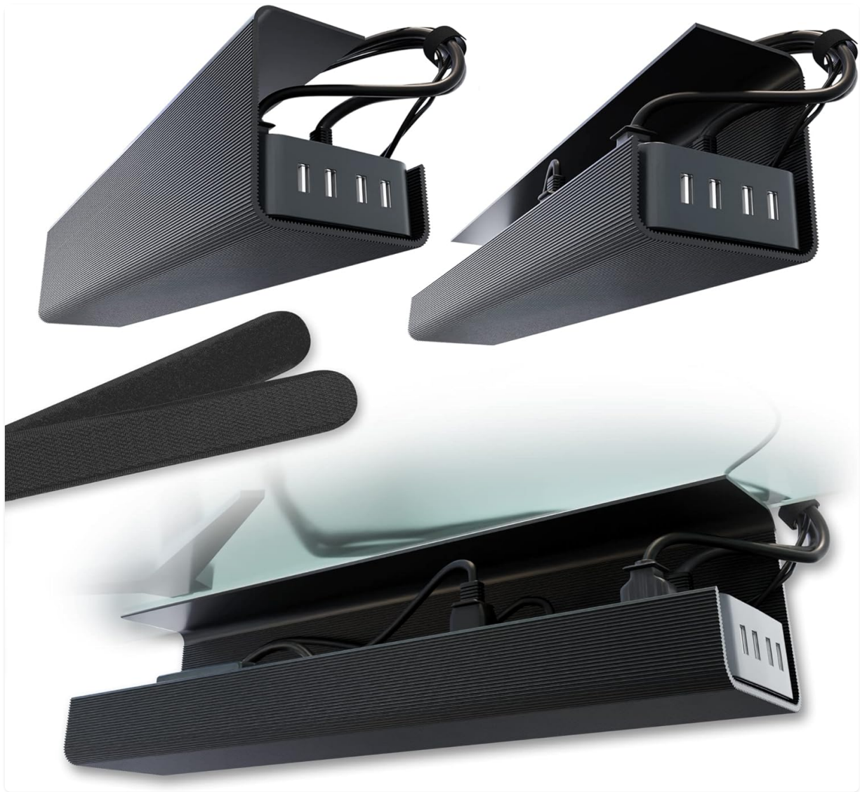
Image: Example of the cable management trays in use, organizing cables and a power strip under a desk.