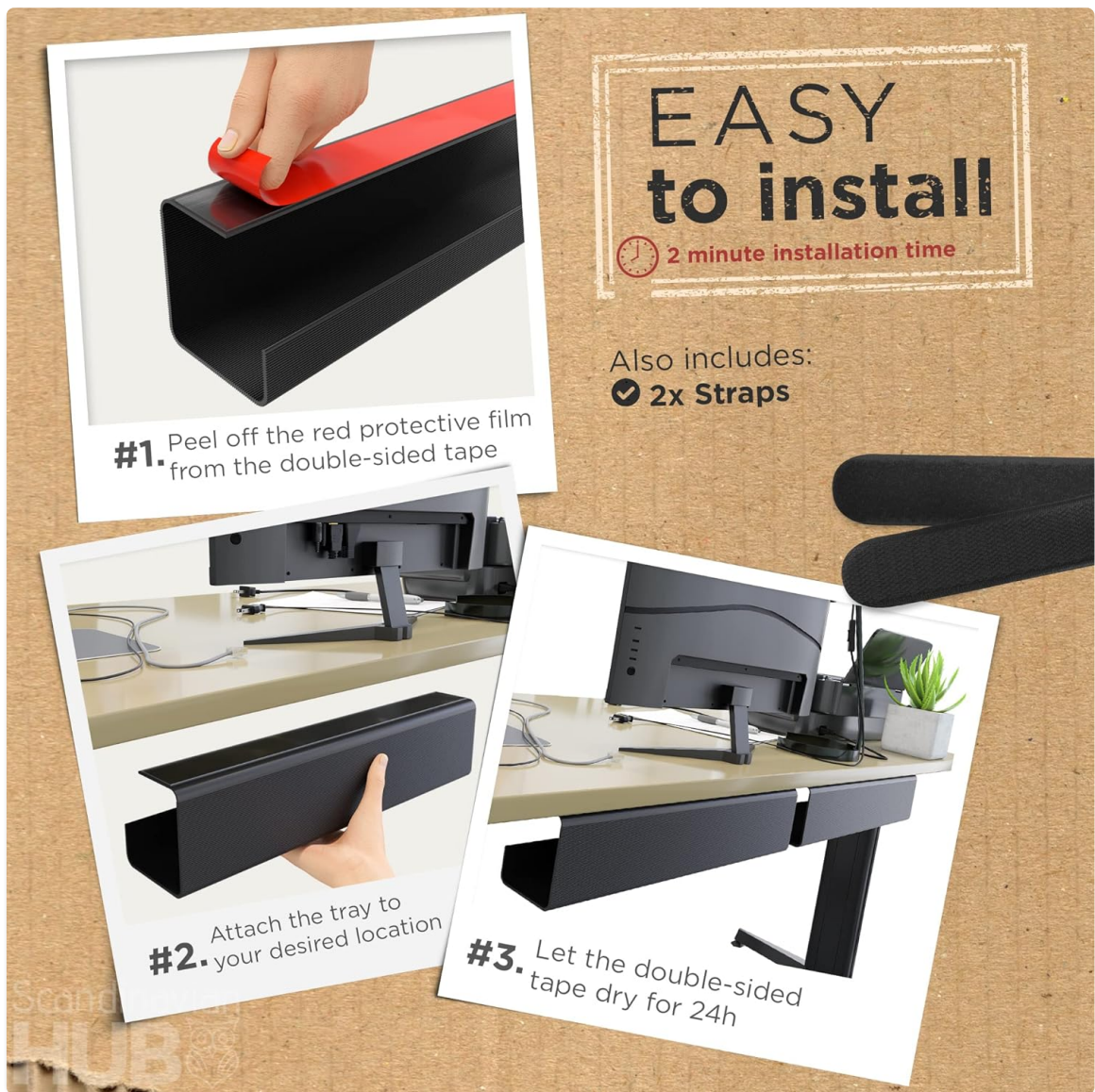
Image: Step 1 - Peeling the protective film.