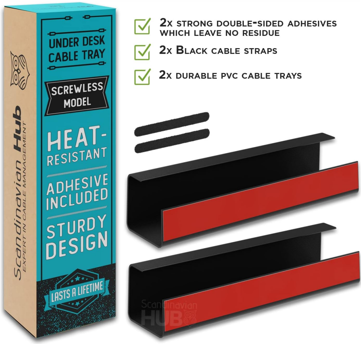
Image: Contents of the Scandinavian Hub Cable Management Tray package.