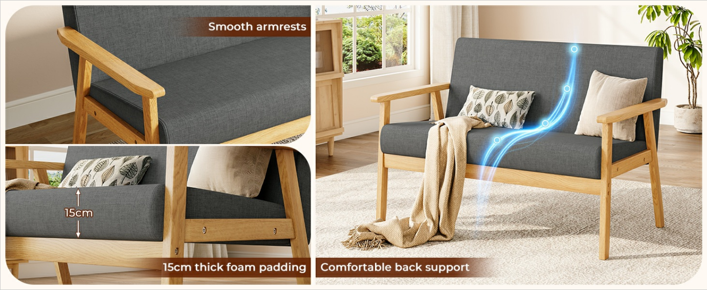
Image: Details of sofa materials: high-density sponge, teddy velvet, and wooden frame.