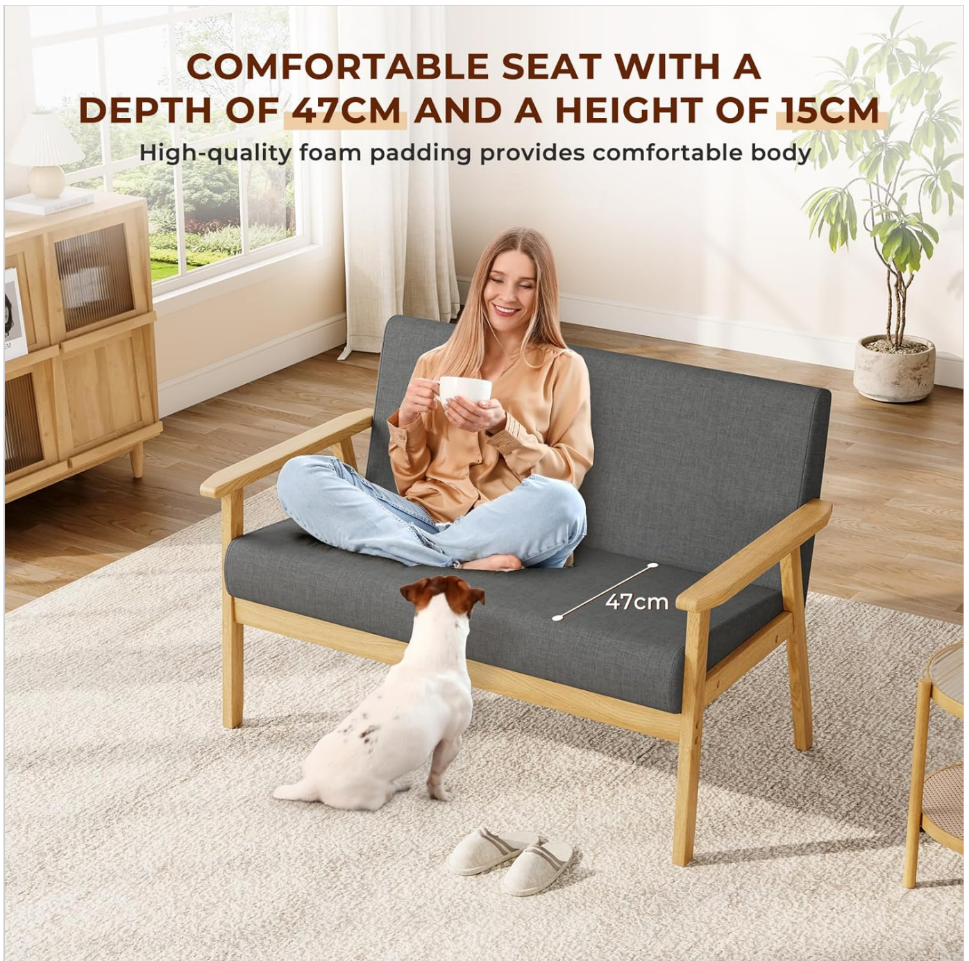
Image: User demonstrating comfortable seating on the sofa.

High-quality foam padding provides comfortable body