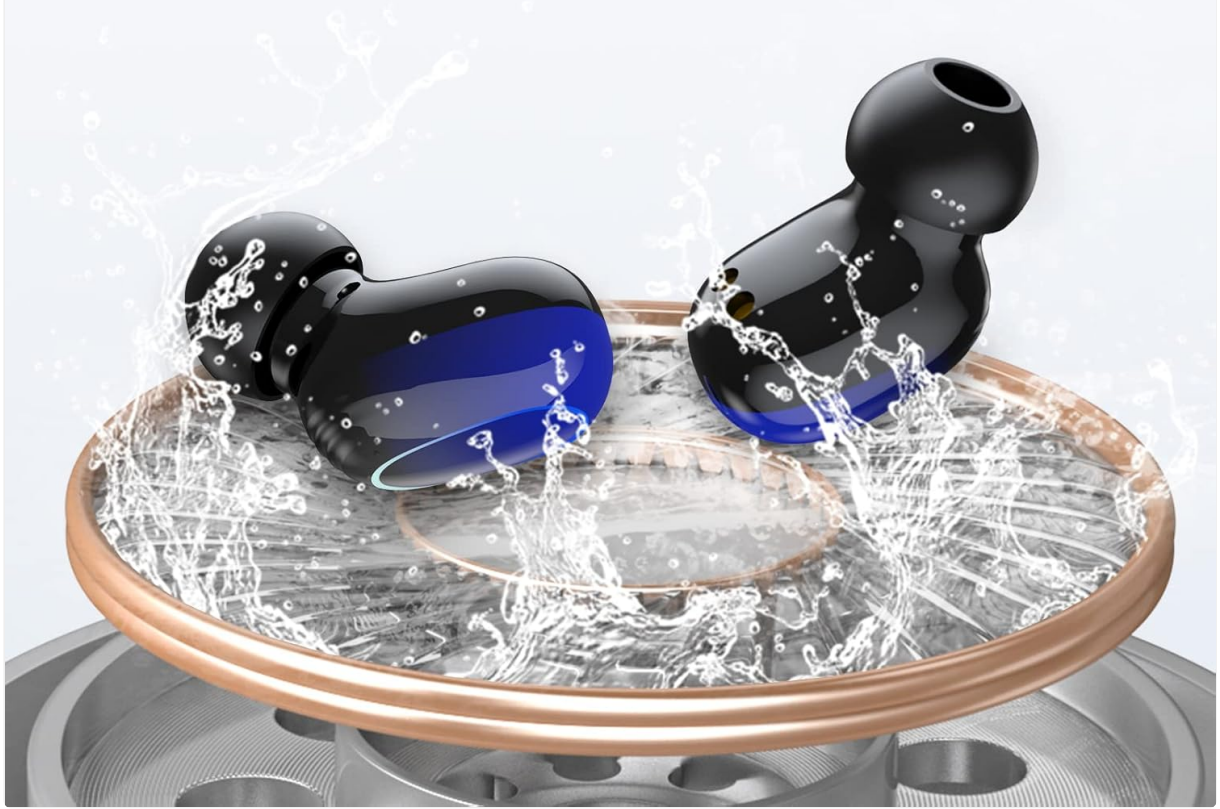
Image 9.1: The 10mm immersive drivers deliver enhanced sound quality with deeper bass.

I driver immersivi da 10 mm offrono un suono generoso, il 40% in più di bassi e il 100% in più di alti.