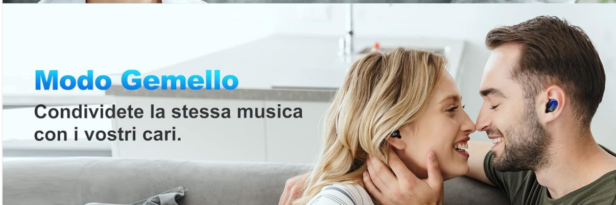
Image 6.2: The earbuds can be used in mono mode (single earbud) to stay aware of surroundings, TWS stereo mode for immersive sound, or twin mode to share music with another person.

Condividete la stessa musica con i vostri cari.