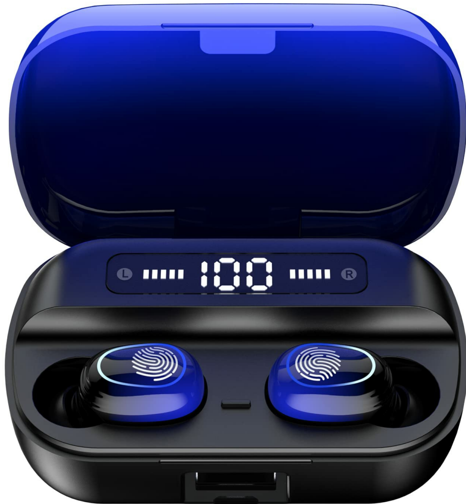
Image 4.1: Overview of Kinganda Q71 Bluetooth Earbuds and key features including Bluetooth 5.1, low latency, low power consumption, touch control, clear calls, 10mm speakers, compatibility with iOS and Android, and a 33-foot signal range.