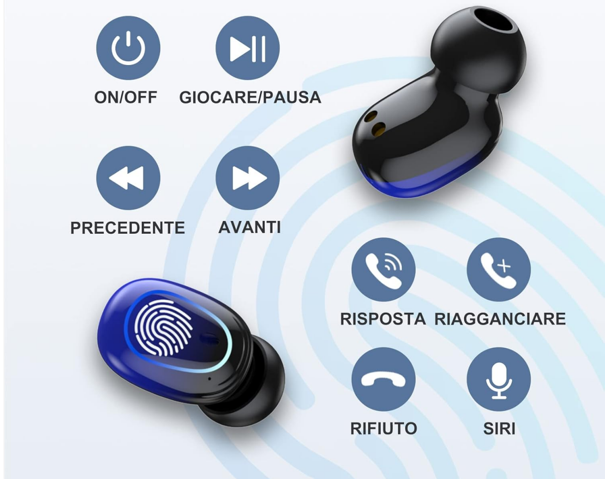
Image 6.1: Touch controls for various functions including power, music playback, call management, and voice assistant activation.

Più conveniente per te quando ascolti la musica e fai chiamate.