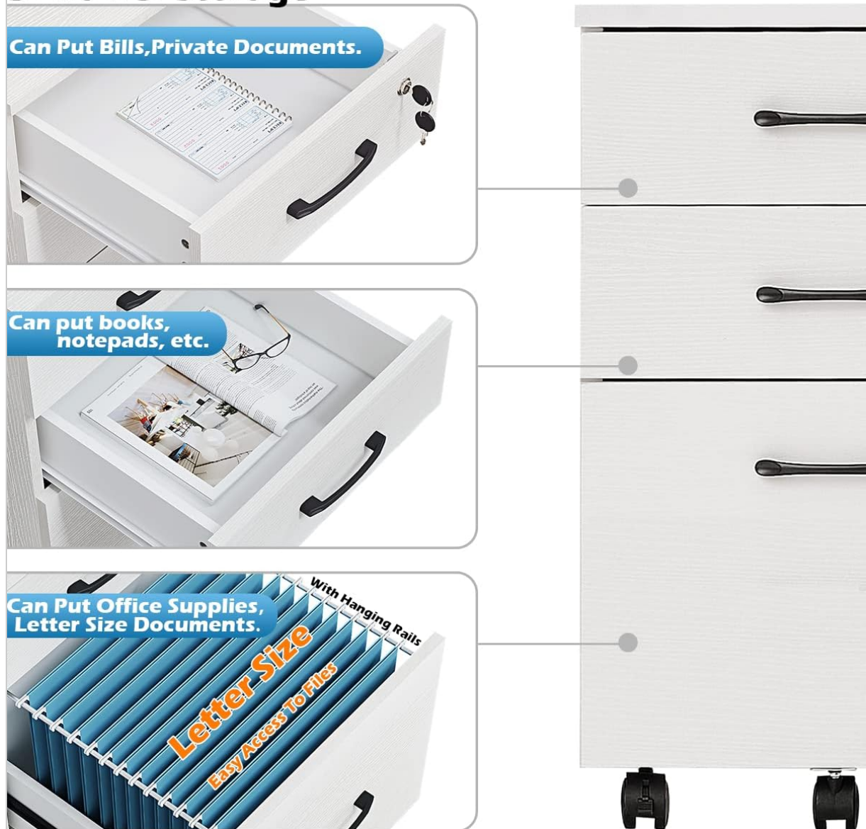
Image 3: Illustration of the three drawers, showing the top two for bills and notepads, and the bottom drawer with hanging rails for letter-size documents.