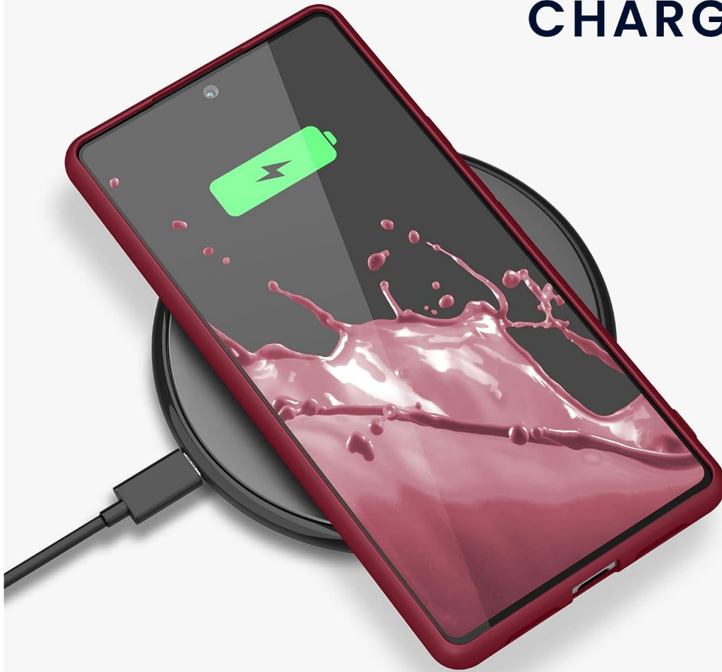
Image: Google Pixel 6 in its kwmobile case charging wirelessly.