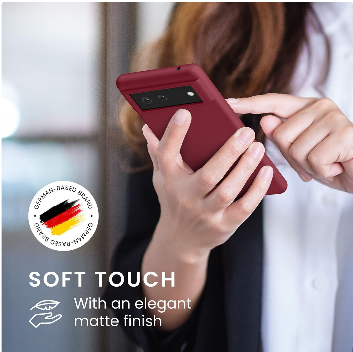
Image: A hand holding the Google Pixel 6 with the kwmobile case, highlighting its soft-touch matte finish.