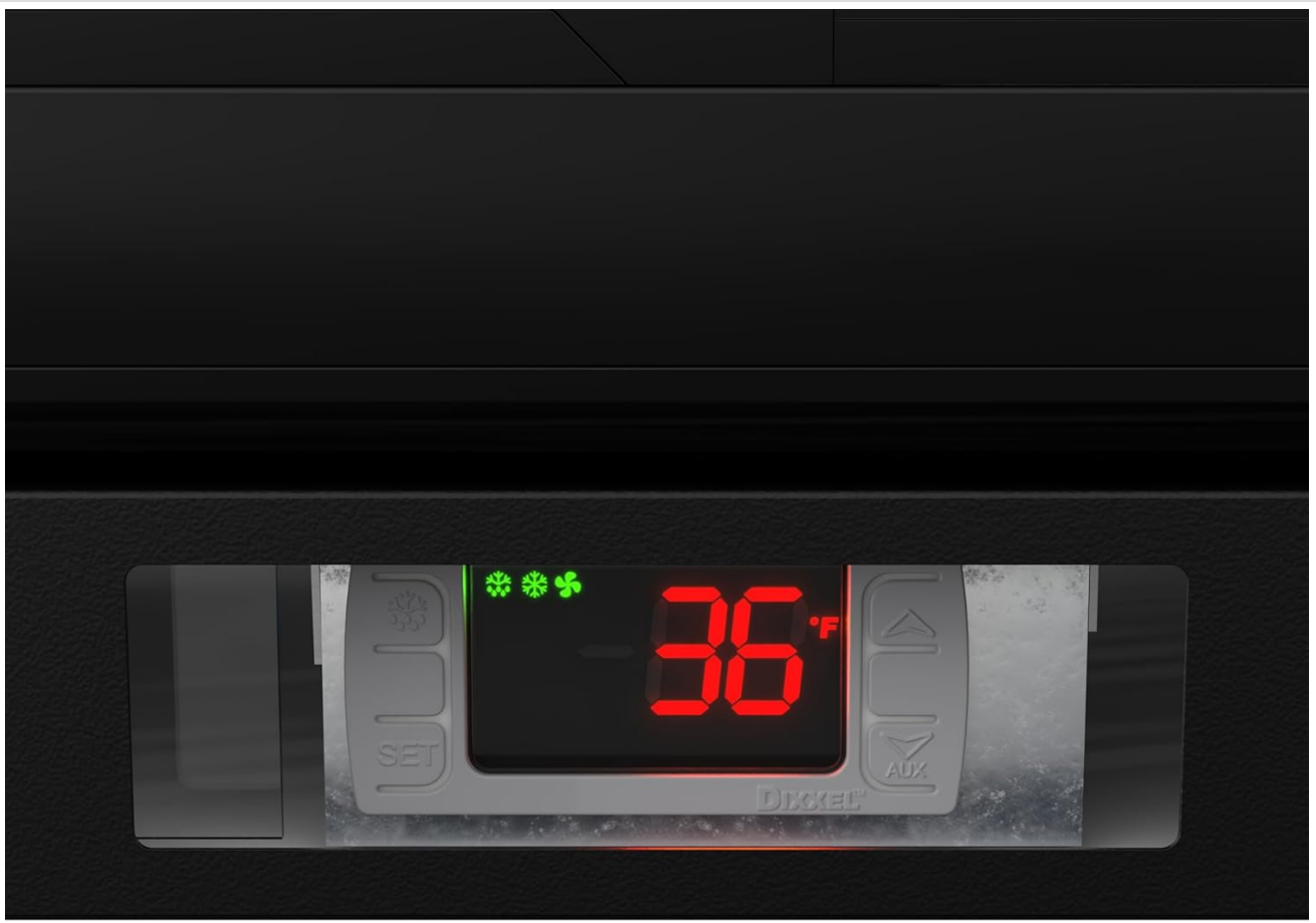
Figure 5: Digital temperature display and control panel.