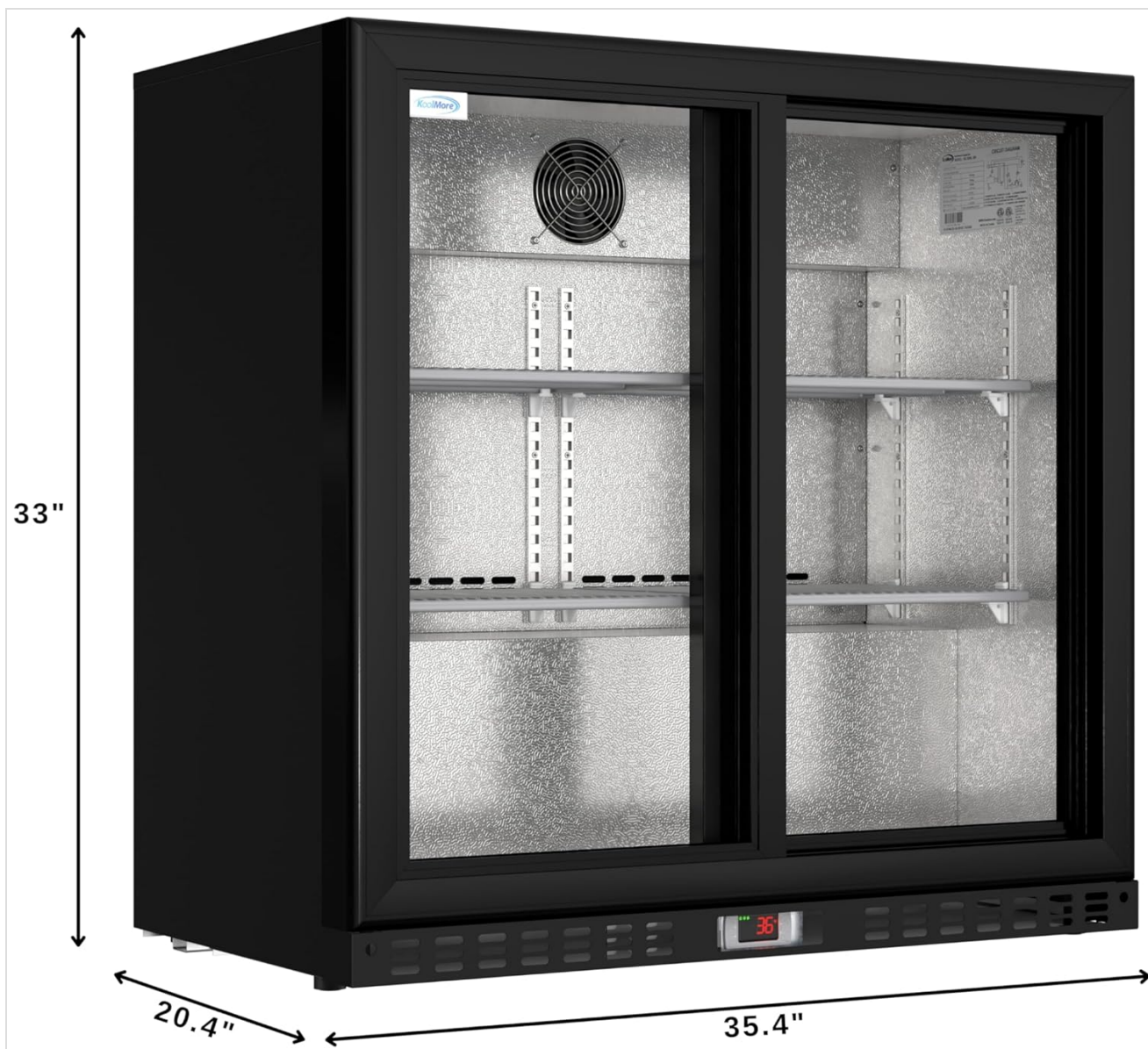
Figure 7: Double sliding glass doors.