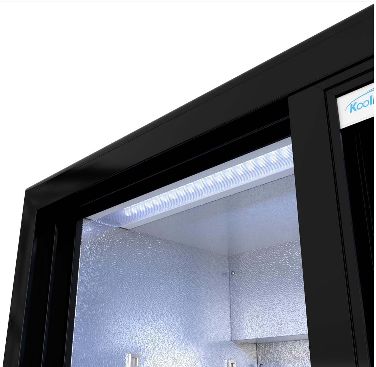
Figure 6: Interior LED lighting for product display.