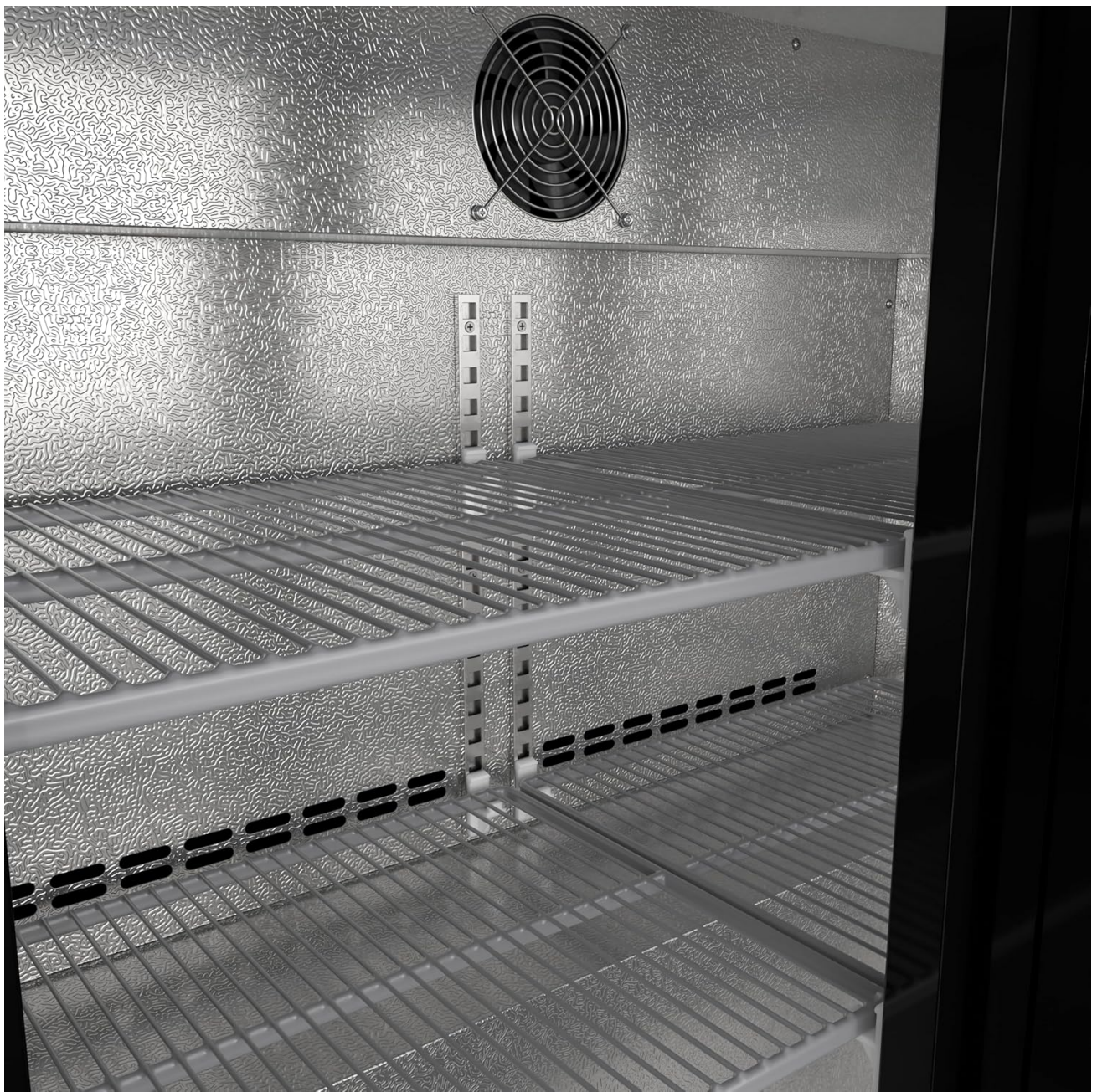
Figure 3: Interior of the refrigerator with adjustable shelves.