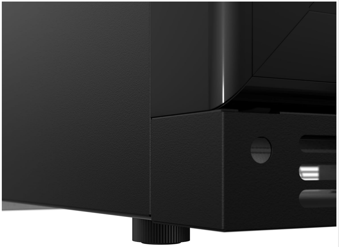
Figure 2: Adjustable leveling feet for stability.

which is crucial for proper door operation and cooling efficiency.