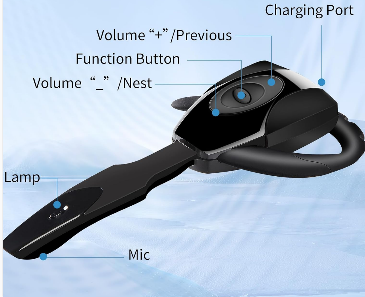
Image: Essential Information - Diagram of the ZABBOW F-SL001A headset highlighting key components such as the Charging Port, Volume "+" / Previous button, Function Button, Volume "-" / Next button, Lamp (indicator light), and Microphone.