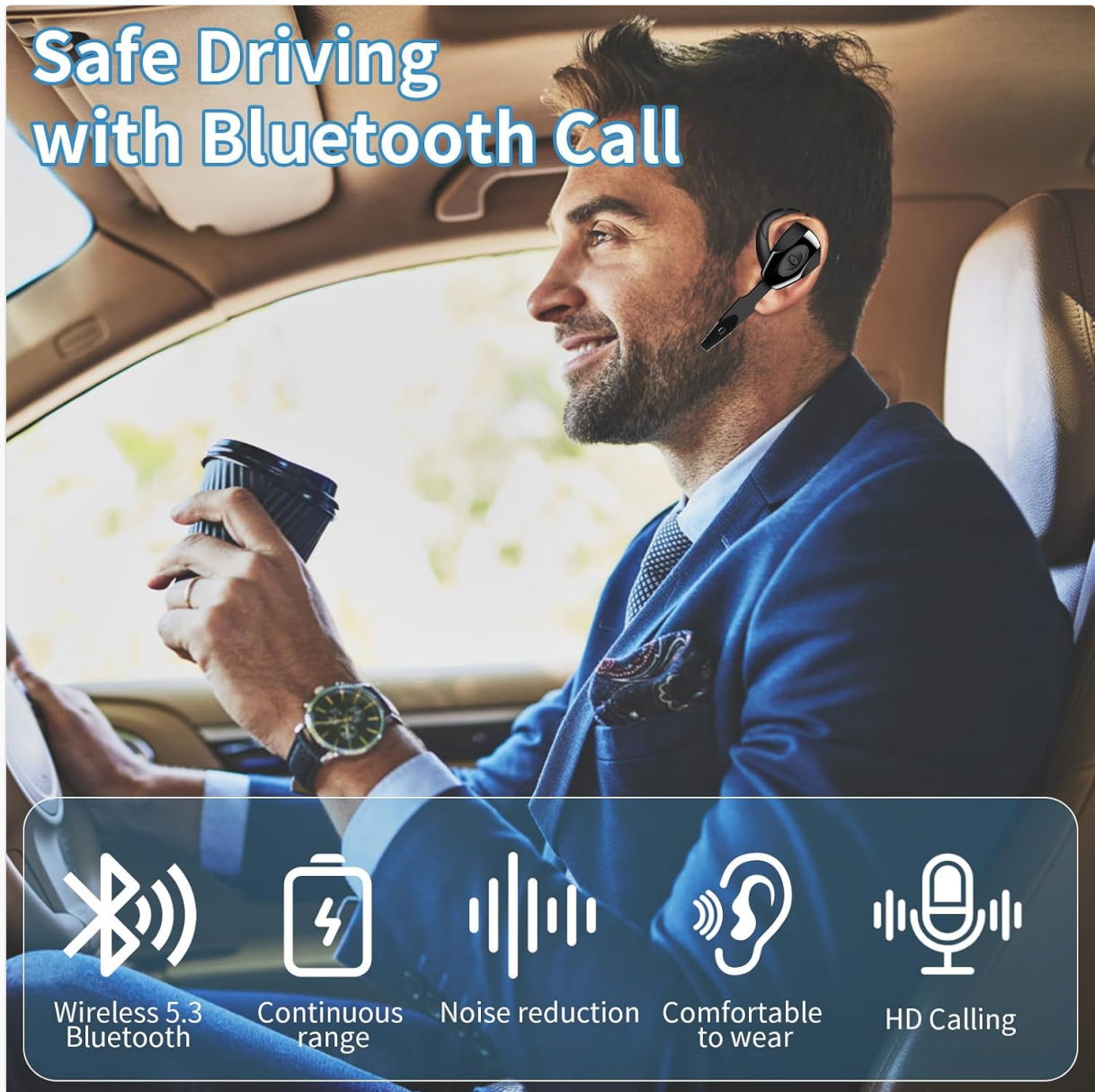
Image: Safe Driving with Bluetooth Call - The headset provides clear HD calling and noise reduction, making it suitable for use while driving.