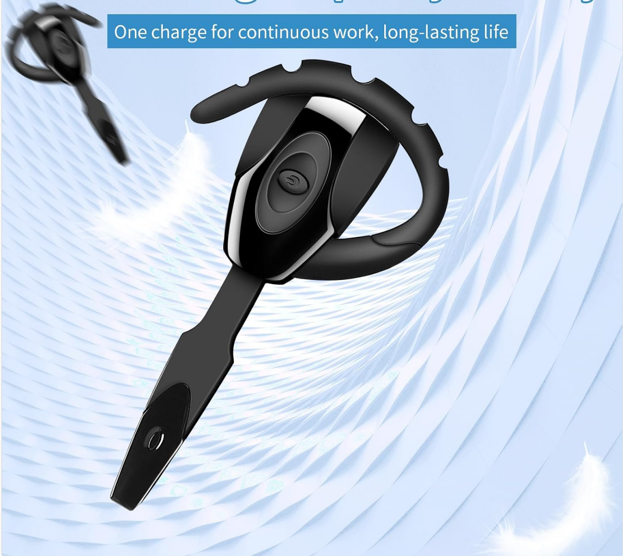
Image: 140mAh large capacity battery - The headset features a 140mAh battery, providing extended usage on a single charge.

One charge for continuous work, long-lasting life