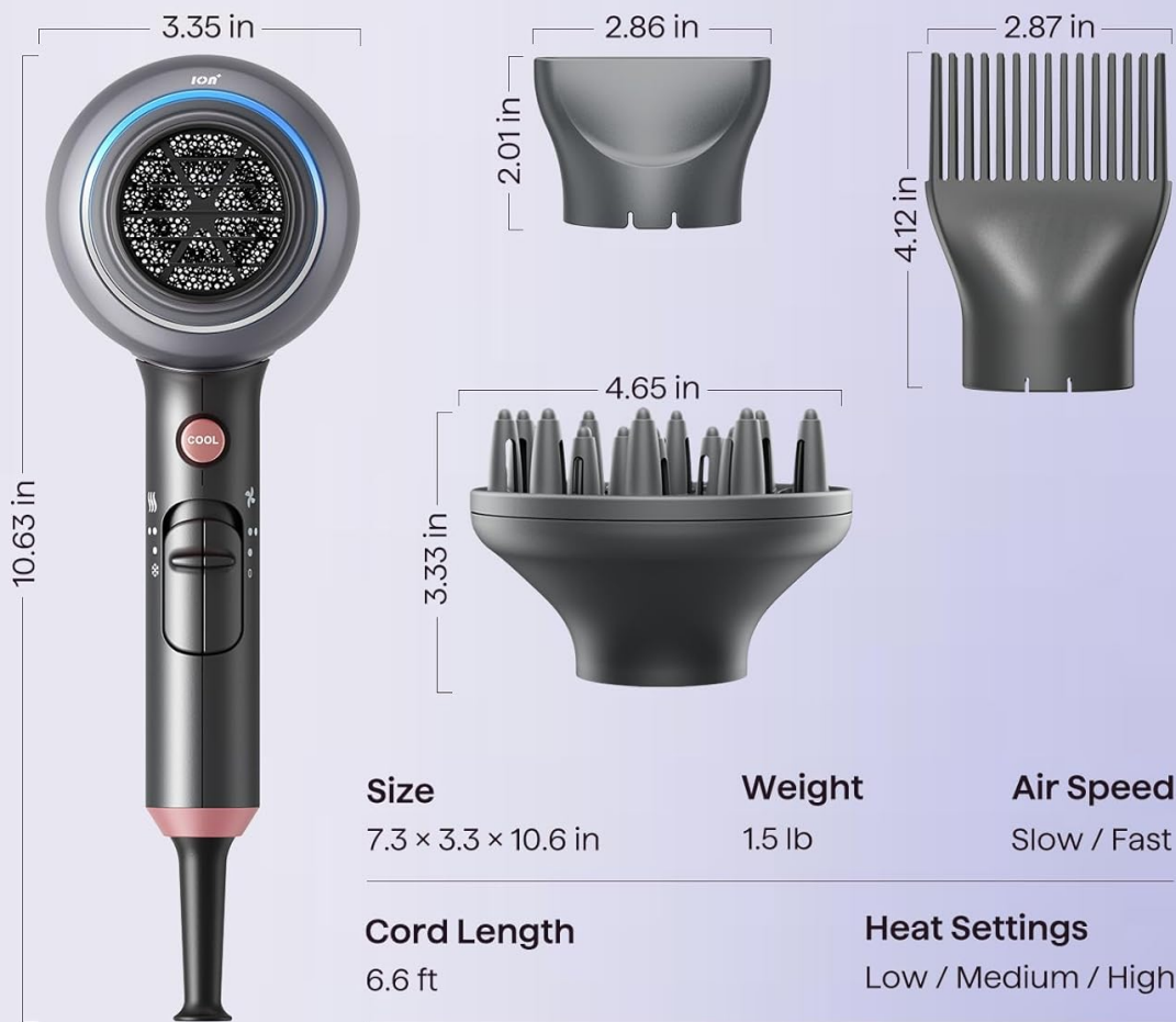
Image 7: Visual representation of the hair dryer's dimensions, weight, air speed, and heat settings.