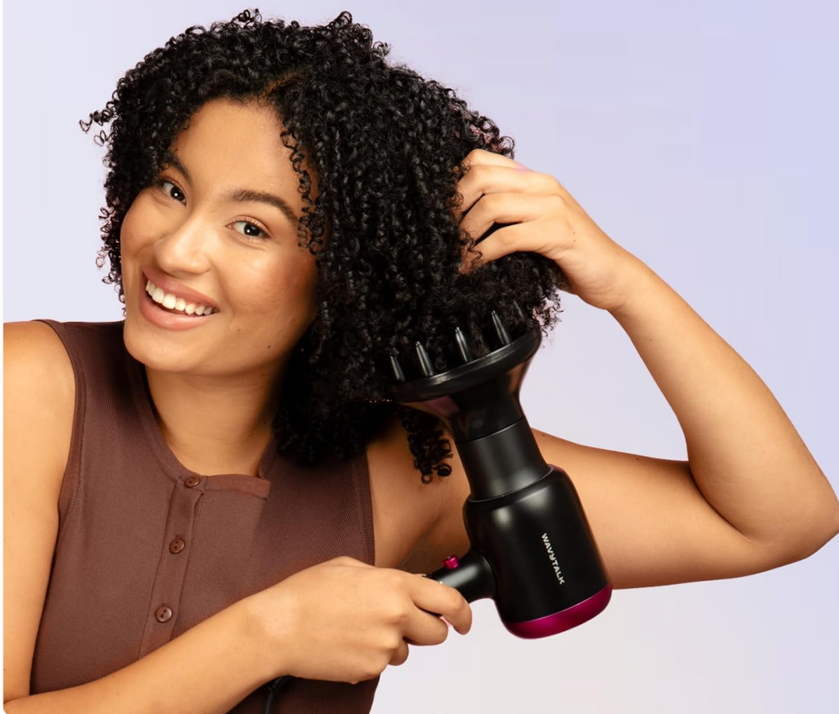
Image 2: The Wavytalk hair dryer shown with its three included attachments: concentrator, diffuser, and comb nozzle.