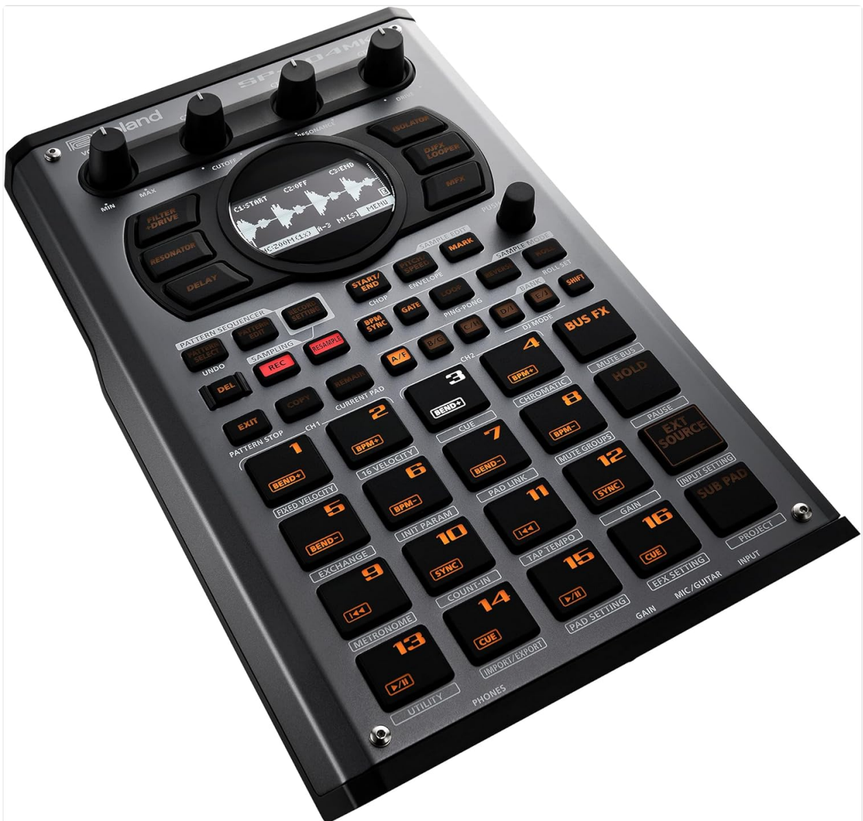
Figure 2: Roland SP-404MKII Main Unit

The SP-404MKII's intuitive layout includes a vivid OLED display, 17 velocity-sensitive pads, and various knobs and buttons for hands-on control. Familiarize yourself with the main control surface: