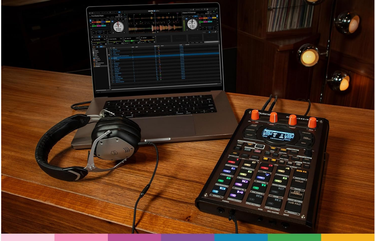
Figure 5: Seamless Software Integration

Edit with precision on the vivid OLED screen— chop, auto-slice, tweak, and convert patterns instantly, then capture magic moments with Skip Back Sampling.