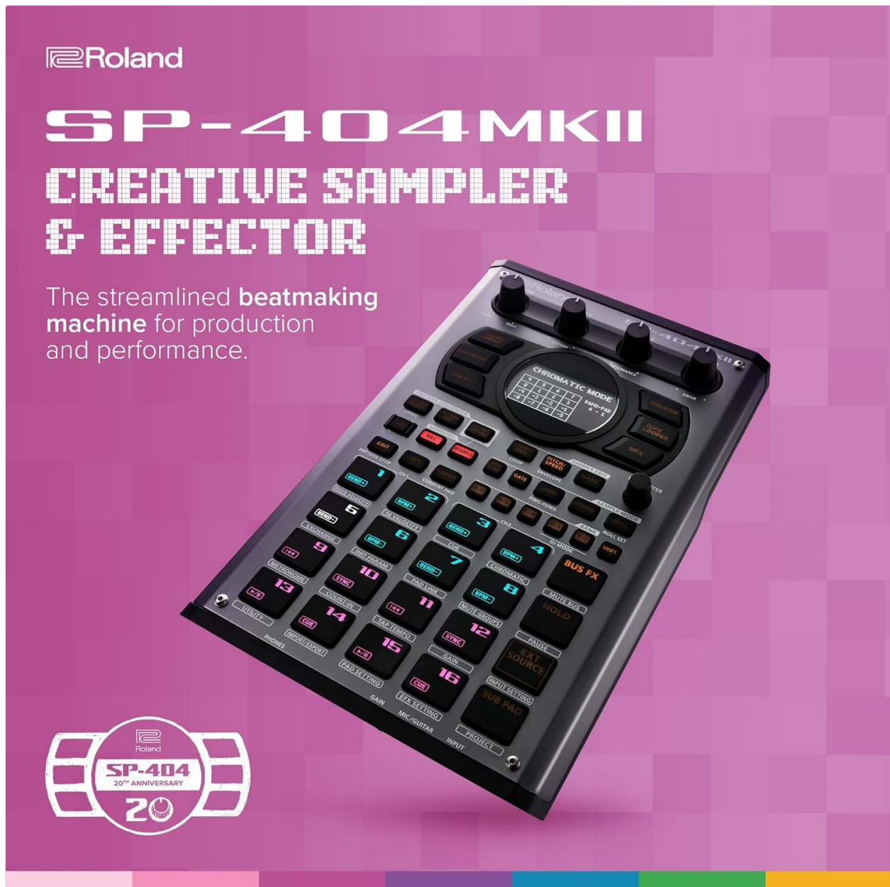
Figure 3: Streamlined Beatmaking with SP-404MKII

The unit supports up to 160 samples per project and features 32-voice polyphony, allowing for complex arrangements.