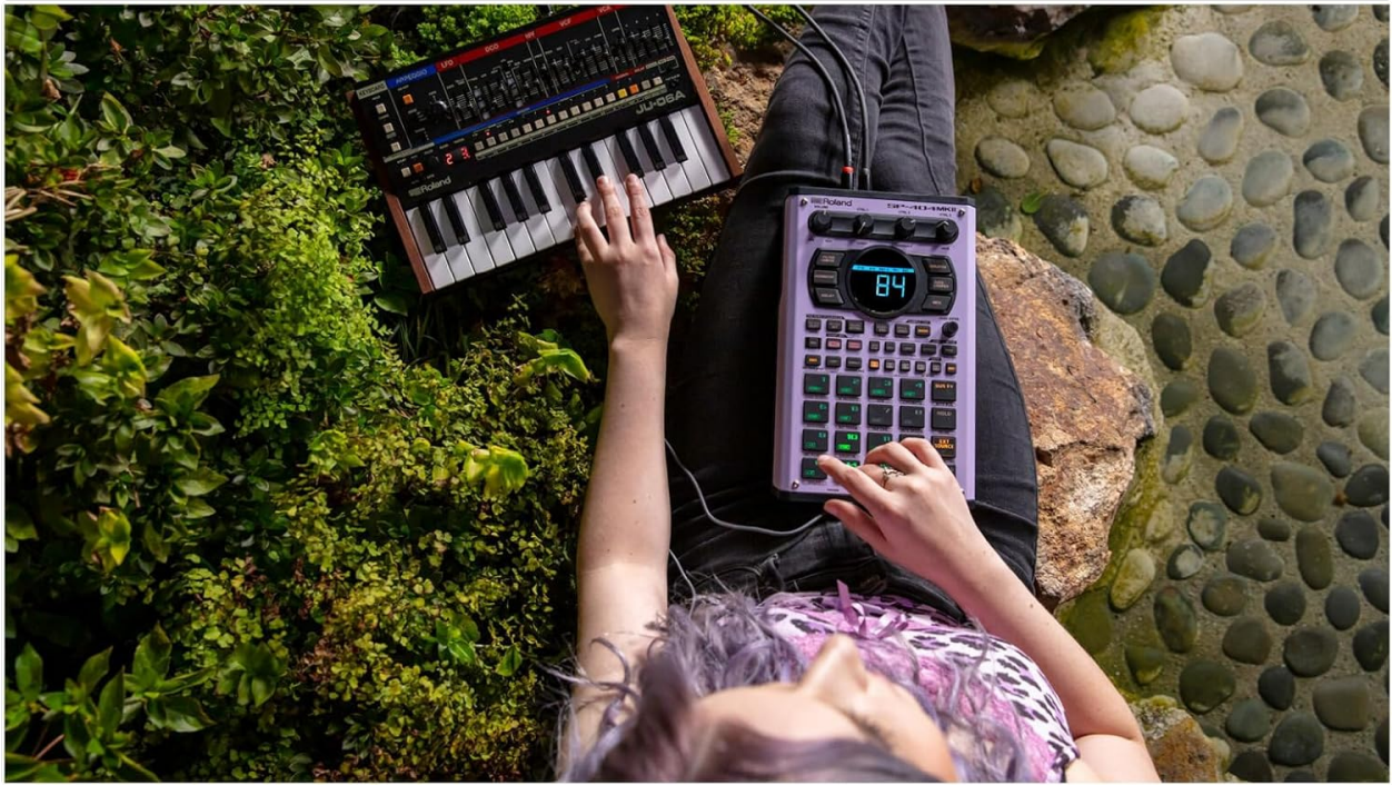
Figure 4: Creative Freedom Anywhere