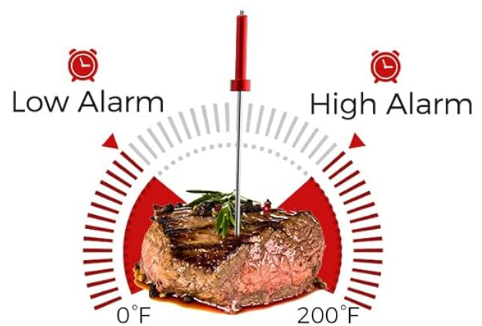
Image: Temperature alarm and timer functionality.