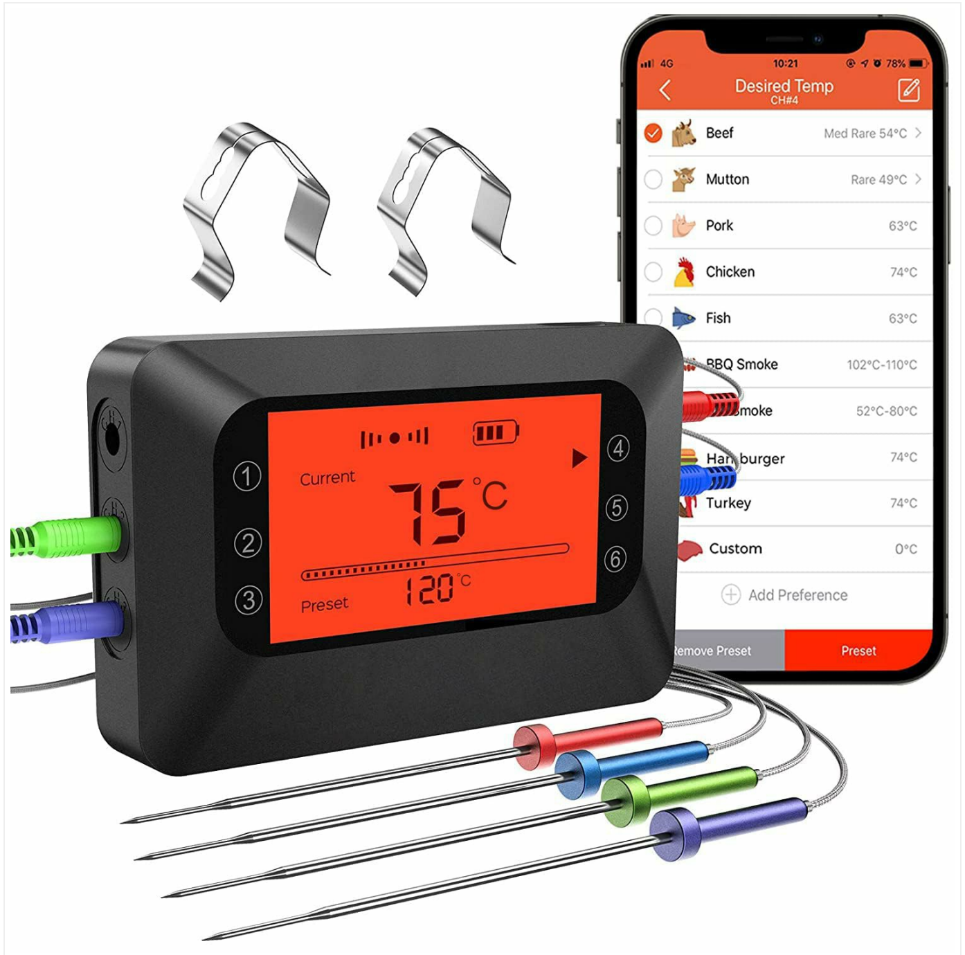
Image: The thermometer unit and its companion app on a smartphone.