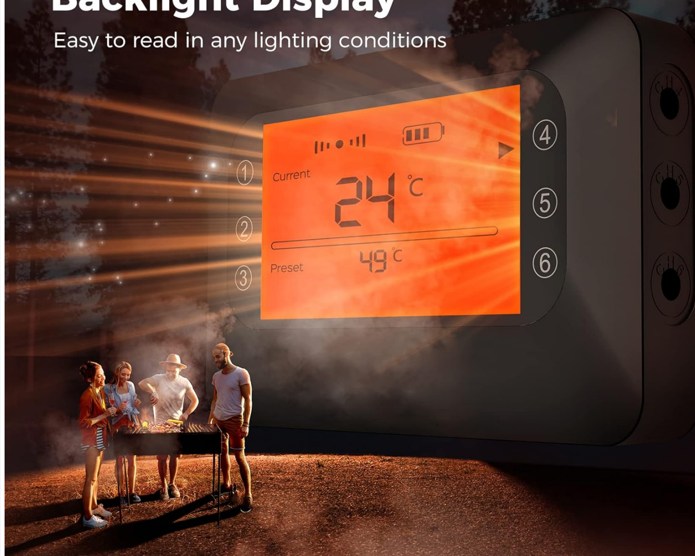
Image: The large backlit display for easy reading.