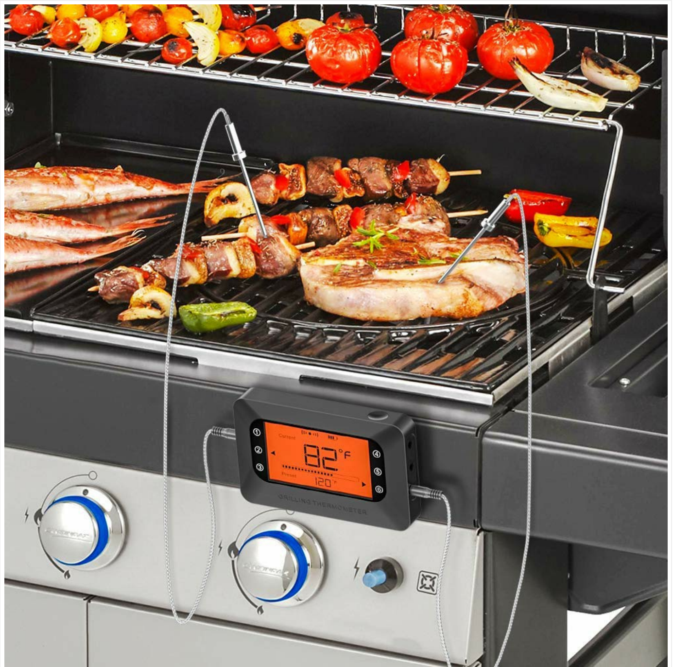
Image: Contents of the BFOUR Wireless Meat Thermometer package.