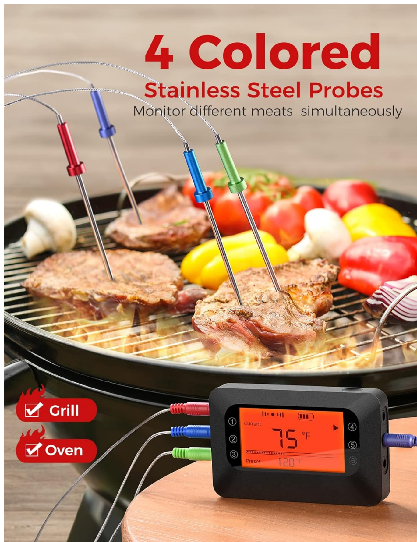
Image: Four colored probes for monitoring multiple foods simultaneously.