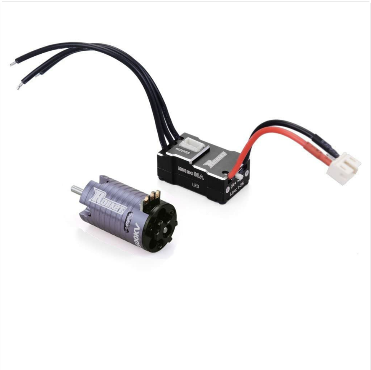
Image 1: The SURPASS HOBBY Rocket Mini 1410 7500KV Brushless Motor and Mini 18A Brushless ESC Combo.