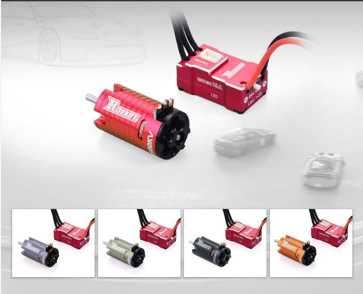
Image 2: Overview of the brushless power system, highlighting its suitability for mini RC cars.