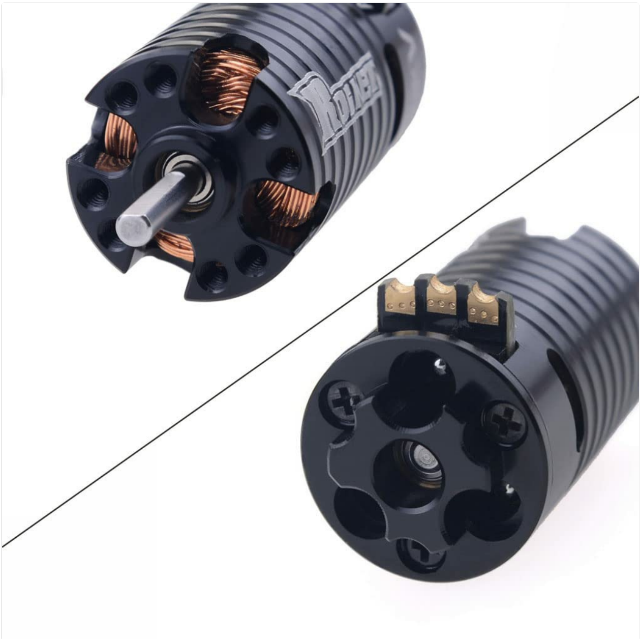
Image 3: Close-up view of the motor's internal windings and external connection points.