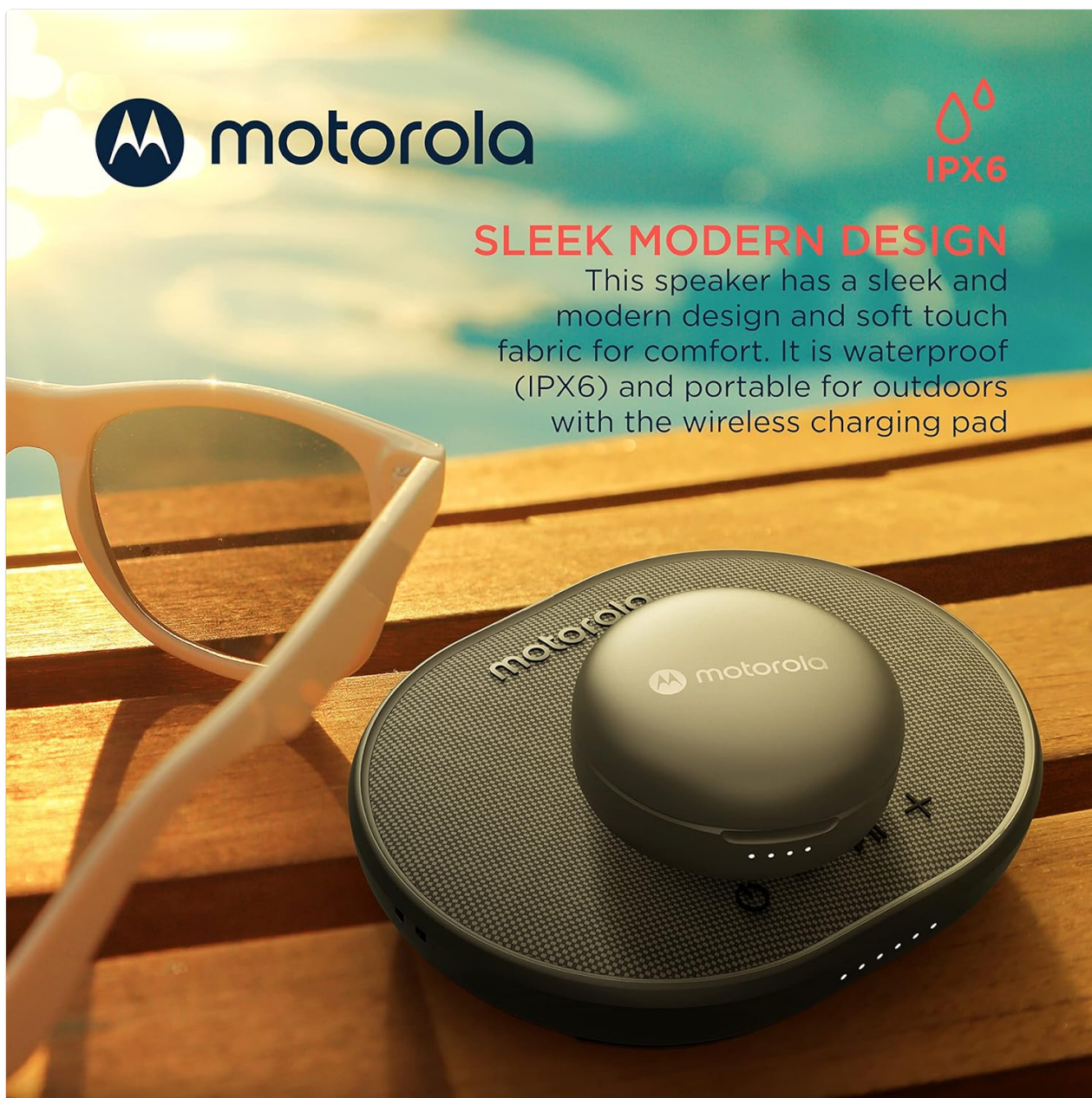
Image 5.2: The Motorola ROKR 500 speaker shown wirelessly charging a pair of earbuds, demonstrating its Qi-compatible charging functionality.

Note: The speaker's internal battery capacity may affect its ability to charge external devices while simultaneously playing audio at high volumes.