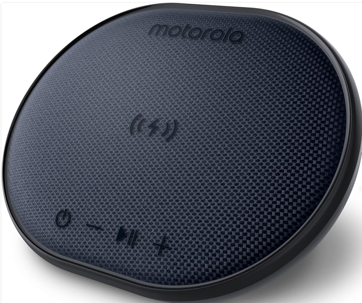
Image 1.1: Motorola ROKR 500 Portable Bluetooth Speaker. This image shows the top view of the black, oval-shaped speaker with control buttons and a wireless charging symbol.