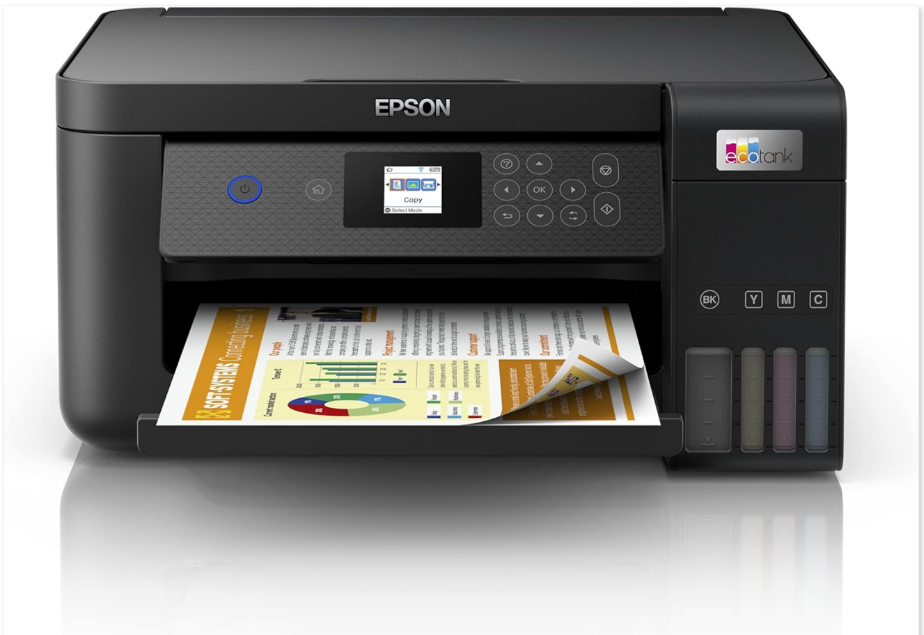
Image: Front view of the Epson EcoTank L4260 printer with paper in the input tray.

Carefully remove the printer from its packaging. Ensure all protective tapes and materials are removed from the exterior and interior of the printer. Verify that all included accessories, such as the power cord and ink bottles, are present.