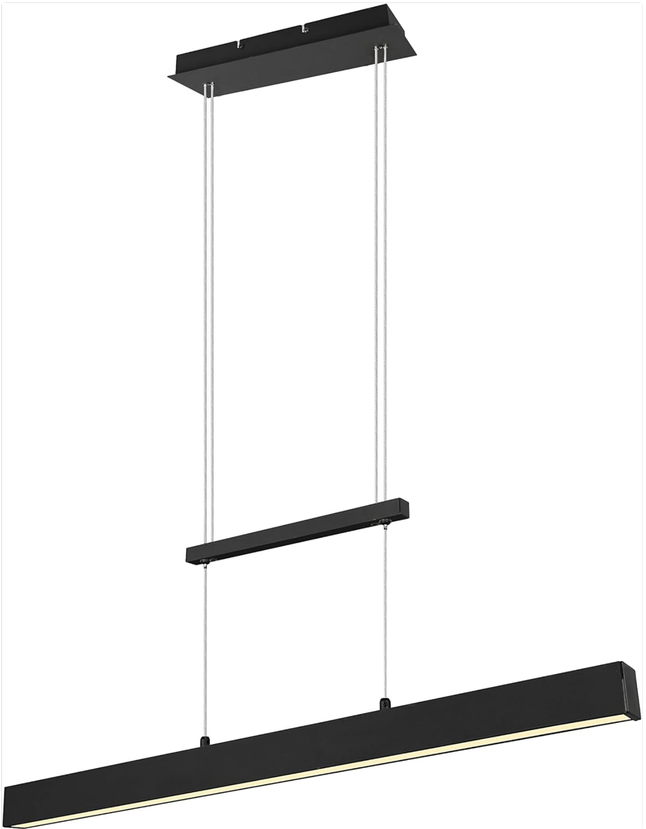
Image 1.1: The Reality Leuchten Paros R32043132 LED Suspension Lamp, showcasing its modern, matte black design.