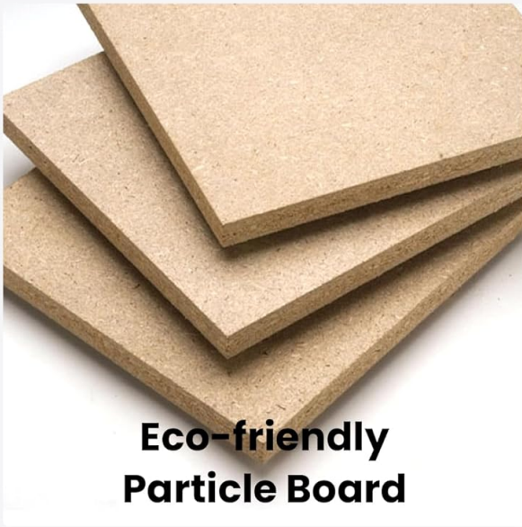
Eco-friendly Particle Board