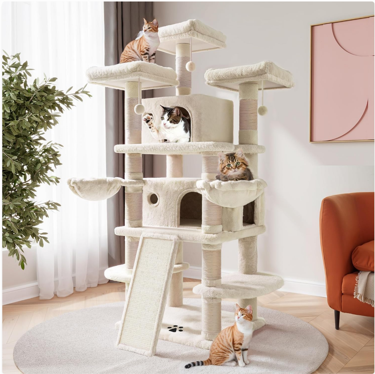
Figure 1: Overview of the SHA CERLIN 68-Inch Multi-Level Cat Tree.