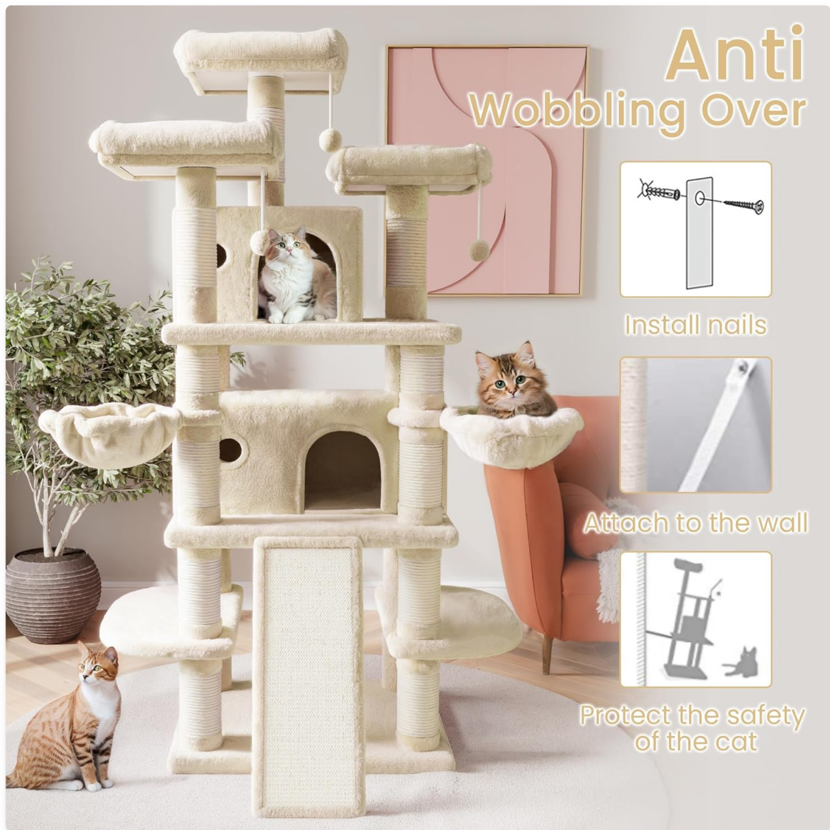
Figure 4: Instructions for attaching the anti-wobbling wall anchor to ensure stability.