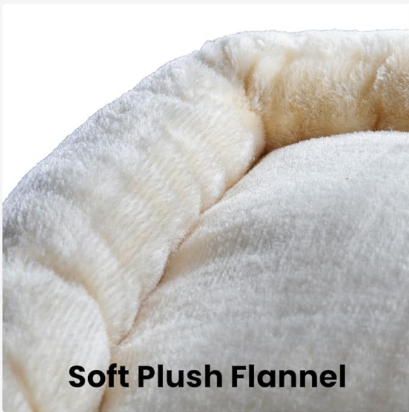
Soft Plush Flannel