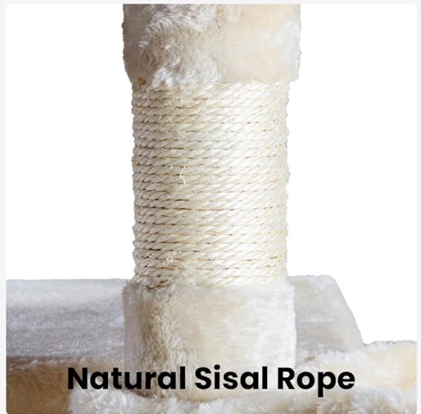
Natural Sisal Rope