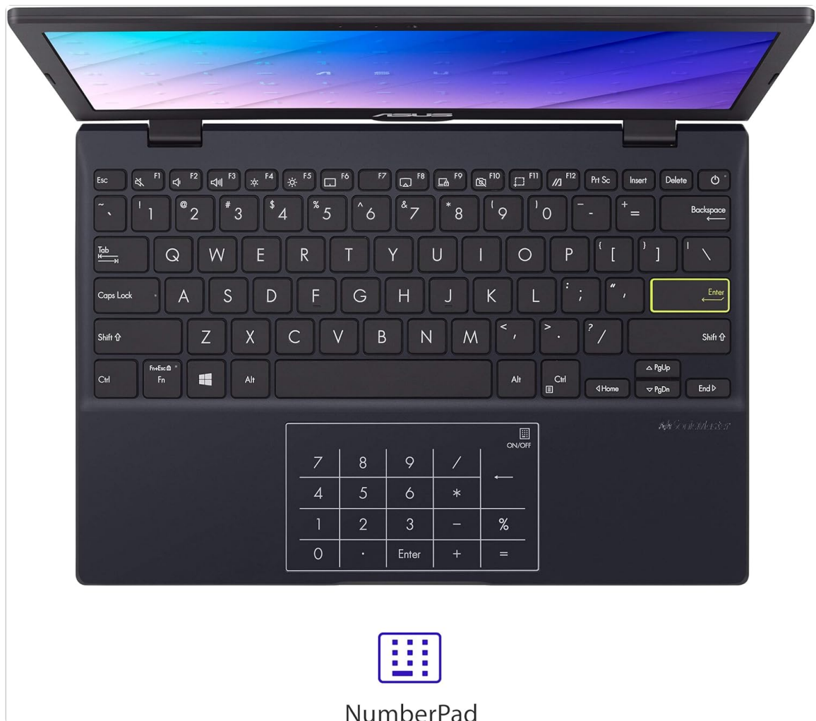
Figure 2: The touchpad with integrated NumberPad for quick numerical input.