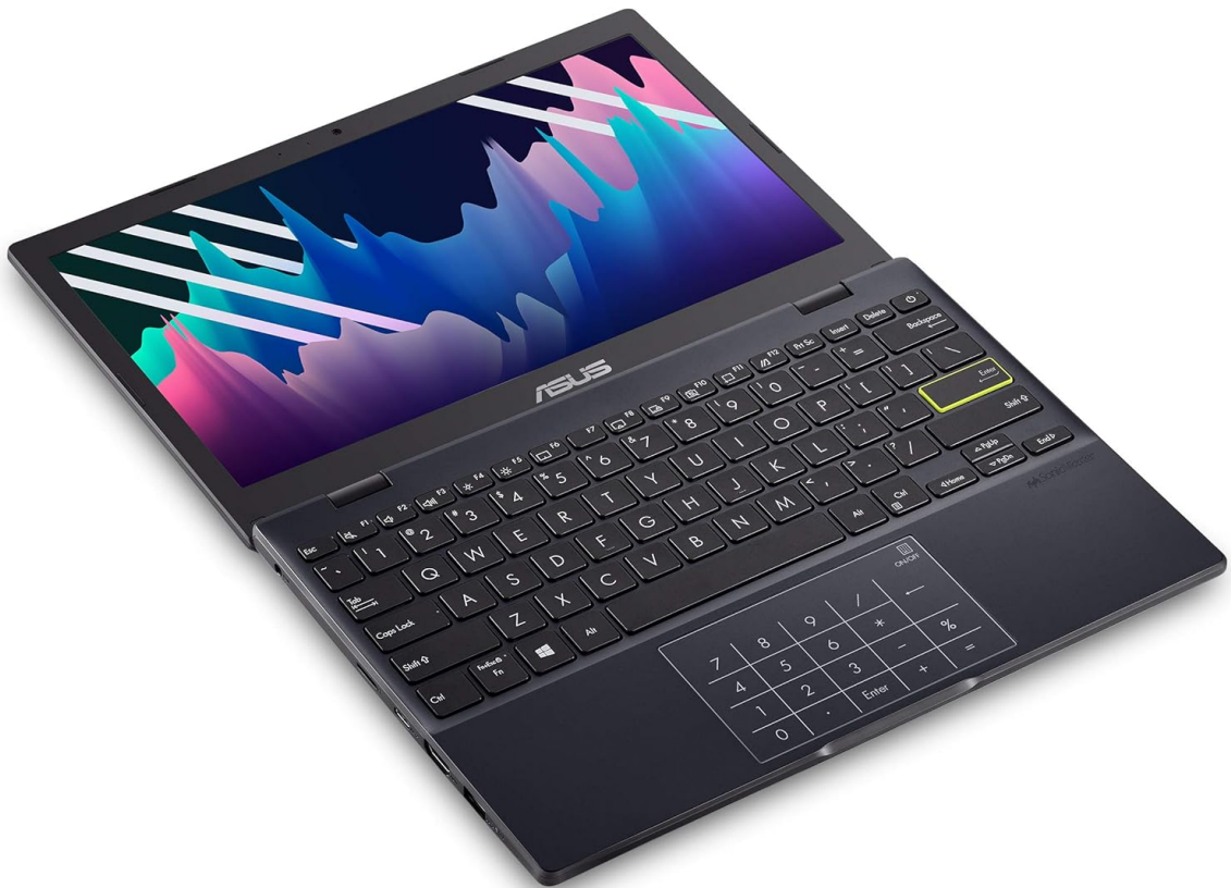
Figure 3: The laptop's 180-degree lay-flat hinge allows for versatile viewing and sharing.