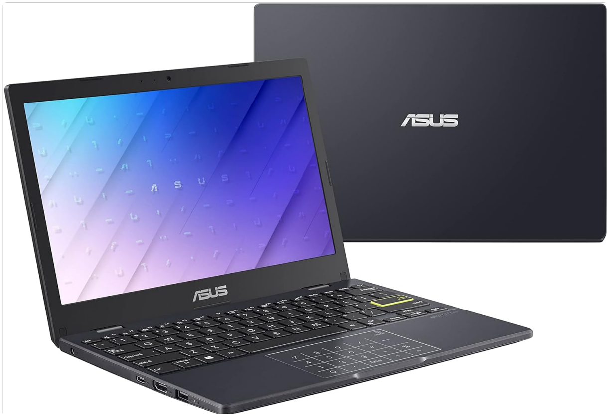
Figure 1: ASUS Notebook E210, showcasing its compact design with the screen displaying a colorful desktop background.