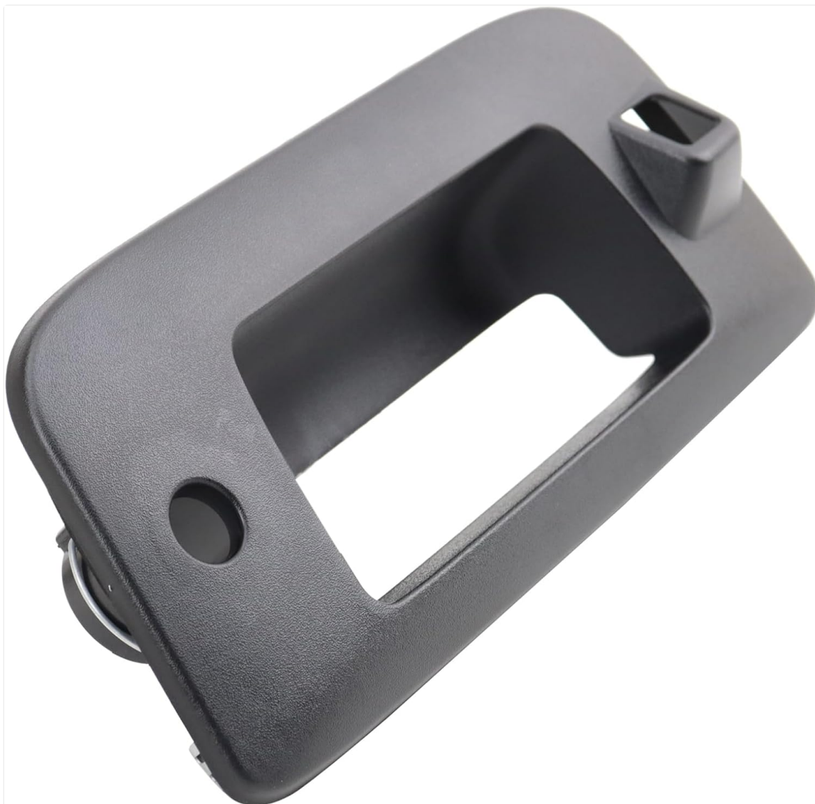
Image: Angled view of the TRQ Tailgate Handle Bezel, highlighting the lock cylinder opening.

released, push the lock cylinder out from the front of the old bezel. Insert the lock cylinder into the new bezel and secure it with the retaining clip.