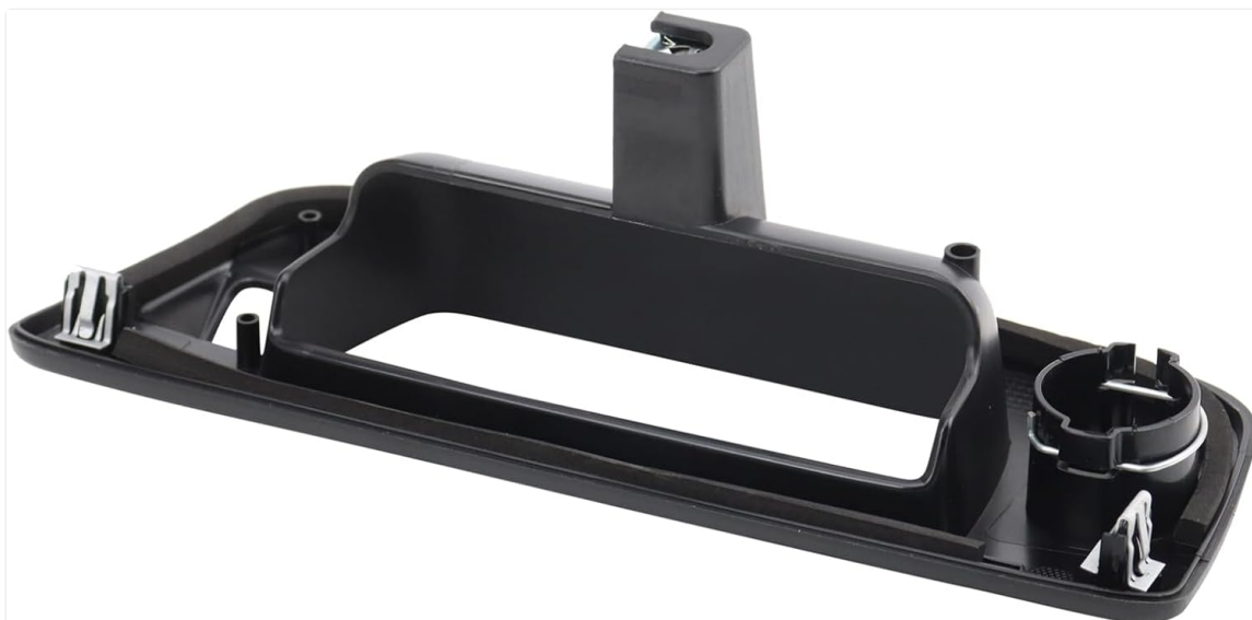
Image: Close-up of the camera hole and lock provision on the TRQ Tailgate Handle Bezel.

Align the camera module with the mounting points on the new TRQ bezel. Secure it using the original T15 Torx screws. Do not overtighten, as the bezel is made of plastic.