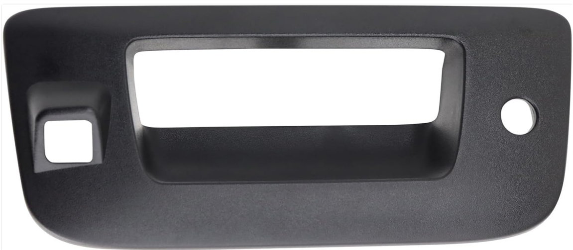
Image: Back view of the TRQ Tailgate Handle Bezel, showing mounting points and internal structure.

Once the bezel is removed, locate the camera module attached to the back. Use a T15 Torx socket or screwdriver to remove the three screws securing the camera to the old bezel. Carefully separate the camera from the bezel.