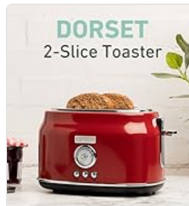
Figure 6.1: Toaster with removable crumb tray for easy cleaning.