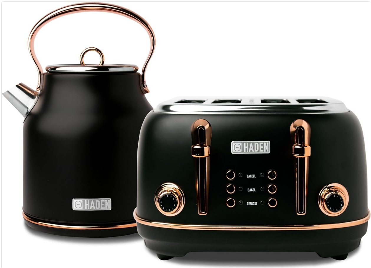
Figure 3.1: Haden Heritage Black & Copper Toaster and Kettle Set.