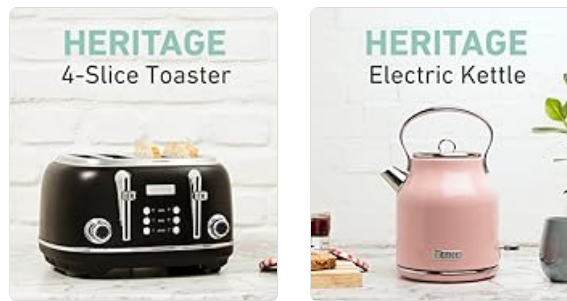
Figure 5.2: Kettle water gauge and automatic shut-off feature.