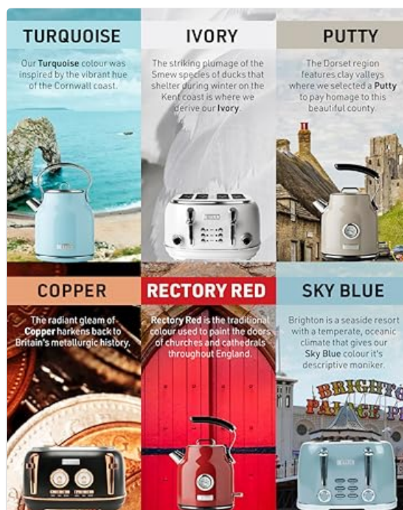
Figure 3.2: Overview of Haden Heritage Electric Kettle and 4-Slice Toaster with key features highlighted.