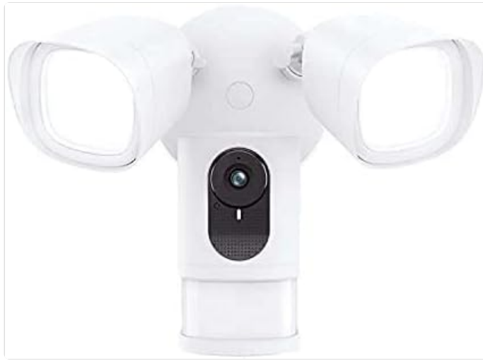
Figure 3.1: Front view of the eufy Security Floodlight Cam 2.

To complete the setup process, download the eufy Security app on your smartphone. Follow the in-app instructions to connect your Floodlight Cam 2 to your Wi-Fi network. Note that the device only supports 2.4GHz Wi-Fi.