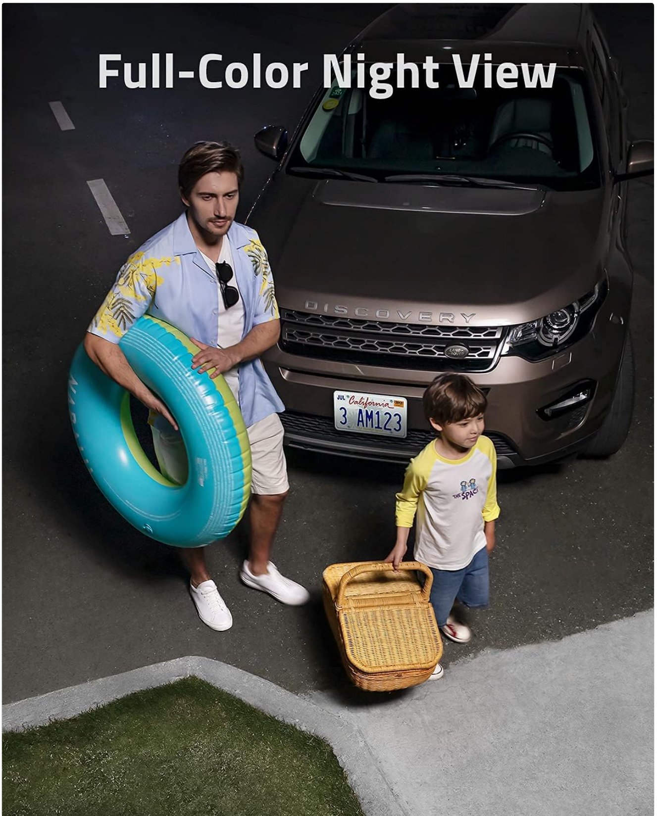
Figure 4.3: An example of the full-color night view, providing clear and vibrant images even in low-light conditions.