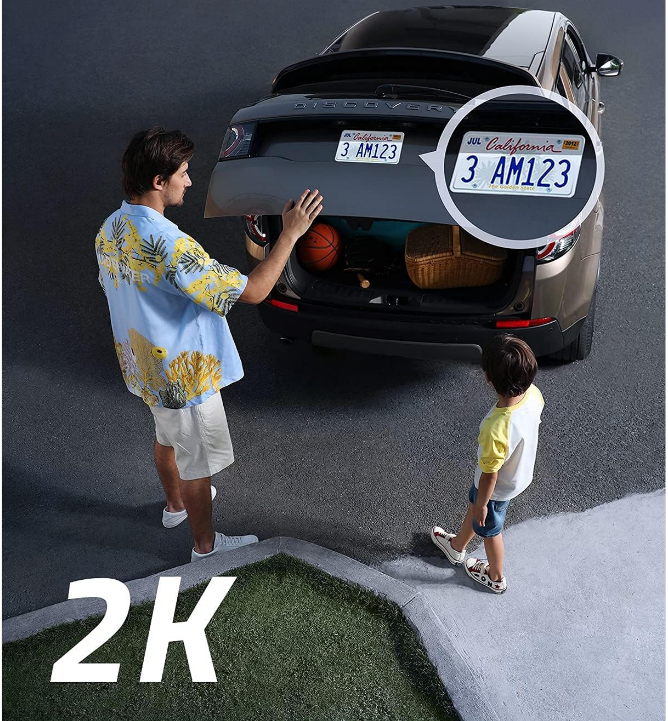
Figure 4.1: Demonstrates the 2K resolution, capable of capturing fine details such as license plate numbers.