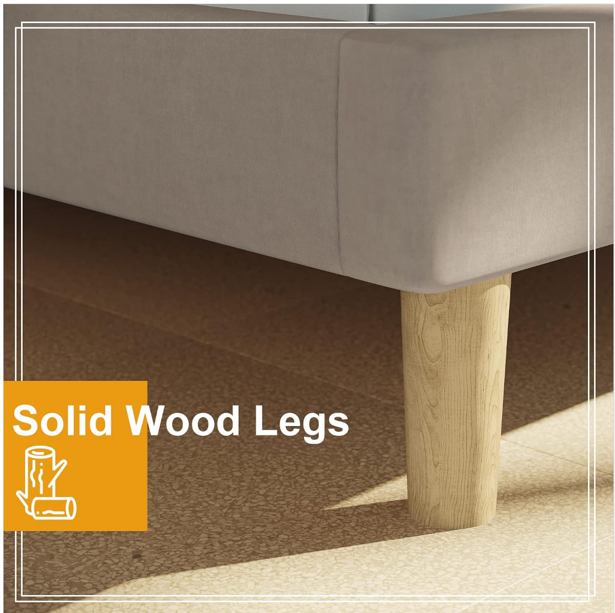
Image: Detail of the solid wood legs, indicating where they attach to the frame.