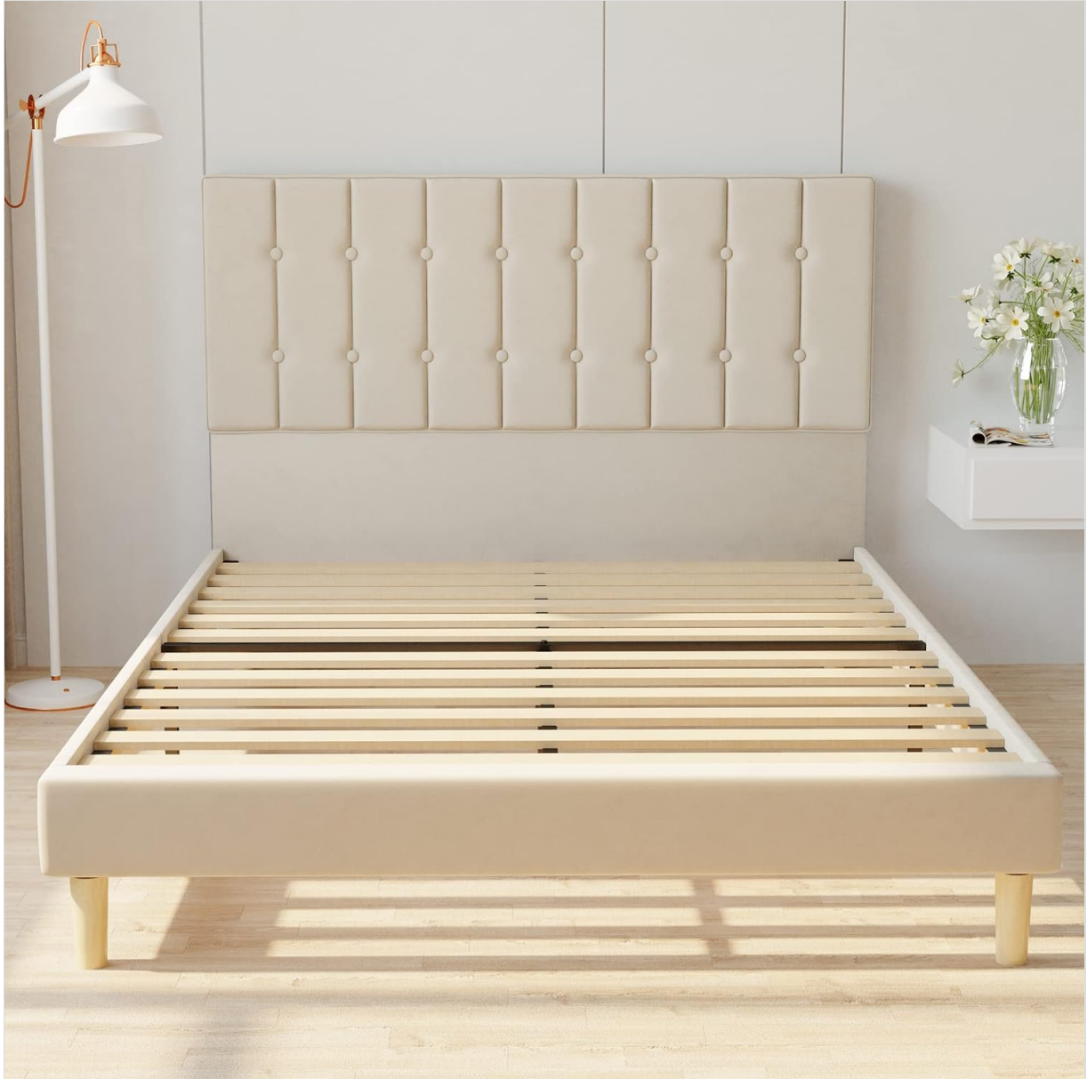
Image: Overview of the LIKIMIO Full Bed Frame components before assembly.

Carefully unpack all components from the packaging. Lay them out on a clean, soft surface to prevent scratches. Identify each part using the provided parts list and ensure all pieces are present.