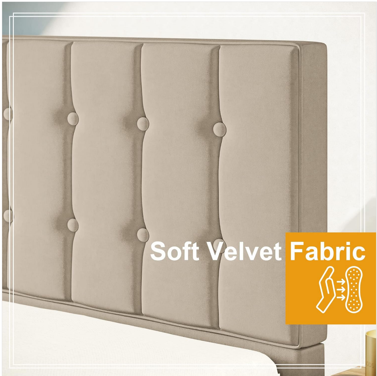
Image: Detailed view of the upholstered headboard.