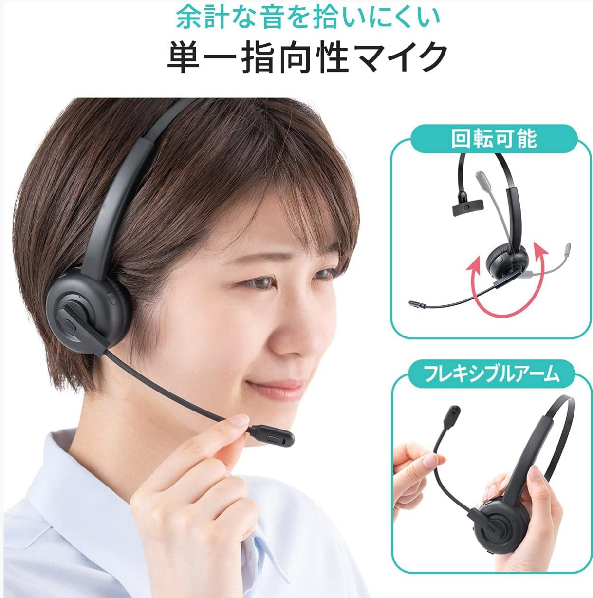
Figure 9: Adjusting the unidirectional microphone.

The microphone arm is flexible and can be rotated to position the microphone optimally for your voice. Ensure the microphone is close to your mouth for clear audio pickup, especially since it is unidirectional.