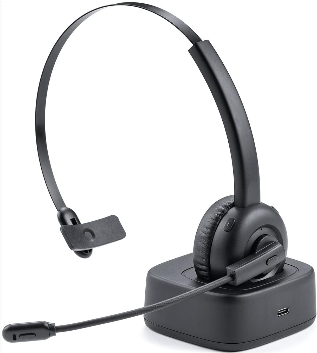
Figure 1: Sanwa Direct Bluetooth Headset and Charging Stand