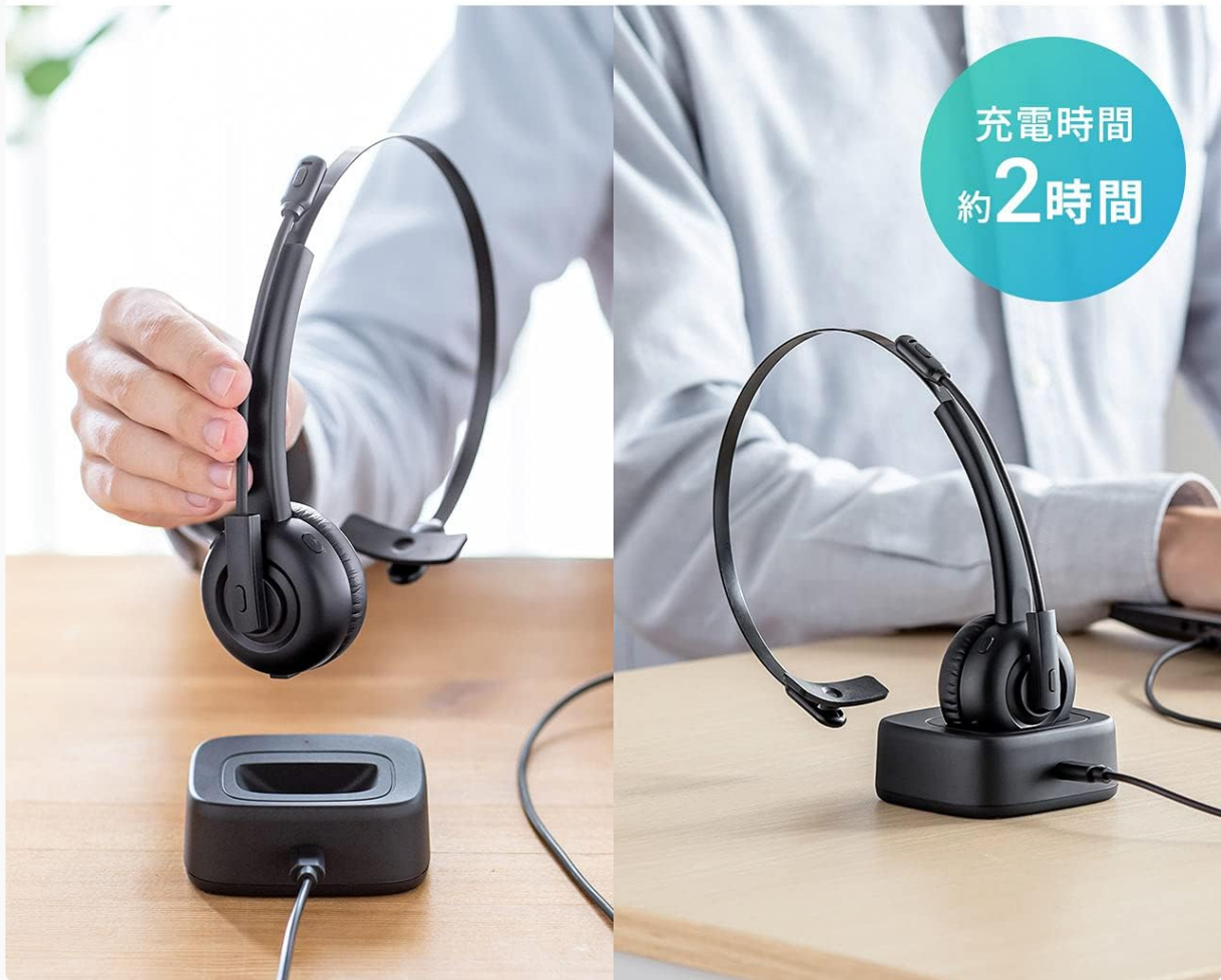
Figure 4: Charging the headset using the cradle.