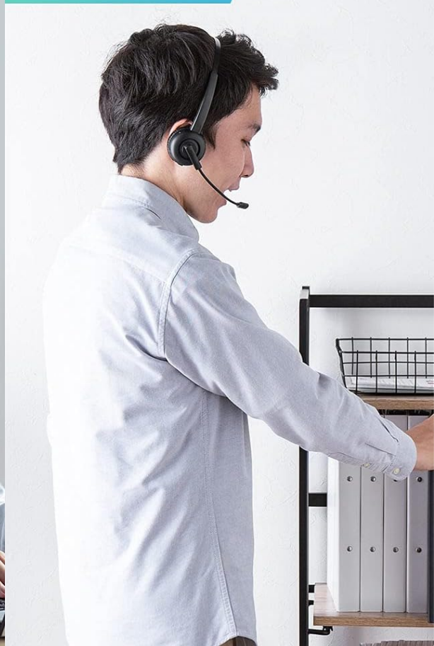
Figure 2: Headset in use, demonstrating wireless freedom.