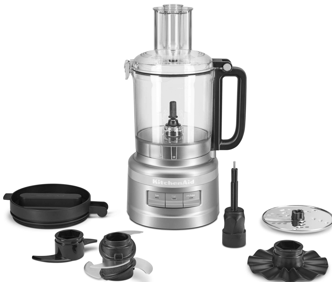
Image: The KitchenAid 9 Cup Food Processor in Contour Silver, showcasing its compact design and control panel.