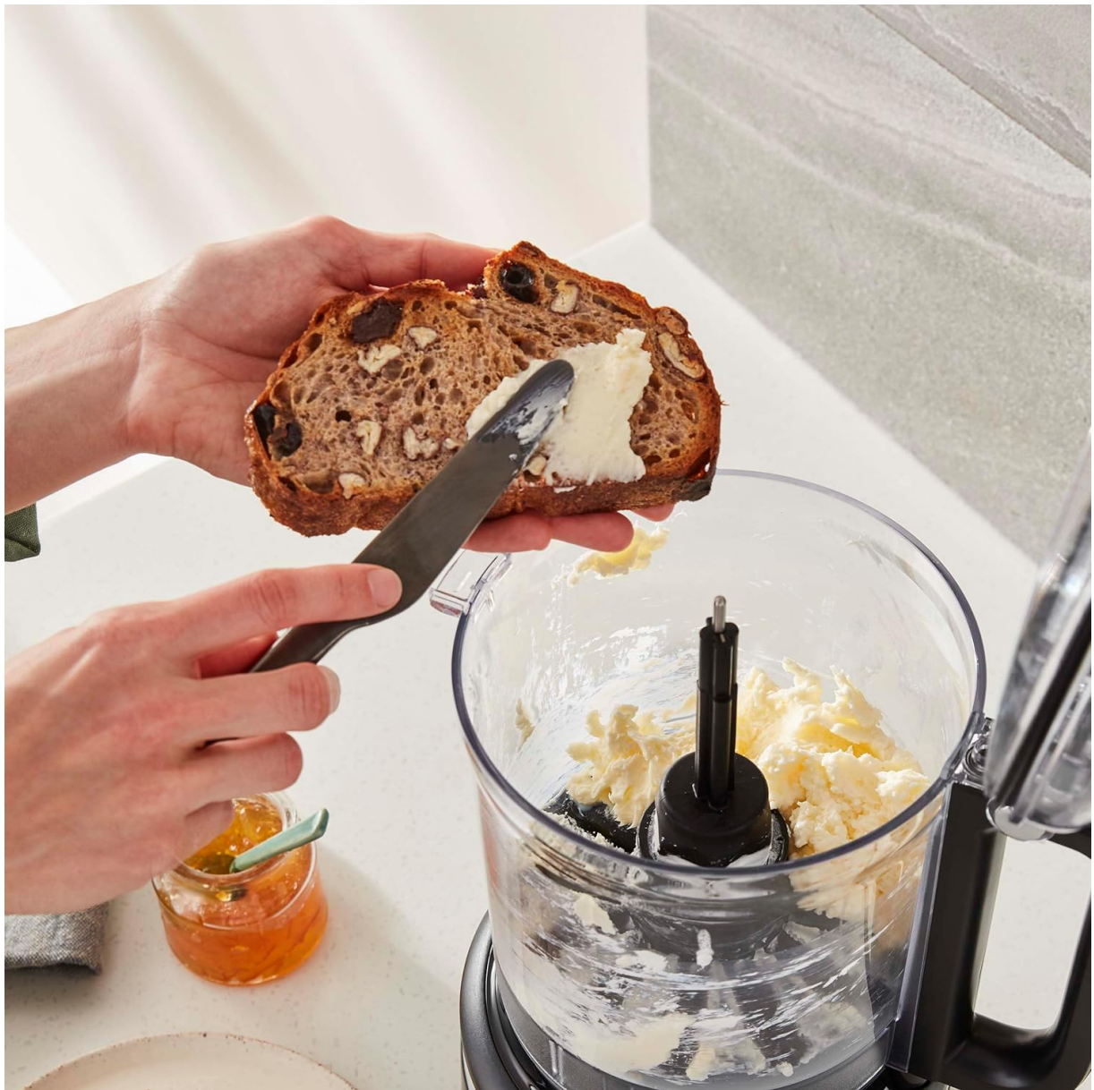
Image: Hands spreading freshly made butter, prepared using the KitchenAid Food Processor, onto a slice of bread, demonstrating a versatile application.