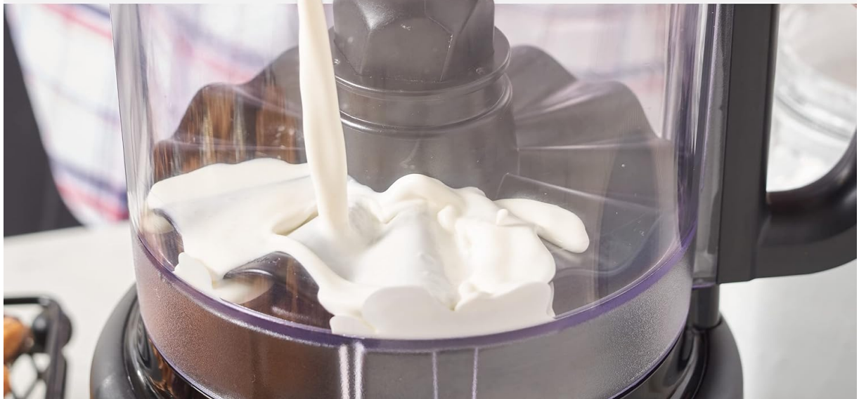
Image: The KitchenAid 9 Cup Food Processor with the whisk accessory, shown whipping cream, illustrating its capability for light mixing tasks.