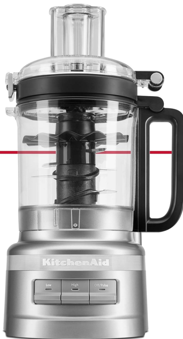
Image: The KitchenAid 9 Cup Food Processor demonstrating its All-in-One storage solution, with all blades and discs neatly stored within the work bowl.

Save space with the All-in-One storage design