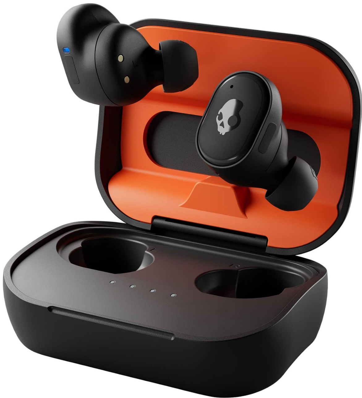
Image: Skullcandy Grind Fuel Earbuds in their open charging case, showcasing the black earbuds with orange interior accents.

Video: An official product video showcasing the features and design of the Skullcandy Grind Fuel True Wireless Earbuds.