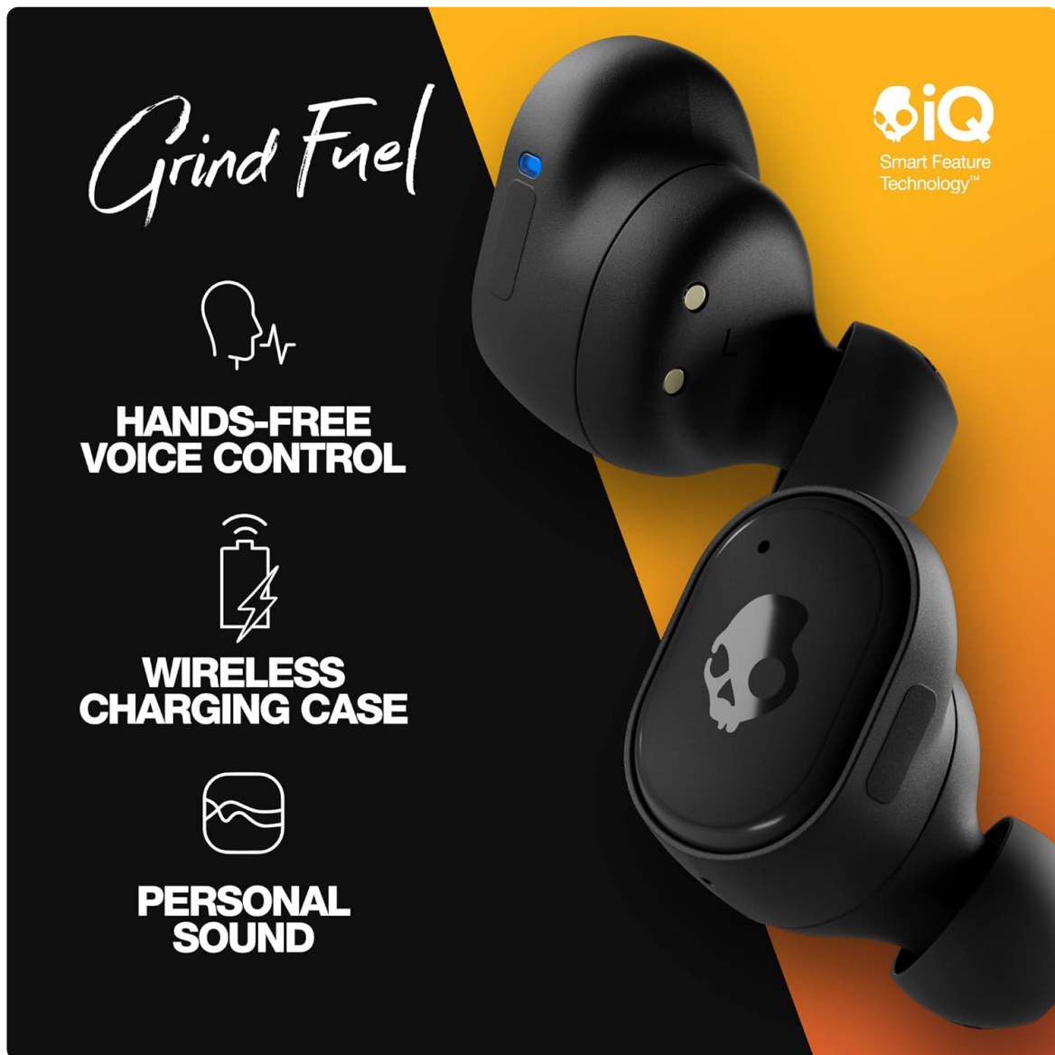
Image: Front view of the Skullcandy Grind Fuel Earbuds, highlighting their compact design.

Open your device's Bluetooth settings, find "Grind Fuel" in the list of available devices, and select it. Accept any pairing prompts. A voice prompt will confirm successful pairing.