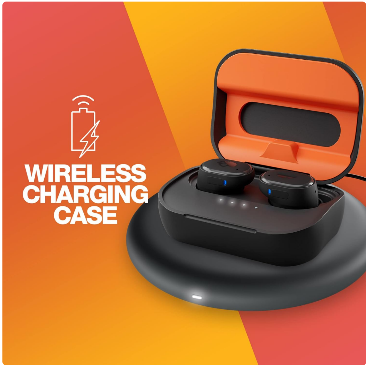
Image: The Skullcandy Grind Fuel charging case being wirelessly charged on a charging pad.