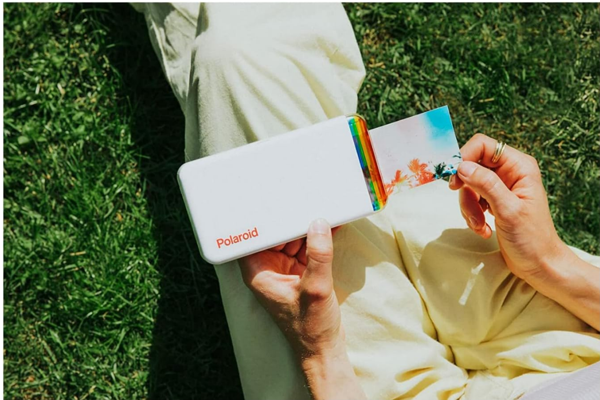
Image 4: A hand holding the Polaroid Hi-Print printer, with a freshly printed photo being held next to it, demonstrating its portability and the size of the prints.

Each 2x3 inch print features a self-adhesive backing. Simply peel off the backing to stick your photos onto journals, scrapbooks, laptops, or any other surface.