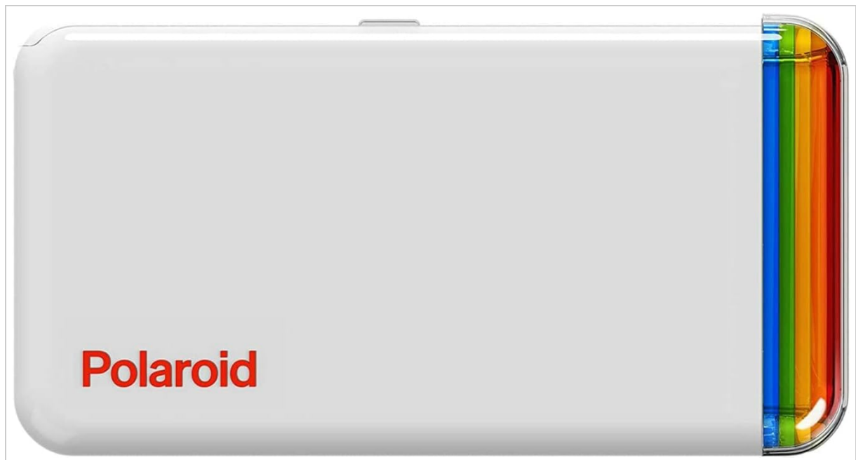
Image 2: Top view of the Polaroid Hi-Print printer, showing the paper cartridge slot.