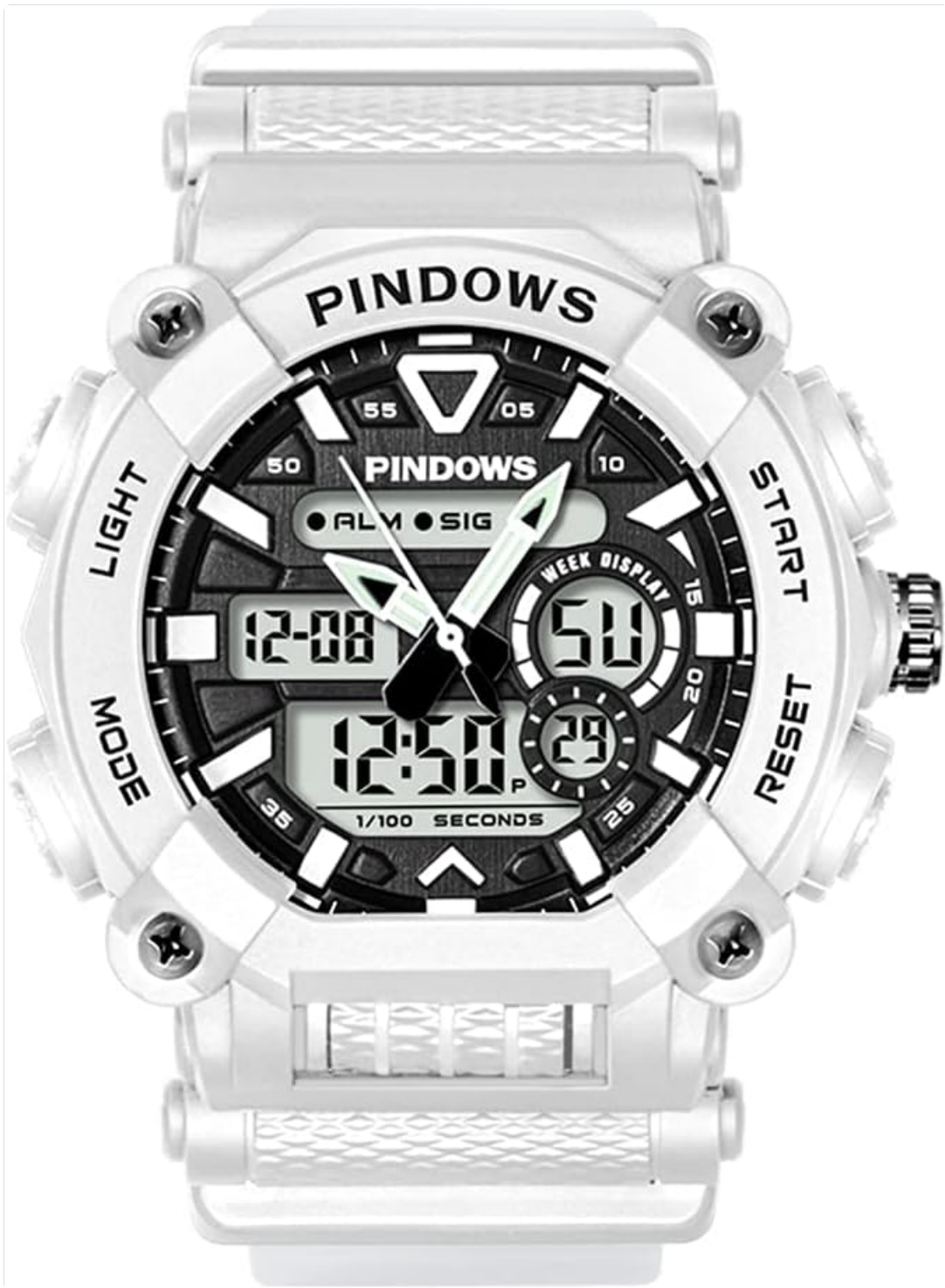
Image 1.1: Front view of the PINDOWS PDS-621 Digital Sport Watch. The watch features a white case and strap with a black and white digital and analog display, indicating time, date, and other functions.