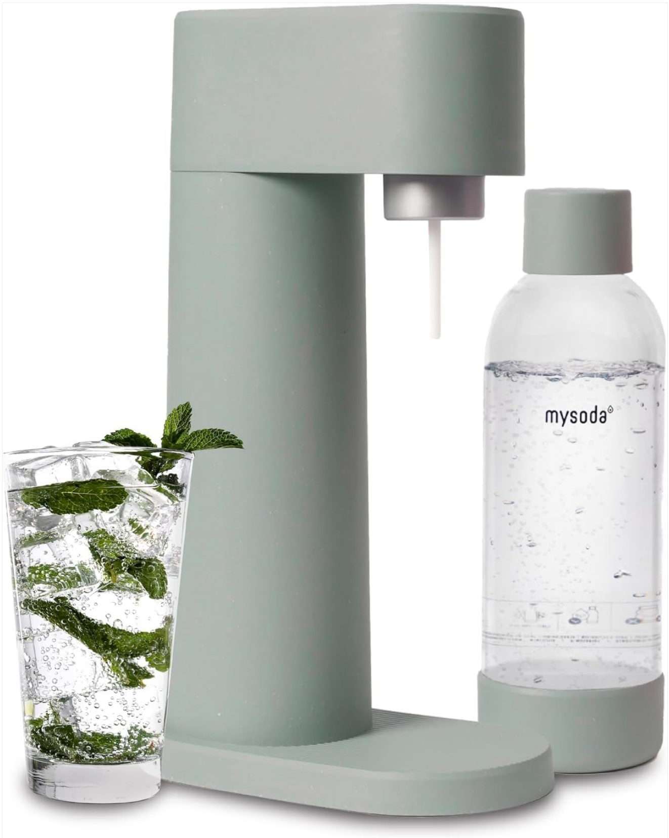
Image: Mysoda Woody Sparkling Water Maker in sage green with a 1L water bottle and a glass of sparkling water with mint. This image displays the Mysoda Woody Sparkling Water Maker in sage green, accompanied by its clear 1-liter water bottle. A glass filled with ice, sparkling water, and fresh mint leaves is positioned next to the machine, illustrating its primary function.