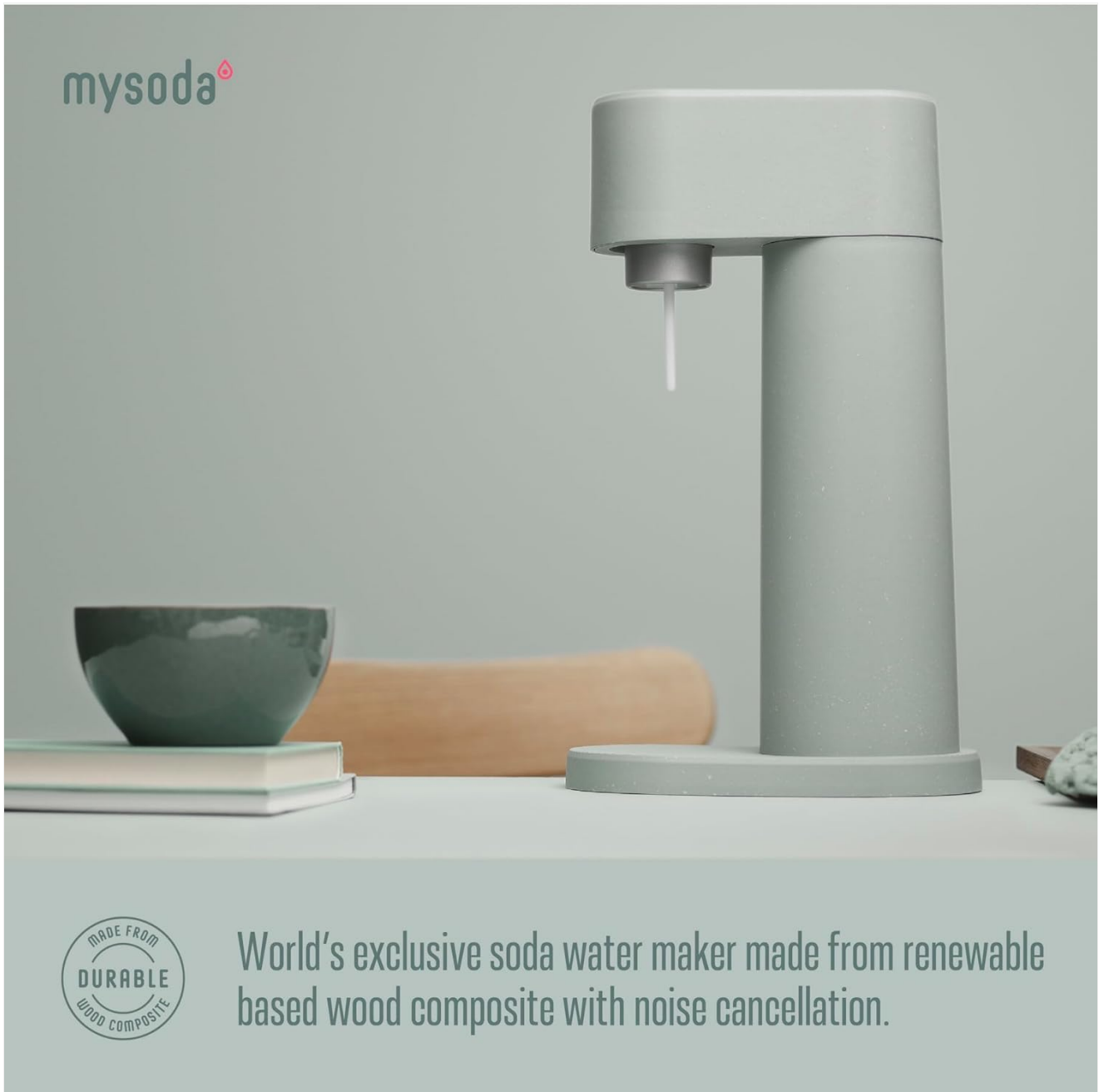
Image: Mysoda Woody Sparkling Water Maker highlighting its renewable wood composite material and noise cancellation feature. An image of the Mysoda Woody Sparkling Water Maker with text emphasizing its construction from renewable wood composite and its noise cancellation capabilities.