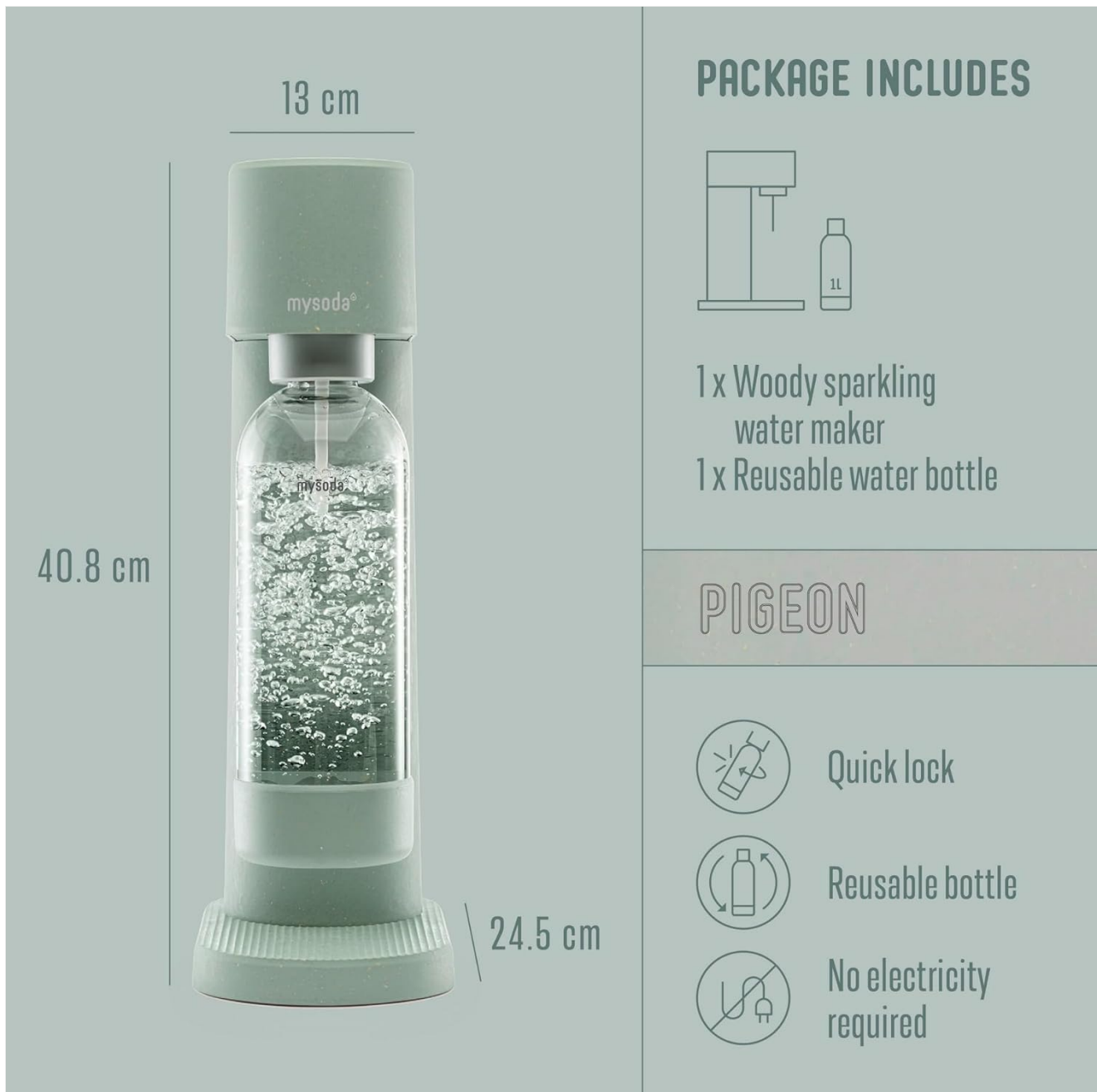
Image: Diagram showing dimensions of the Mysoda Woody Sparkling Water Maker and listing package contents: machine and 1L reusable bottle. This diagram provides the physical dimensions of the Mysoda Woody Sparkling Water Maker, including its height (40.8 cm), width (13 cm), and base depth (24.5 cm). It also lists the package contents: one Woody sparkling water maker and one 1-liter reusable water bottle.