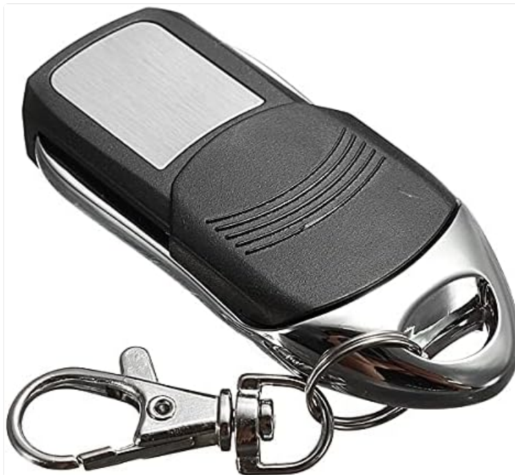
Figure 3: Back view of the remote control, displaying the smooth, metallic back panel and the attachment point for the keychain.