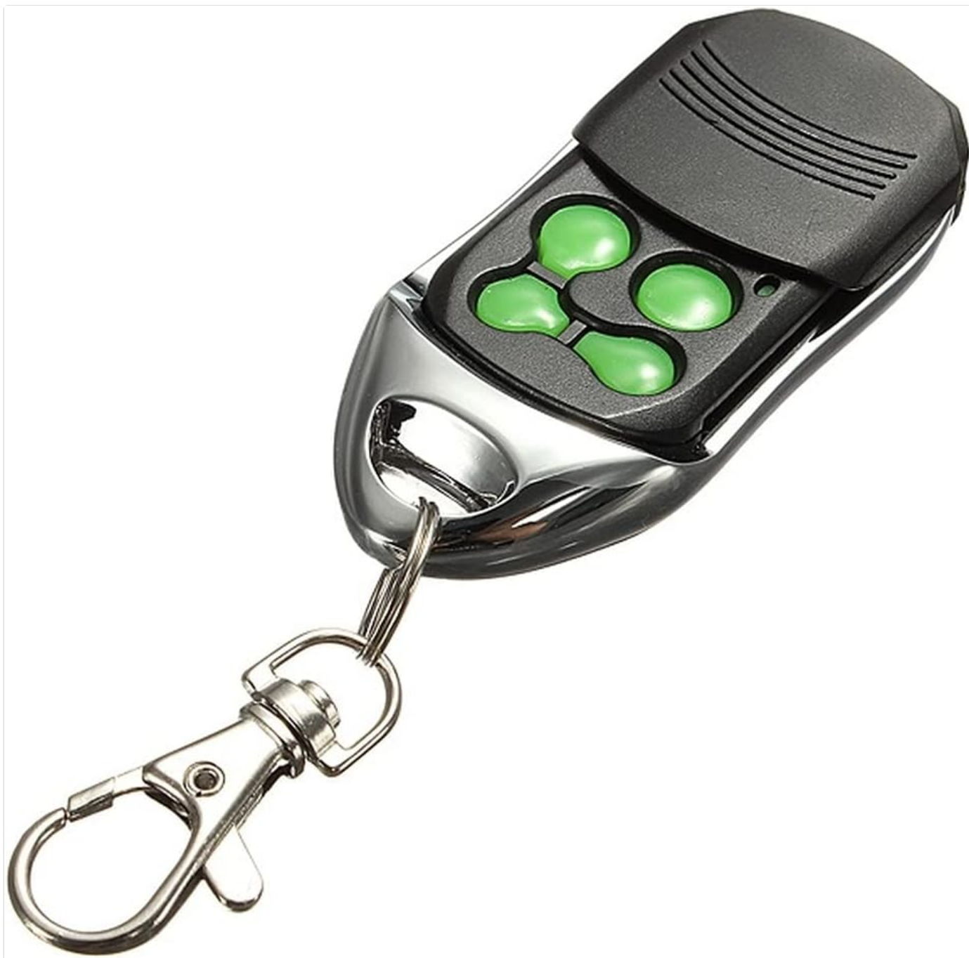
Figure 1: The remote control unit, featuring a black casing with green buttons and a metallic keychain attachment. This is the primary view of the product.