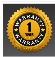
Image: A visual representation of the product warranty. Note: The product description states a 2-year warranty, while an image from A+ content shows "1 Year Warranty". The text description from feature bullets is prioritized for accuracy.

Your TCL 43P725 TV comes with a 2-year comprehensive warranty provided by the manufacturer from the date of purchase. Please refer to the included warranty card for detailed terms and conditions.