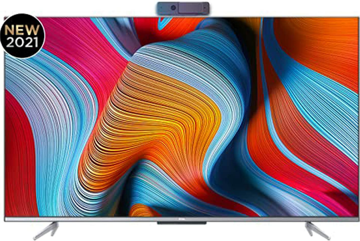
Image: Front view of the TCL 43P725 TV, illustrating its physical dimensions.