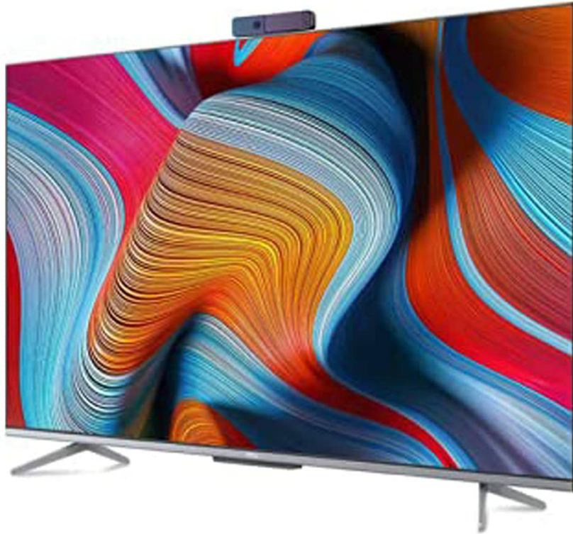
Image: Side profile of the TV, illustrating the location of various input/output ports.