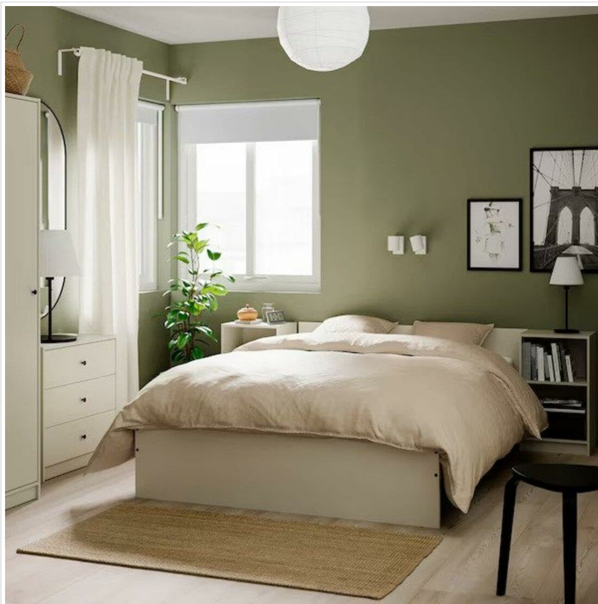
Image 5.2: The GURSKEN chest integrated into a bedroom environment.