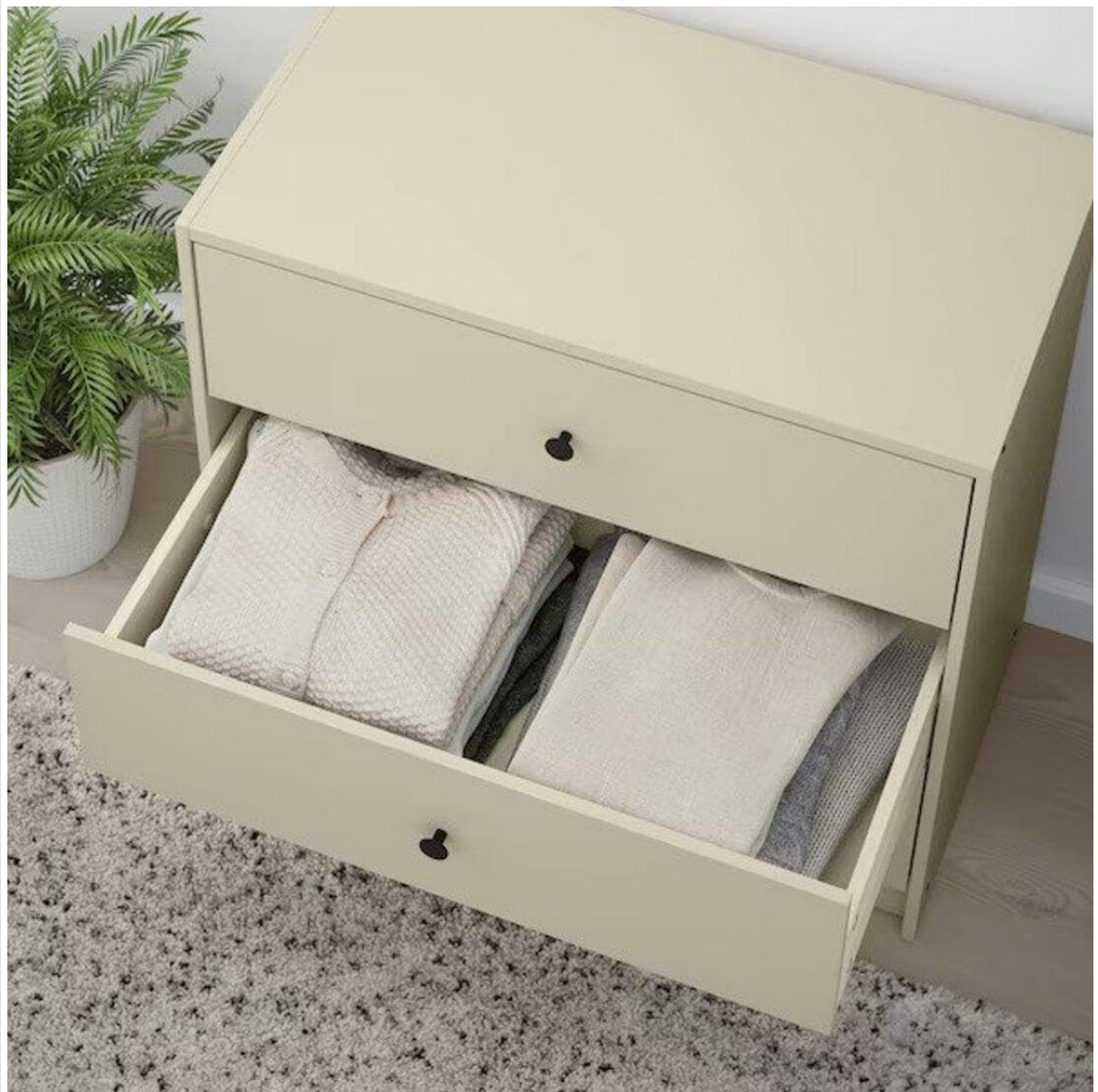
Image 5.1: An open drawer showcasing storage capacity for folded garments.