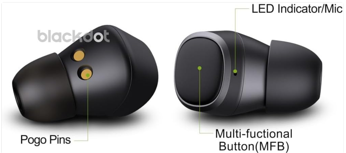
Image 3.1: Detailed view of an earbud showing Pogo Pins, Multi-functional Button (MFB), and LED Indicator/Microphone.