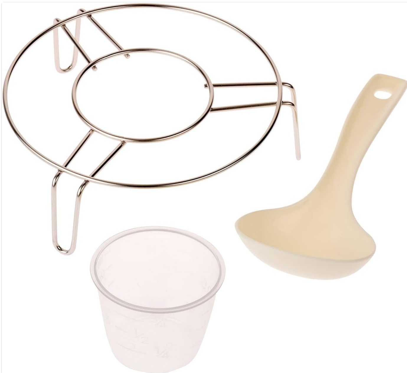
Figure 2: Included Accessories

This image shows the steam rack, measuring cup, and serving ladle that come with the Russell Hobbs Multicooker.