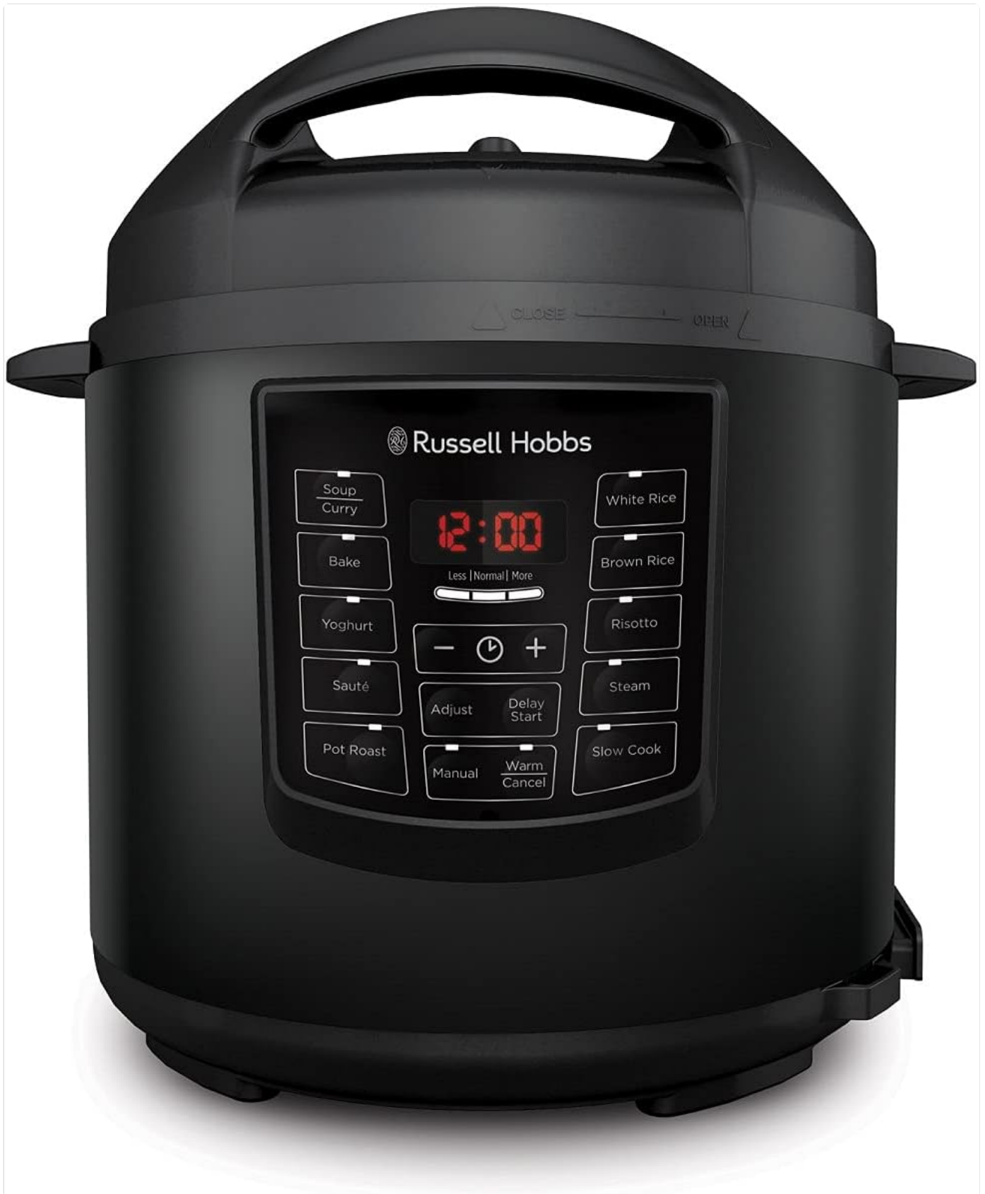
Figure 1: Russell Hobbs 11-in-1 Digital Multicooker (RHPC3000)

This image displays the Russell Hobbs 11-in-1 Digital Multicooker in its matte black finish, showcasing its compact design and front control panel.