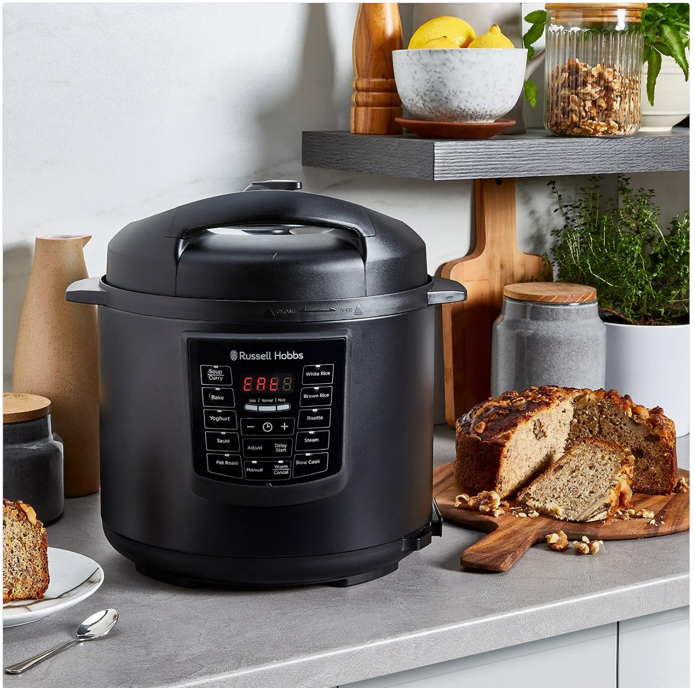
Figure 4: Multicooker in use for baking

This image shows the Russell Hobbs Multicooker on a kitchen counter, demonstrating its use for baking, with a freshly baked cake beside it.