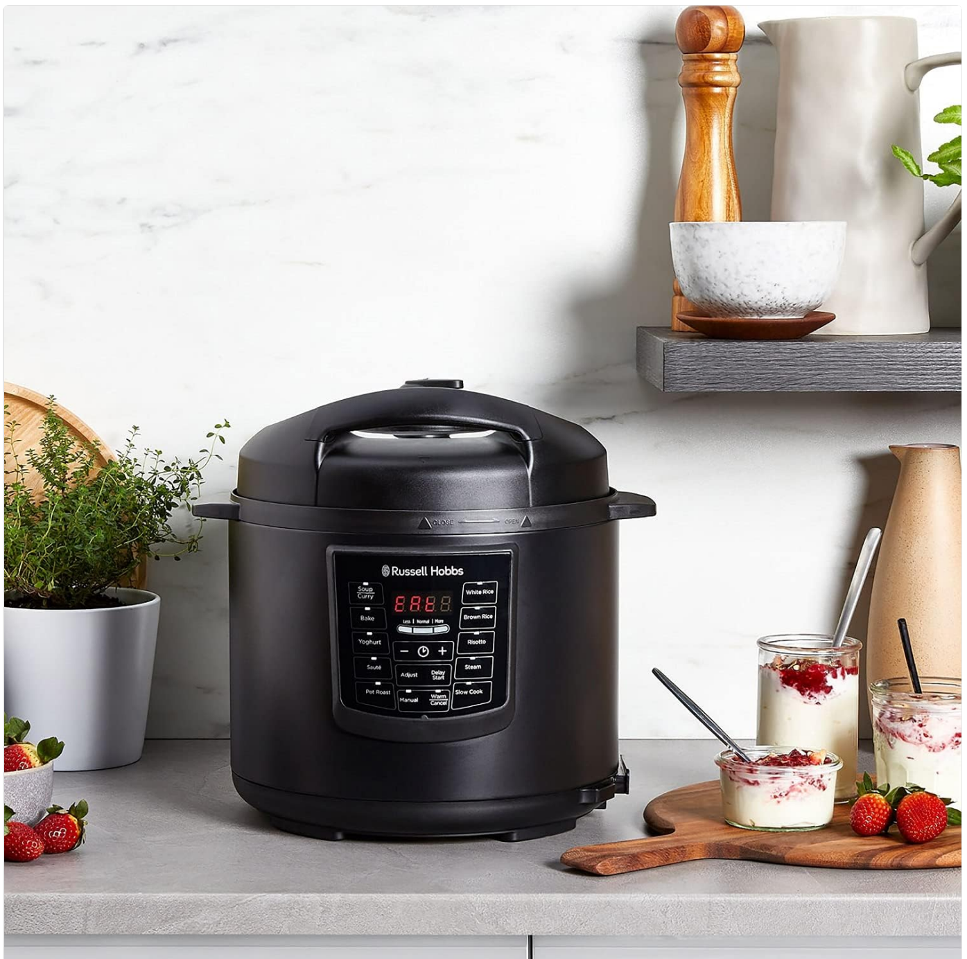
Figure 5: Multicooker in use for yogurt

This image shows the Russell Hobbs Multicooker on a kitchen counter, demonstrating its use for making yogurt, with prepared yogurt cups nearby.