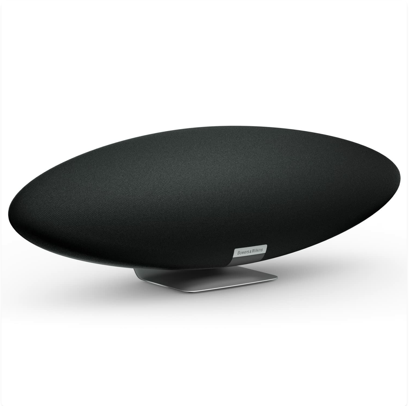
Figure 1: The Bowers & Wilkins Zeppelin Wireless Speaker in Charcoal finish.