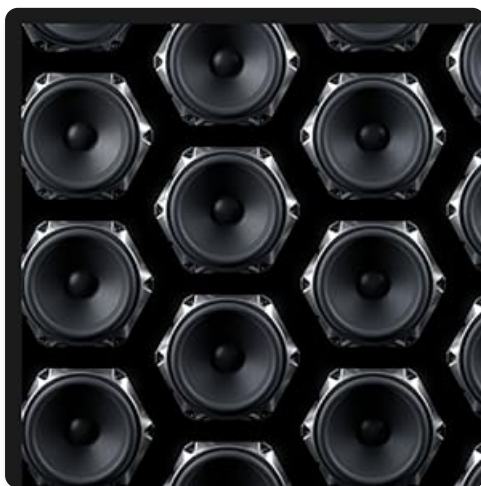
Figure 2: Internal driver layout, highlighting the subwoofer, midrange drivers, and tweeters.

The speaker's dimensions are approximately 7 inches deep, 26 inches wide, and 7 inches tall, with a weight of 16.1 pounds. It is constructed from cloth, metal, plastic, and rubber materials.