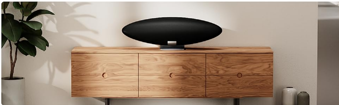
Figure 4: Example placement of the Zeppelin speaker on furniture.