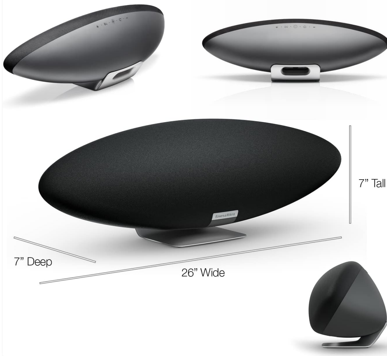
Figure 3: Side view of the Zeppelin speaker with approximate dimensions.