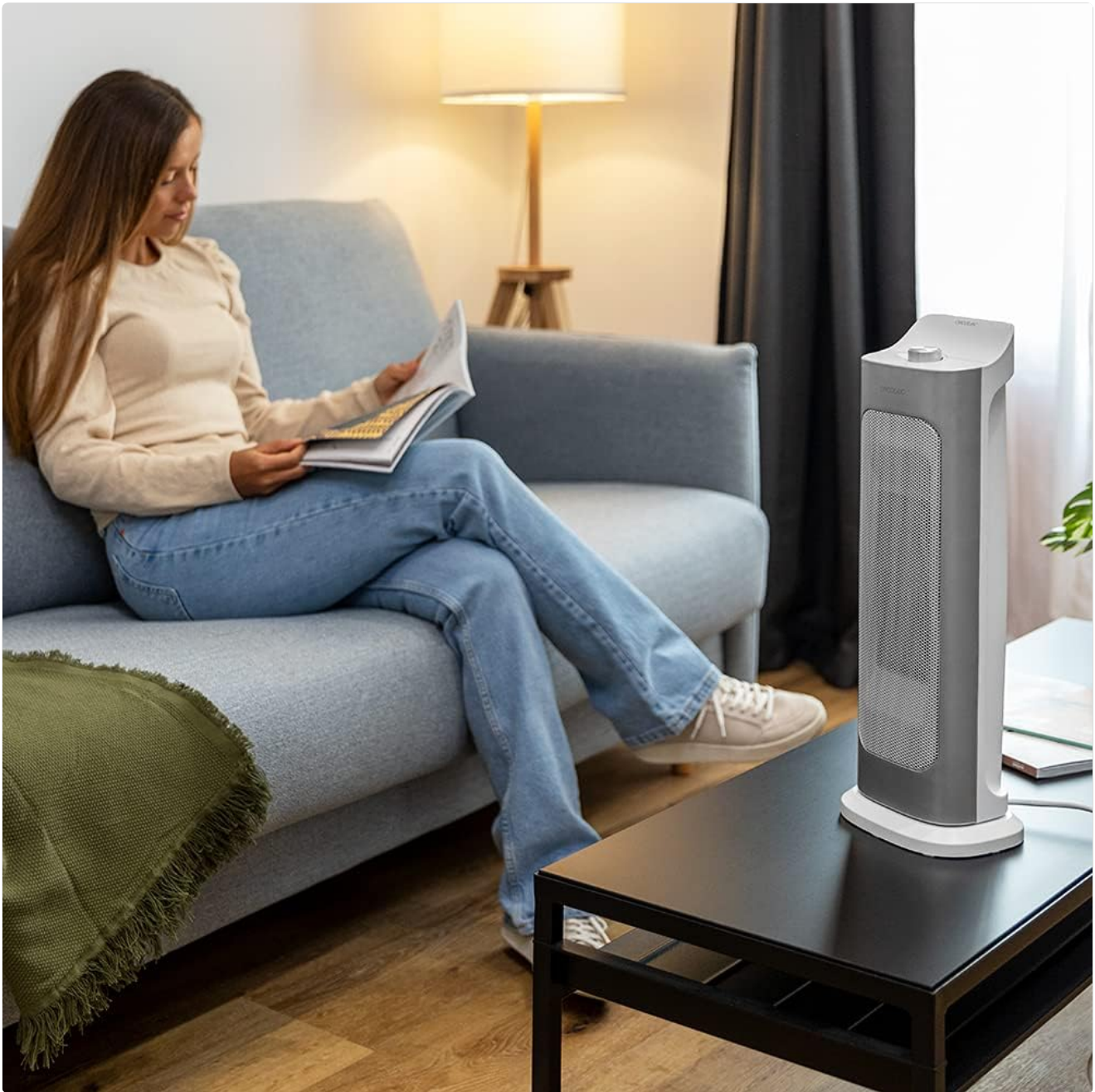
Image: The Cecotec Ready Warm 6700 Ceramic Sky Heater positioned on a table in a living room, demonstrating its compact and vertical design.