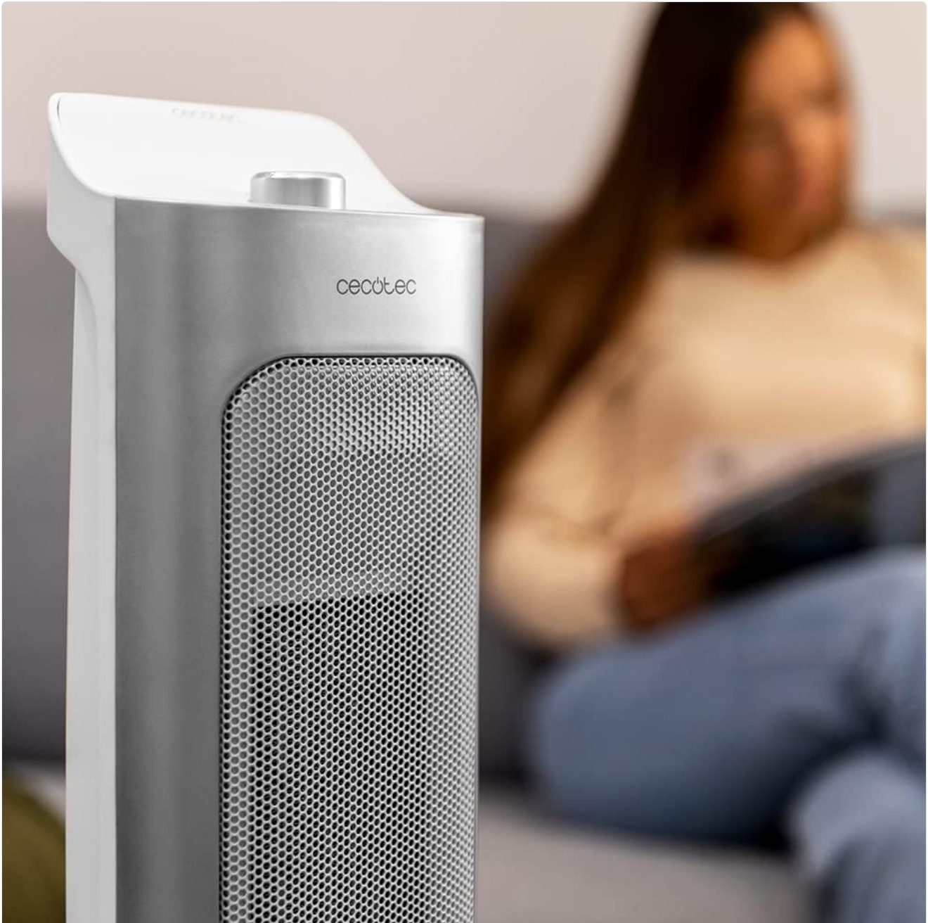
Image: A close-up view of the heater's protective grille, which should be kept clean for optimal performance.