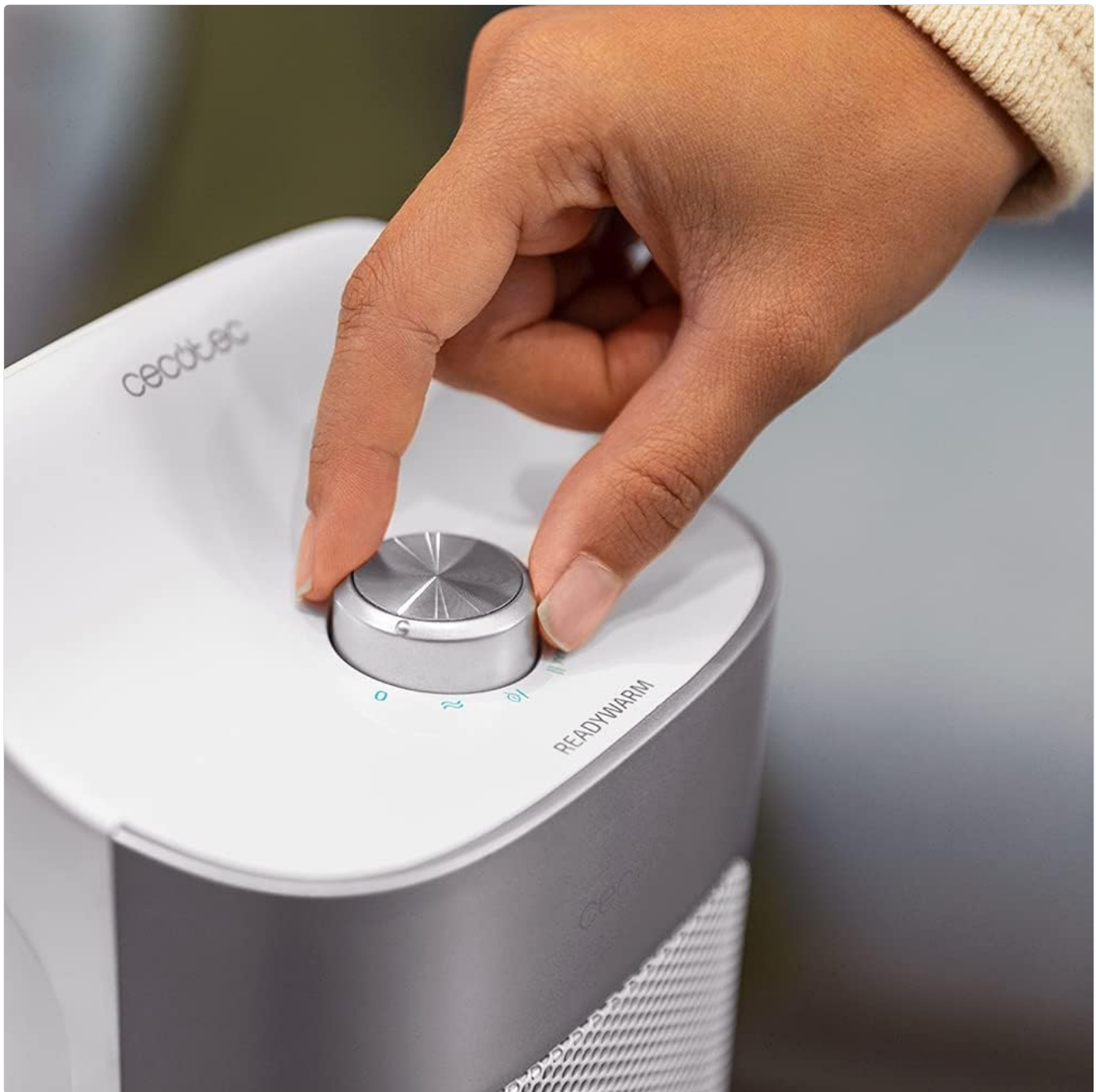
Image: A hand turning the control dial on the Cecotec Ready Warm 6700 Ceramic Sky Heater, illustrating the intuitive manual operation.