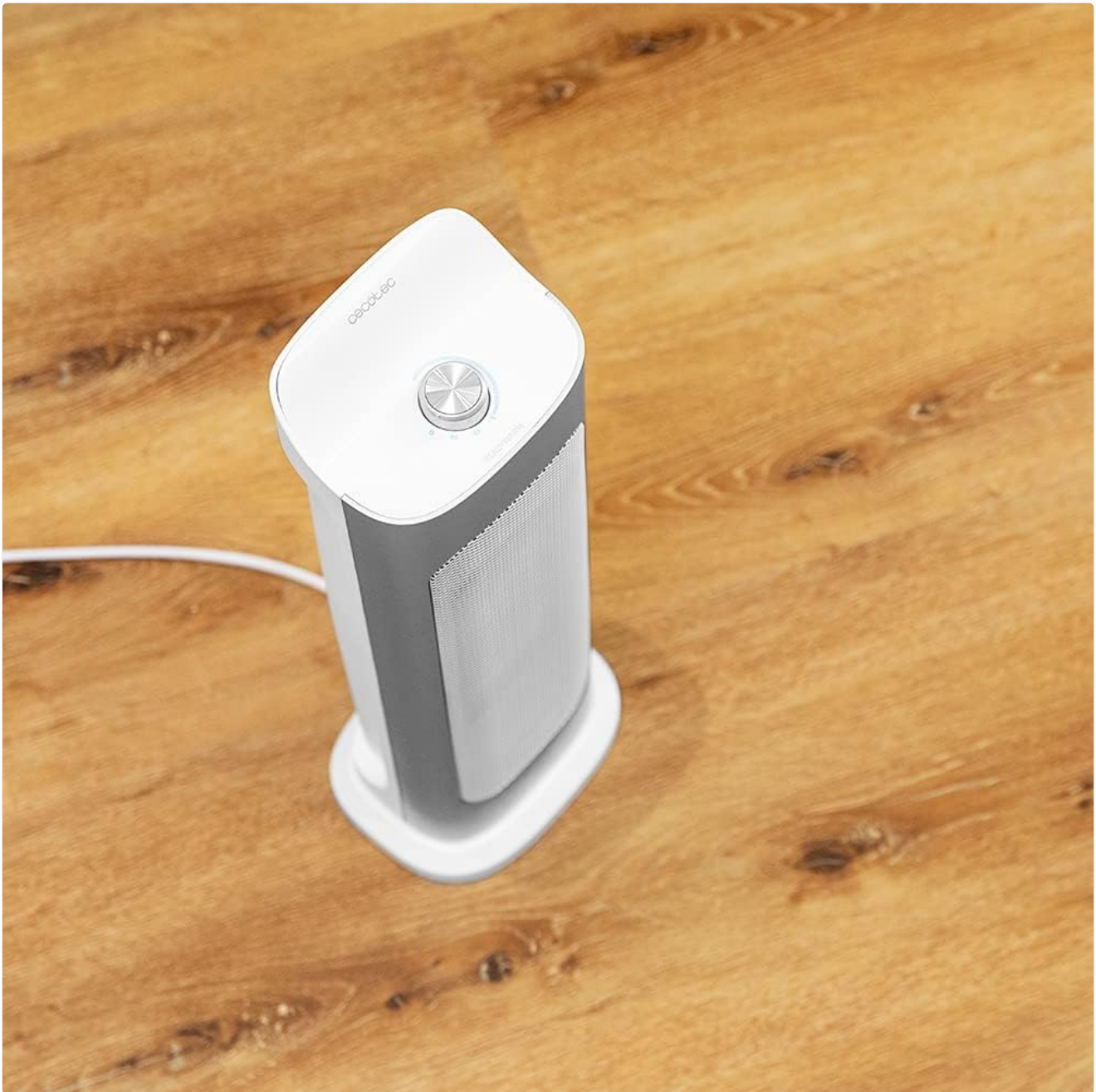
Image: A top-down view of the Cecotec Ready Warm 6700 Ceramic Sky Heater, showing the single rotary control dial for mode and power selection.