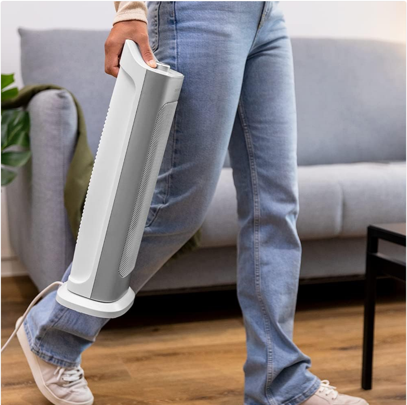
Image: A person carrying the Cecotec Ready Warm 6700 Ceramic Sky Heater, highlighting its lightweight and portable design for easy transport between rooms.