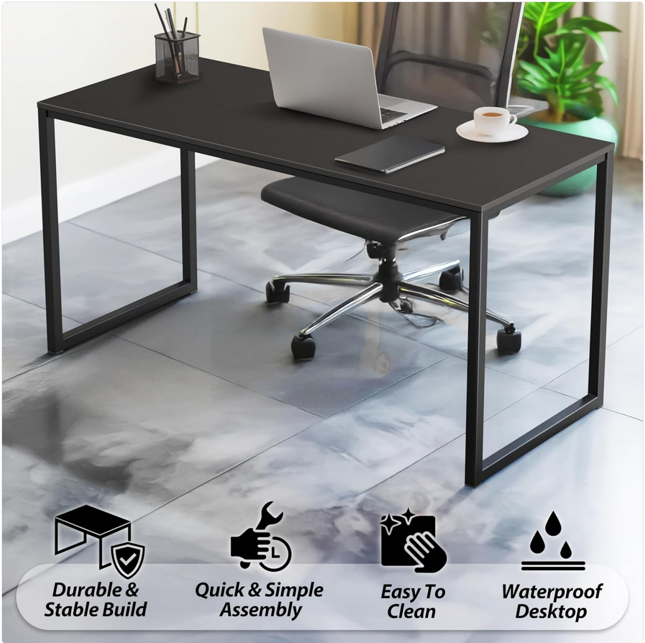
Image 6.1: Overview of the desk's durable and easy-to-maintain features.