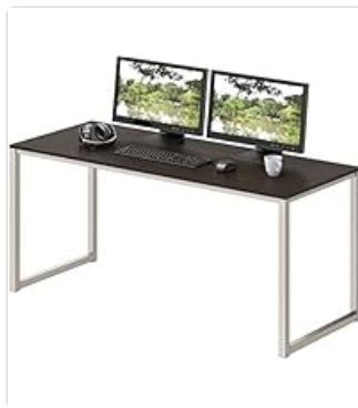
Image 6.3: The desk's waterproof surface repelling spilled liquid.