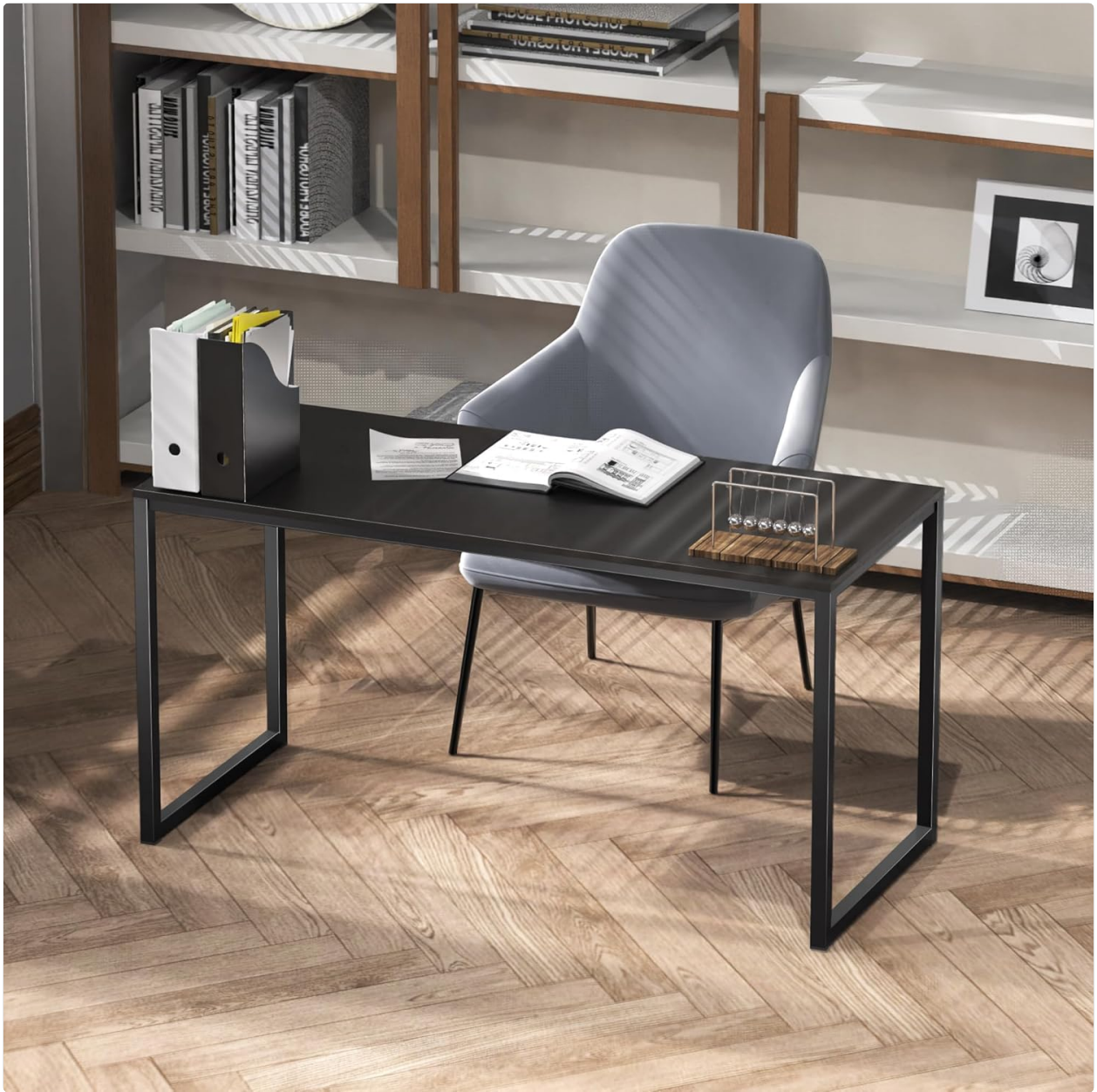
Image 5.2: The desk integrated into a contemporary home office environment.