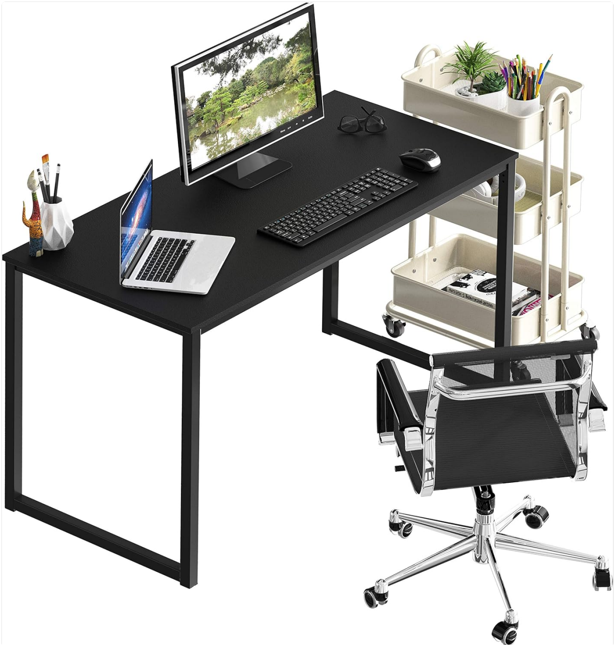
Image 5.1: The desk configured for a computer setup, demonstrating its functional design.