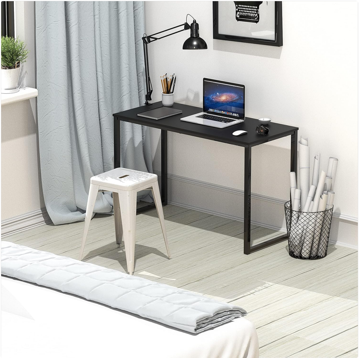
Image 1.1: The SHW Mission 32-Inch Home Office Computer Desk in a home office setting.