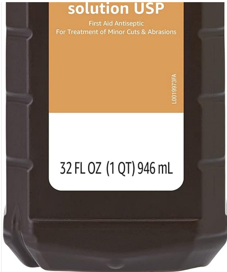
Image: Front view of the Amazon Basics Hydrogen Peroxide Topical Solution bottle, 32 fl oz (1 QT) 946 mL.