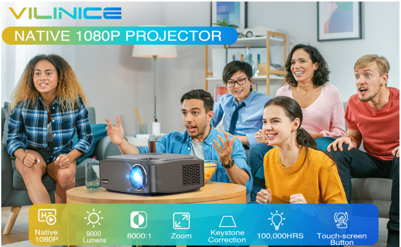
Image: The VILINICE BL89 Native 1080P Projector set up for a home theater experience, including a 100-inch screen.