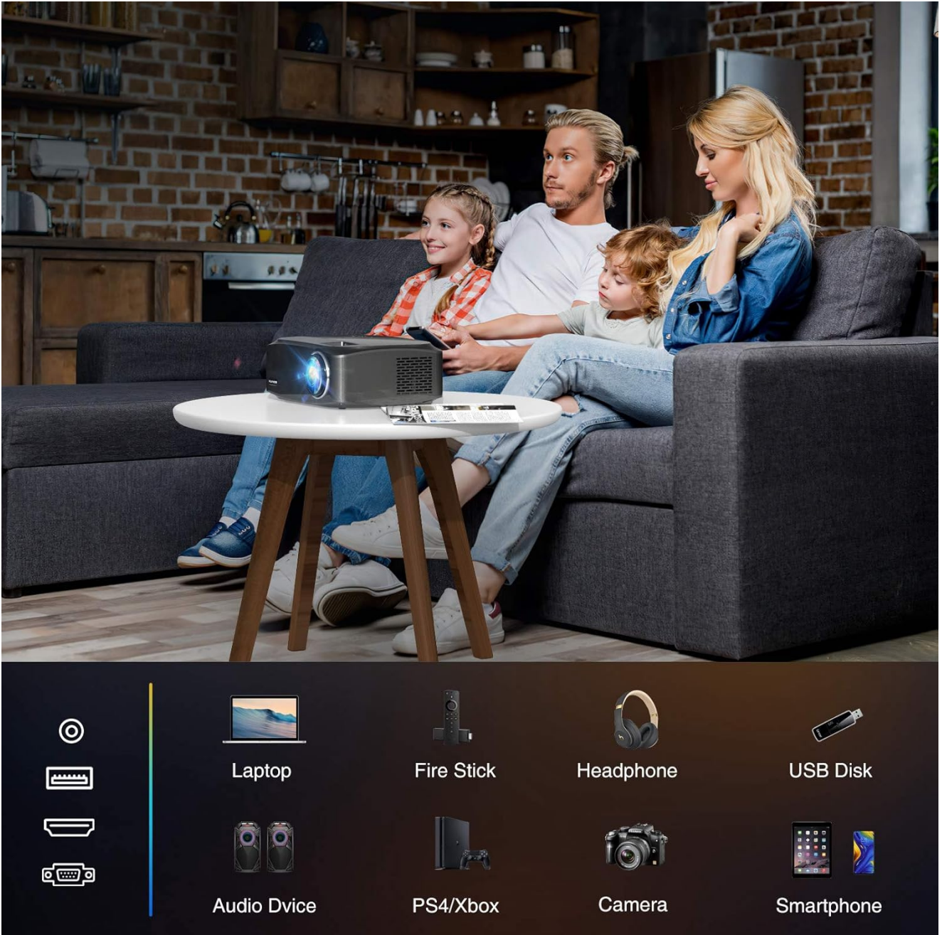
Image: Visual representation of compatible devices and their connection types for the VILINICE BL89 projector.