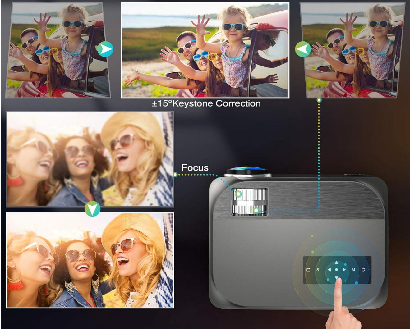
Image: Visual guide for adjusting keystone correction and focus on the VILINICE BL89 projector.