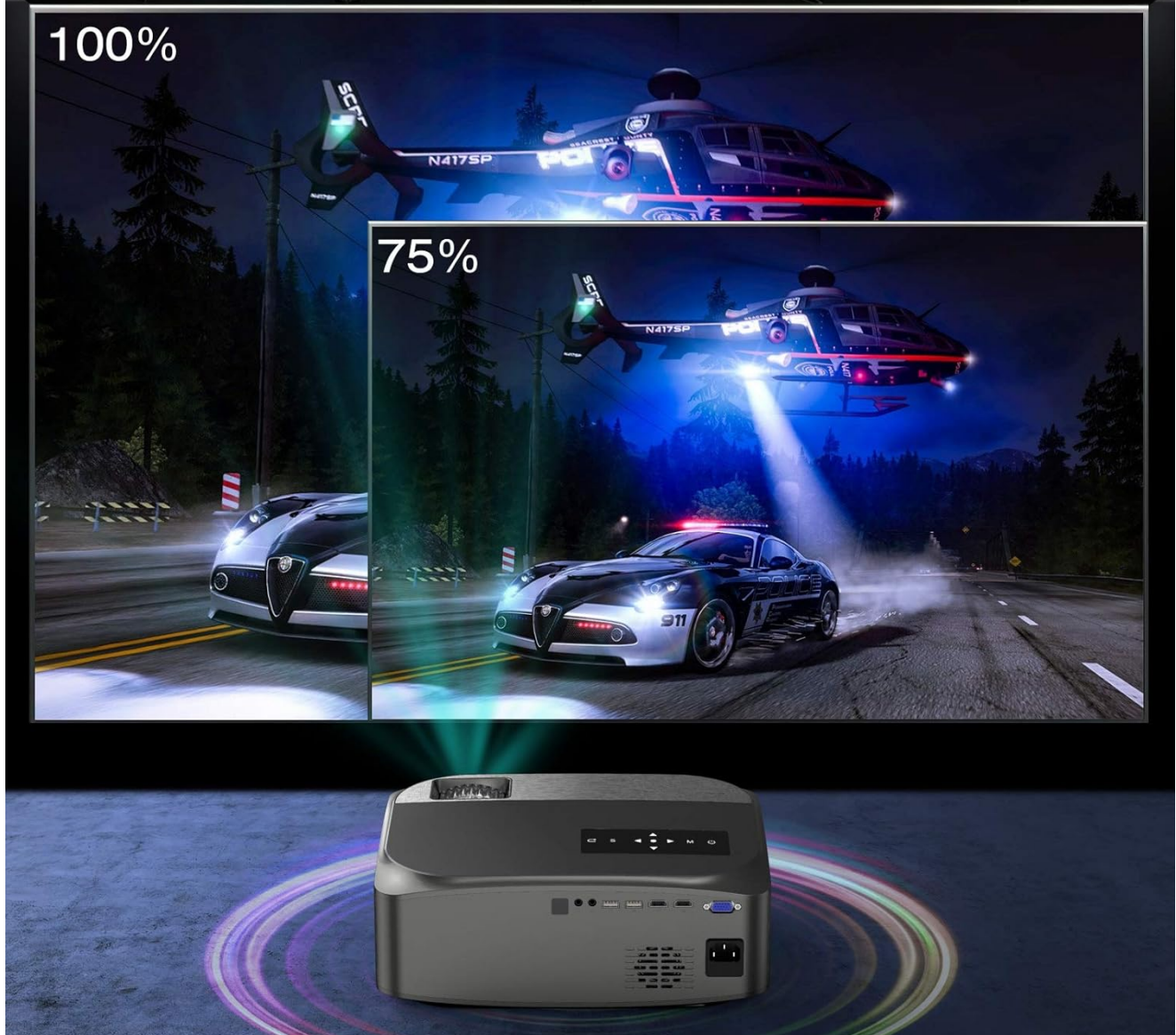
Image: An overhead view showing the VILINICE BL89 projector in use, emphasizing its integrated Hi-Fi stereo sound system.