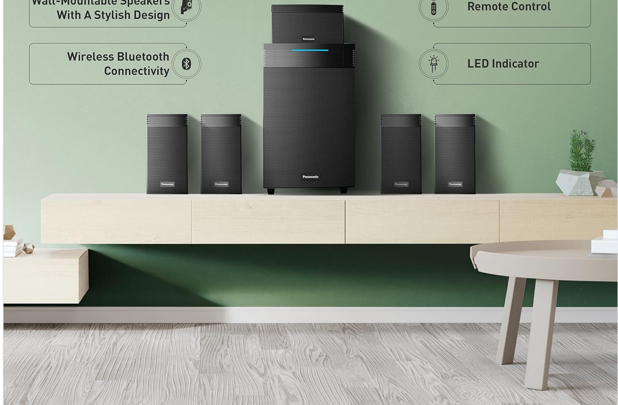
Image: The Panasonic Home Theatre system, illustrating its features including remote control functionality and LED indicator.