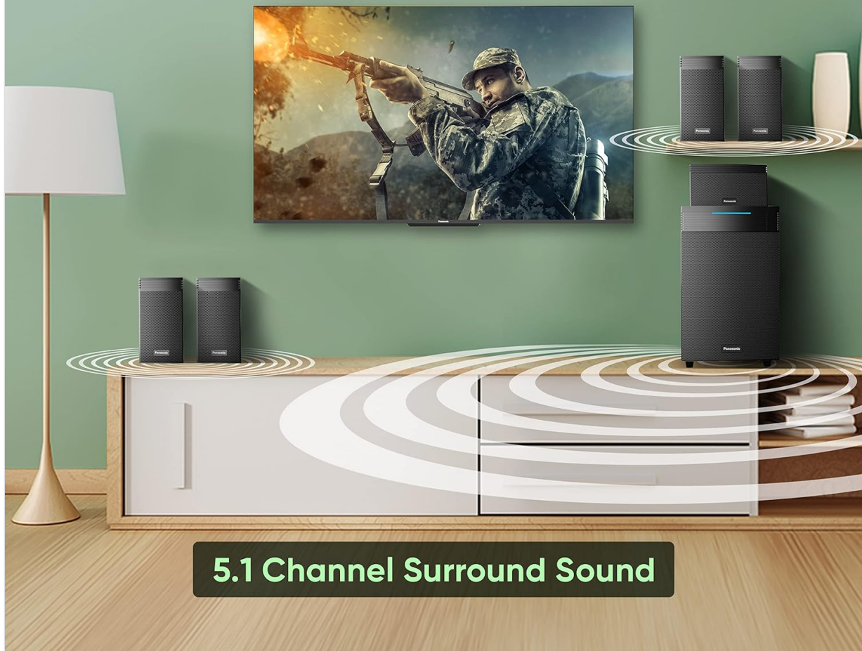
Image: Optimal 5.1 channel speaker placement for an immersive surround sound experience.