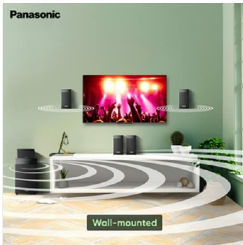
Image: Example of wall-mounted speakers integrated into a living space.