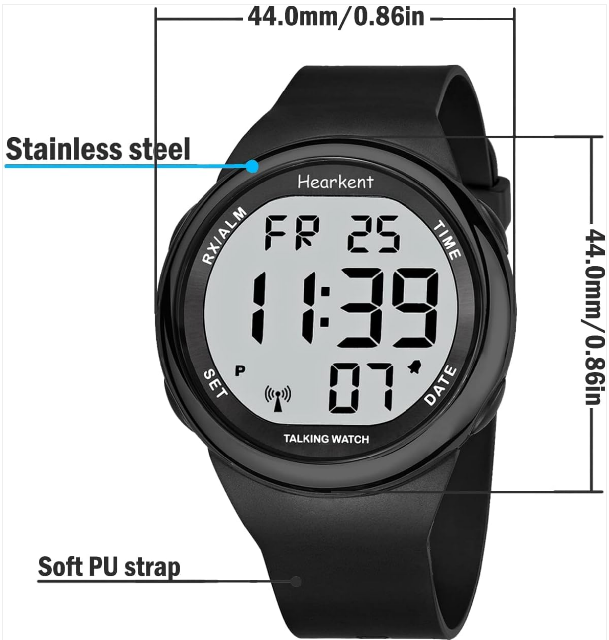
Image: Diagram showing the overall dimensions of the watch case.