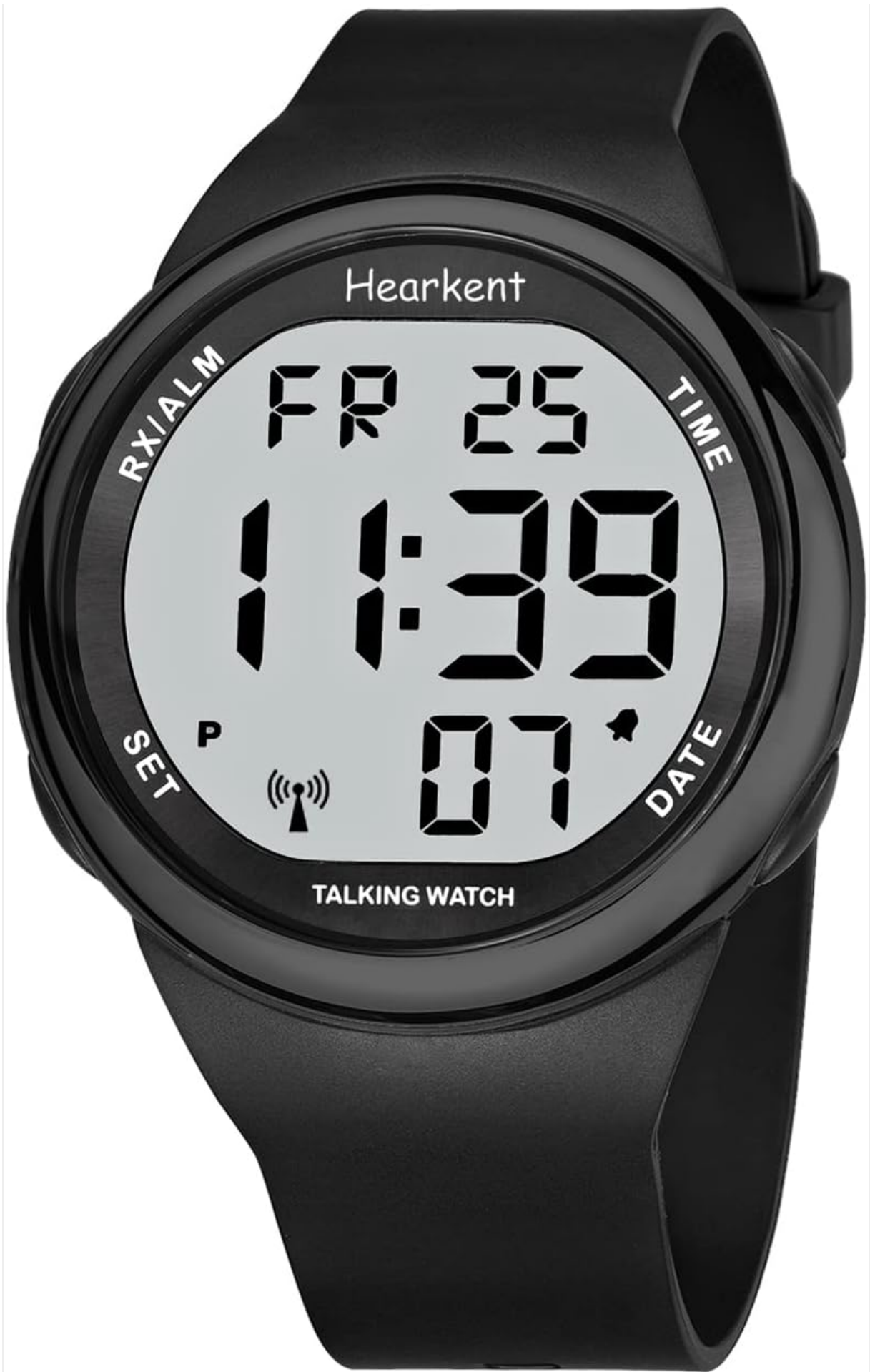
Image: Front view of the Hearkent Atomic Talking Watch TG2105LCD, showcasing its large digital display and black finish.