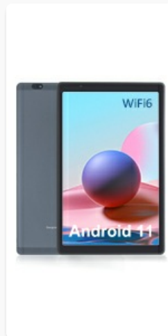
Figure 3: Tablet Features and Ports

The weelikeit Kids Tablet features a 7-inch IPS HD display, dual cameras (2MP front, 5MP rear), and a durable kid-proof case with an integrated stand. It is equipped with a 1.5 GHz quad-core processor, 2GB RAM, and 32GB ROM, expandable up to 256GB via an SD card.