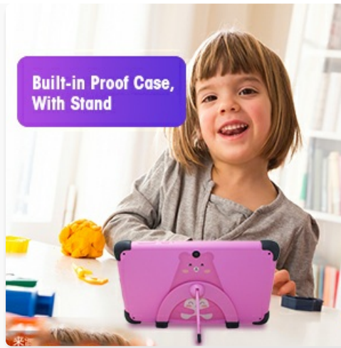
Figure 4: Built-in Kid-Proof Case with Stand