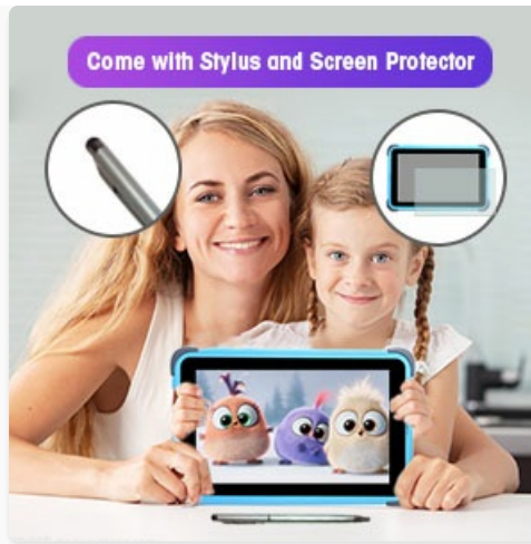
Figure 2: Stylus and Screen Protector included with the tablet.