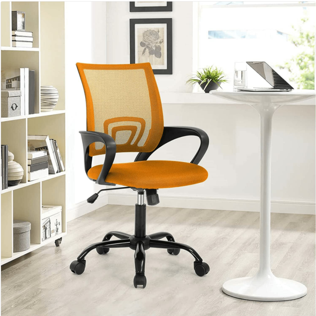
A front-side view of the YIQIEDEY GL-VN-H03 Ergonomic Mesh Office Chair, showcasing its orange mesh backrest, padded seat, fixed armrests, and five-star base with casters.