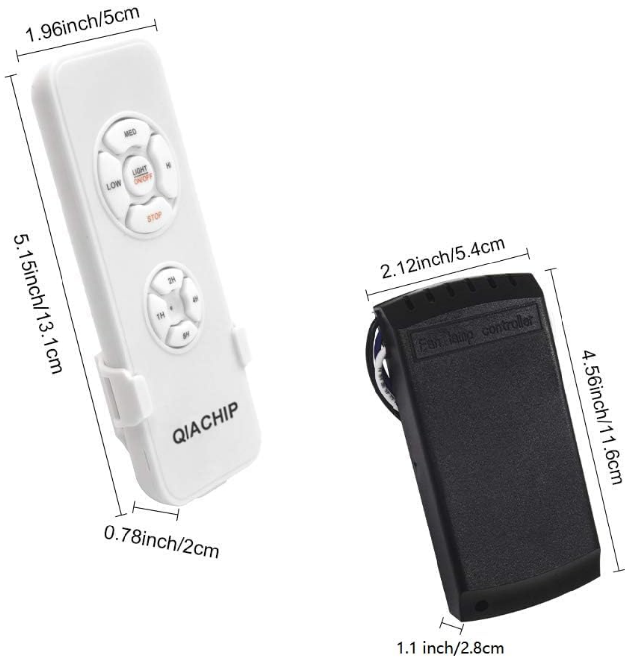
Figure 7: Dimensions of the remote control and receiver.