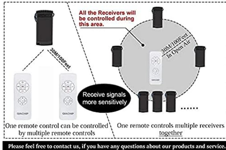
Figure 5: RF remote control pairing instructions.