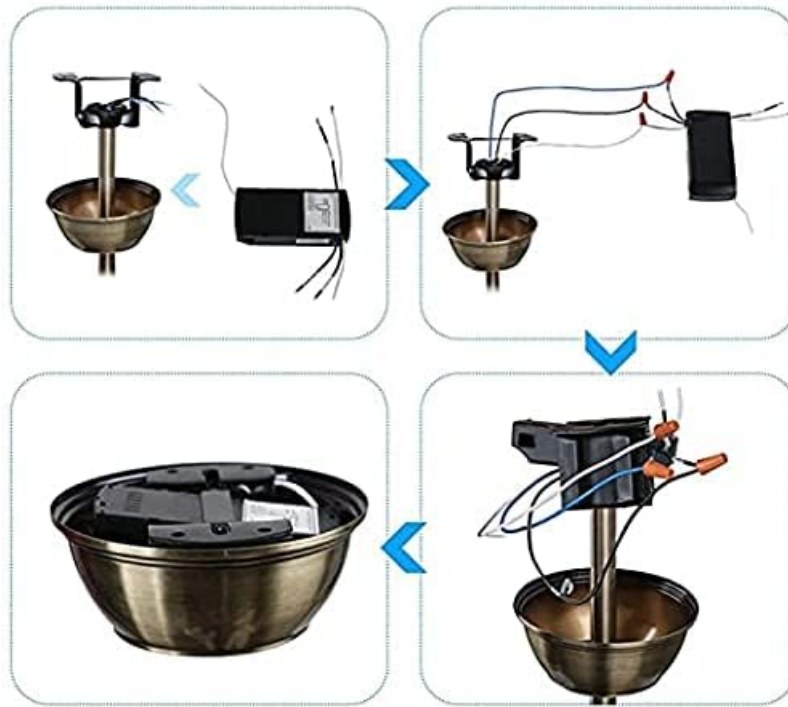
Figure 3: Visual guide for receiver installation within the fan canopy.