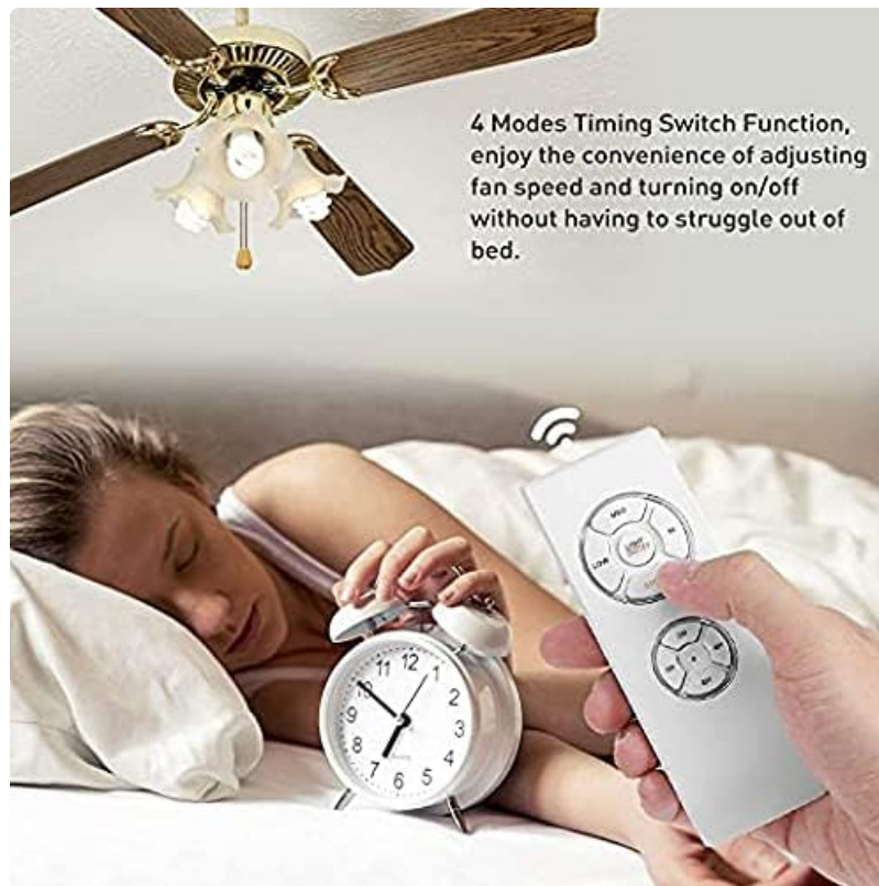
Figure 6: Enjoying the convenience of the timing-off function from bed.